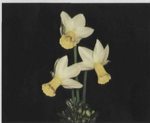
Fowlds Award 'Rapture' 6 Y-Y