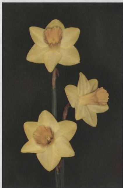
Rose Ribbon Bender 80/3 1 Y-P Bill Bender