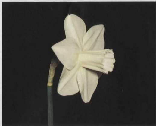
Gold Ribbon 'Peggy White' 2 W-W