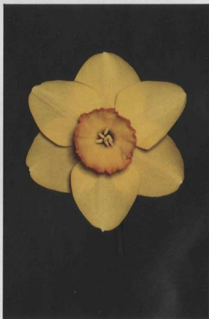
Blue Ribbon Class 10 'Pacific Rim' 2 Y-YYR Martha Kitchens