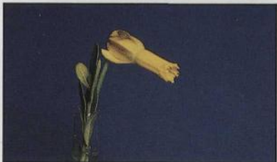
Link #3084 6 Y-Y N. cyclamineus x Mite O.P. Mini Rose