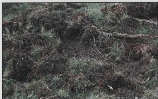
Puerto de Pajares ski area. Destruction of N. asturiensis habitat. Note naked bulbs on surface.