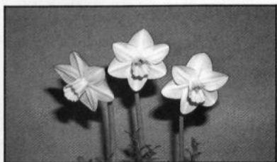
Williamsburg 2 W-W White Ribbon, Portland