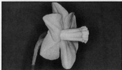
Peggy White 2 W-W Gold Ribbon, Richmond