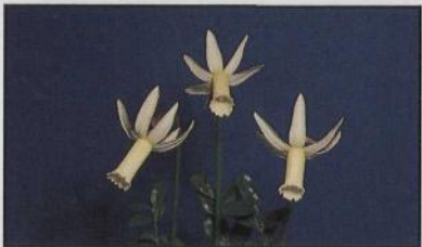
Snipe 6 W-W Mini-White