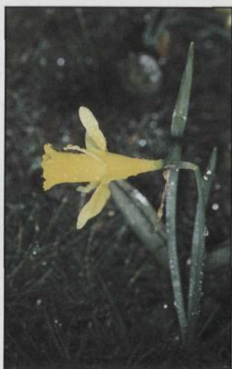
Cross between N. bulbocodium and N. pseudonarcissus nobilis primagenius Cantabrica