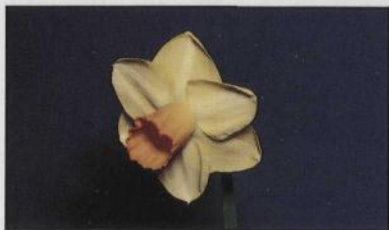
Havens VH19/1 Rose Ribbon