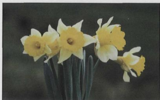
Single floriferous clump of pseudonarcissus nobilis Picos de Europa