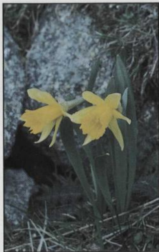
N. pseudonarcissus concolor Sierra de Gredos