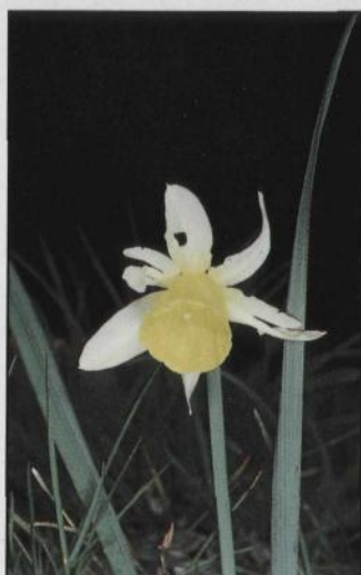
Cross between N. triandrus triandrus and N. pseudonarcissus nobilis "Bicolored Queen of Spain" Cantabrica