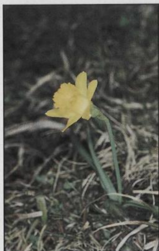
Good form of N. asturiensis Asturias