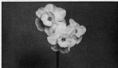
Blanchard 72/25D 8 W-W Ringstead x N. dubius Miniature Gold, Portland