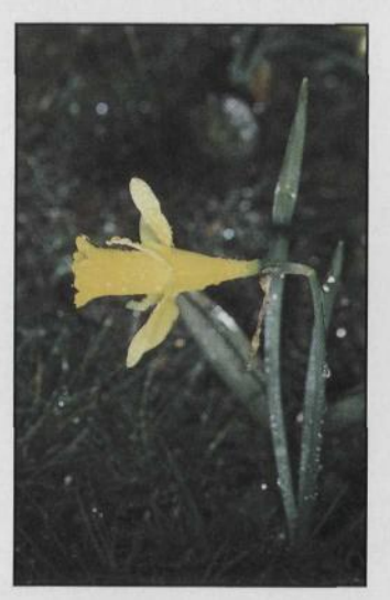
Cross between N. bulbocodium and N. pseudonarcissus nobilis primagenius Cantabrica