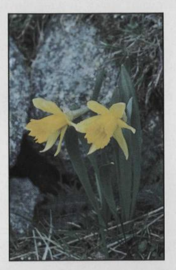
N. pseudonarcissus concolor Sierra de Gredos