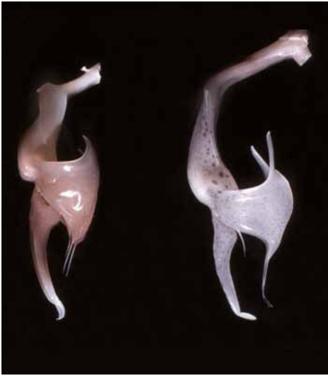
Lateral view of the lips of Embreea herrenhusana (left) and Embreea rodigasiana (right) (from preserved material)