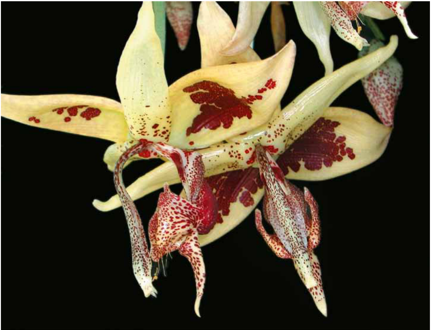
Embreea herrenhusana