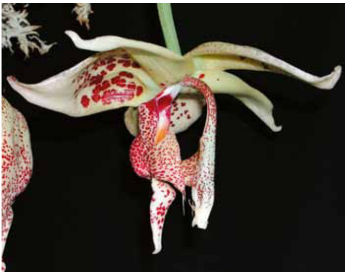
Another clone of Embreea herrenhusana