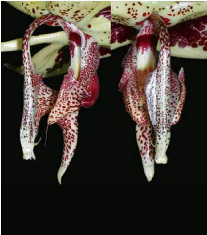
Lip of Embreea herrenhusana

short-rectangular, bridge long, narrow at base, triangular in front, ending in a callus with three long, sharp bristles. Outer edge at hypochil sharply triangular at base and not bent. Transition to mesochil smooth. Horns broad and flat in cross-section at the base, ending in front in very long, sharp bristles and towards base in a elongated tooth. Epichil thick and elongated triangular with a distinct hump near the base.