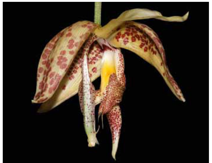
Another clone of Embreea herrenhusana (I. Pape)