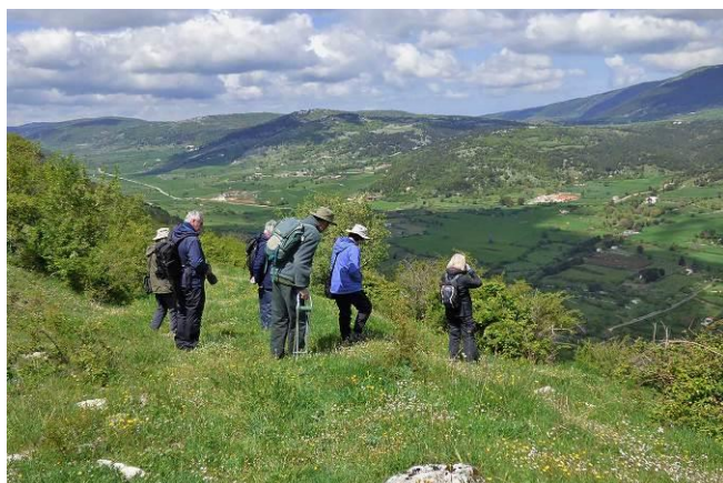
On the Pilgrims path below Monte Sant'Angelo