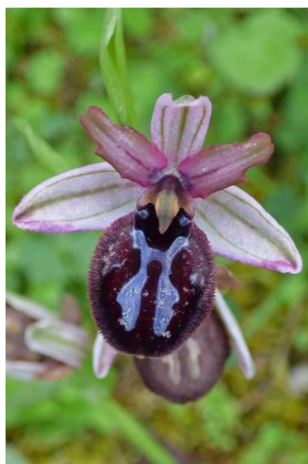
Ophrys sphegodes ssp sipontensis

Report compiled by Andrew Cleave