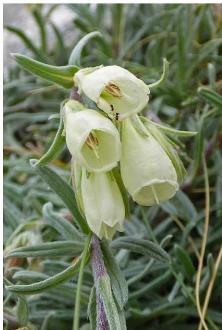
Onosma (lucana) echioides