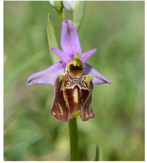
Late Spider Orchid