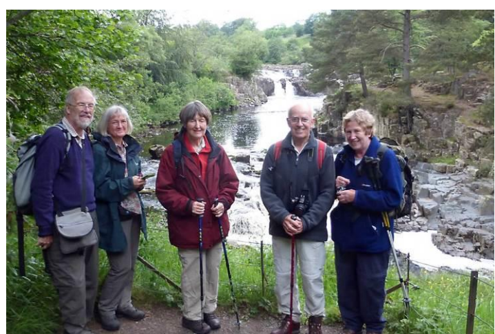
The 2014 Naturetrek Group