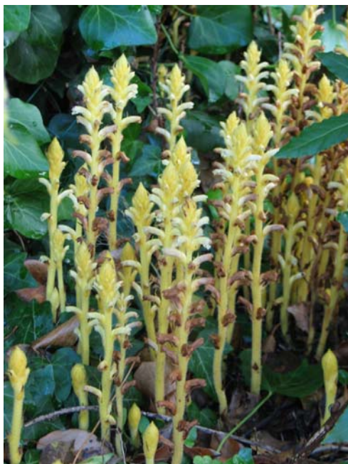
Orobanche hederæ var. monochroma