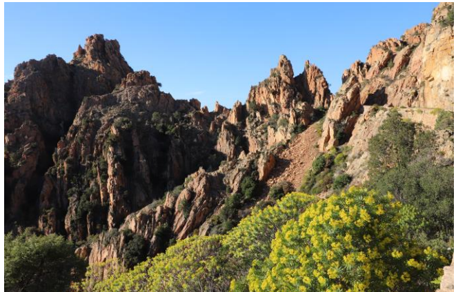
Calanches de Piana