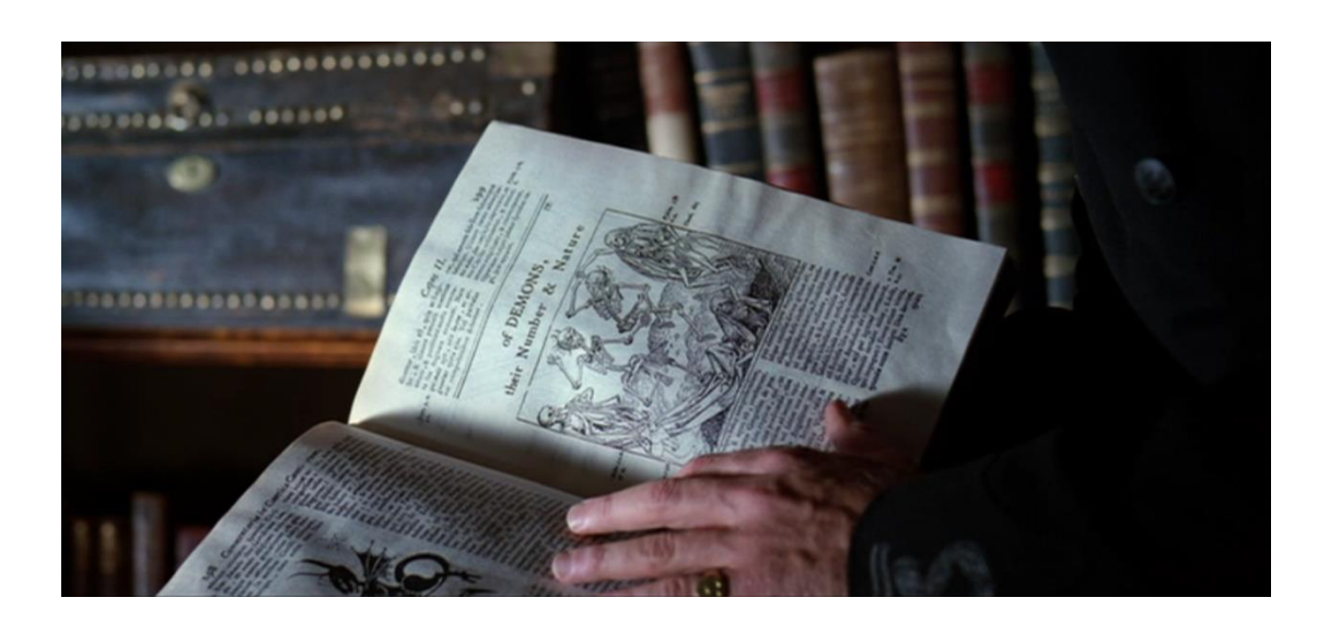
Fig. 2.1 Hamlet's library of supernatural tomes.

As the scene progresses the uncanny robotic stillness of the Ghost is exchanged for more traditional imagery of supernatural horror as Hamlet races through a gothic forest. With smoke rising from the ground, the setting accords with the Ghost's own conceptualisation of hell as 'sulph'rous and tormenting flames' (1.5.736), but also Hamlet's account of 'this witching time of night' as being when 'hell itself breathes out' (3.2.358-9). The Ghost's first seven lines in the scene are then delivered through a disembodied voice with reverberation and distortions placed on the words to further distance the sense of the Ghost having an identifiably human — or once human — form. The Ghost's true existence as a purgatorial spirit would have been anathema to the Protestant Hamlet and the film plays upon this knowledge to offer alternate explanations of what the figure of Hamlet Sr. is, building dramatic tension by delaying the moment of revelation.<sup>53</sup>