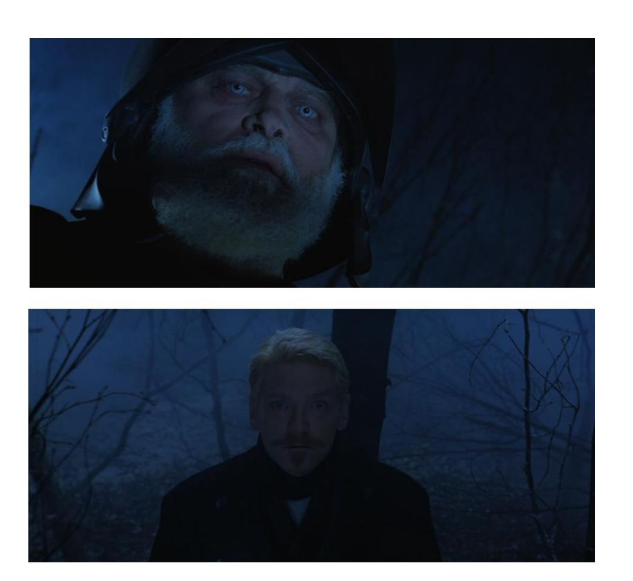
GHOST: I am thy father's spirit (1.5.9).