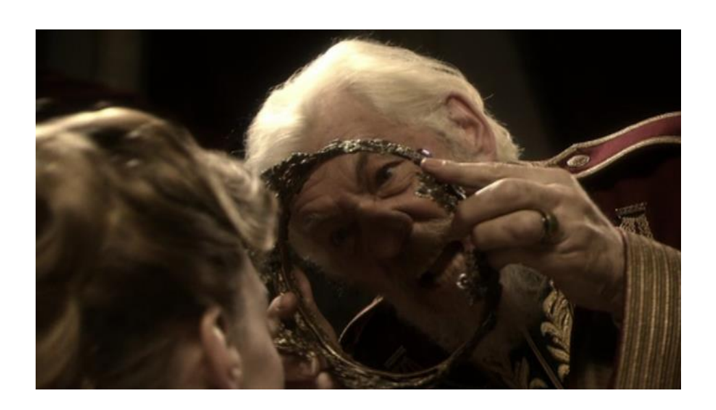
Fig. 1.7 Lear mockingly tells Cordelia of her disinheritance.

is worth torturing.'<sup>80</sup> Indeed, this production does not shy away from the implications of an abusive, violent Lear. McKellen's personal play script for the original RSC production of King Lear at Stratford-upon-Avon is peppered with telling comments such as 'bully', 'strong in control', 'still powerful'; there are also references made to a whip as one of Lear's props (although this must have been later discarded).<sup>81</sup> In the subsequent film of this production, the wizened twinkle so beloved of his Gandalf in The Lord of the Rings is present but it is darkened by a calculating quality, wheedling and flirting to get his way. In accordance with Jaques's famous formulation of old age as 'second childishness', he is quick to anger and childishly cruel, hissing 'nothing' in Cordelia's face as he jeers at her through the frame of the crown.<sup>82</sup>