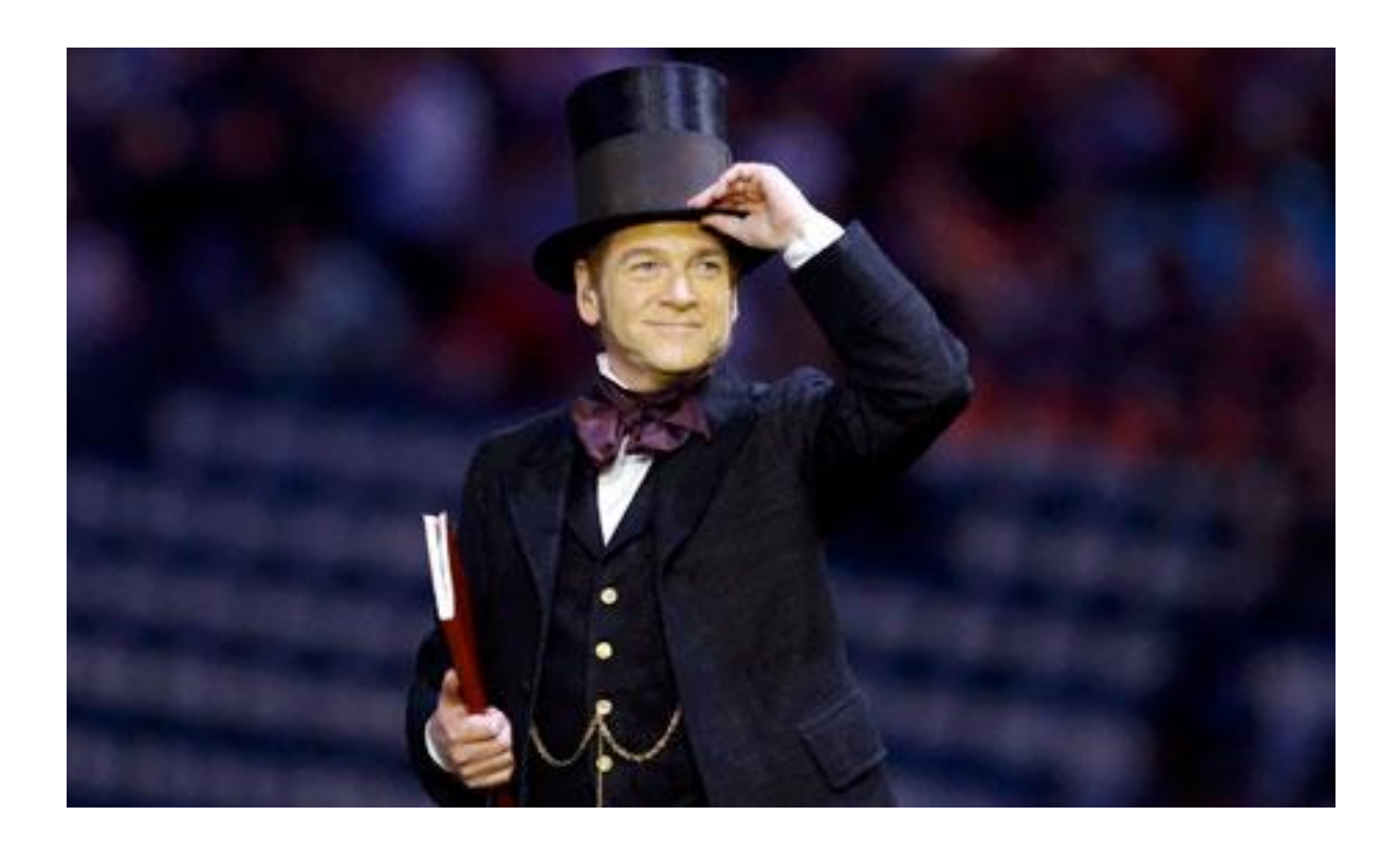
Fig. 2.7 Kenneth Branagh/Isambard Kingdom Brunel/Abraham Lincoln

The impact of Shakespeare's legacy upon Britain's culture was evident throughout the ceremony, appearing frequently in performance and in the staging. Newspaper columns forged out of play quotations, for example, presented Shakespeare's work as familiar, decontextualised phrases and as evidence of his cultural proliferation. Like Branagh or Spall's star turns, the presence of the quotations enacted a kind of cultural spotting, with pleasure afforded from recognising a 'high' cultural reference embedded within a mainstream event, and accessing the cultural cachet attached to said reference. According to traditional cultural hierarchies, the audience are rewarded for their 'good taste' and thereby gain admission to privileged secondary levels of meaning. Culture spotting thus gives the viewer an illusory sense of ownership through interpretation of both the Ur-text, and mastery over the text in which the reference was 'spotted'; illusory because, like Shakespeare's function within the ceremony as a whole, these quotations are manipulated to suit a particular use. This