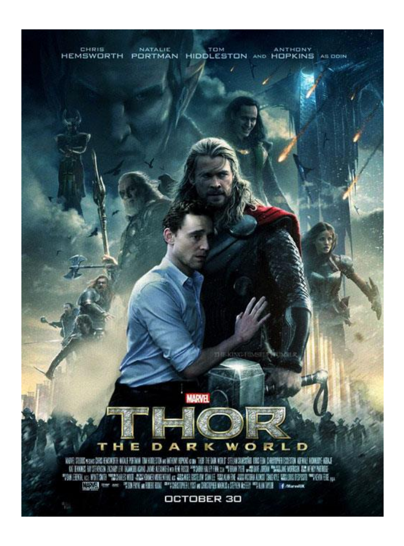
Fig. 3.11 The first example of the 'accidentally groping' meme

poster itself (see below) by the Tumblr user, The King Himself, gaining 35,000 notes in the first four days of being online. <sup>74</sup>