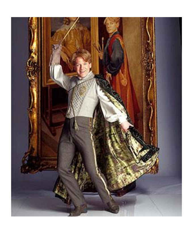
Fig. 2.4 A promotional image of Gilderoy Lockhart, dressed for a duel. 63

Indeed, The Chamber of Secrets recurs with mise-en-abîme demonstrating Lockhart's narcissistic obsession with his self-image. Figure 2.4 (above), a promotional photo, neatly summarises the depiction of the character within the film. Lockhart is stood, wand raised in a heroic action, his hand outstretched, pulling his cloak to the side to give the illusion of movement, accompanied by his personally vaunted, five-time award-winning smile. Behind him is a portrait within a portrait: his first portrait-self stands facing the painter, hand on hip assuming a pose of refined nobility, while in the inner portrait we can see Lockhart's characteristic curls, his period dress perhaps referencing the famous portraiture of the Dutch golden age, such as the iconic work by Frans Hals, 'The Laughing Cavalier' (1624). And, indeed, it becomes apparent by the end of the film that such a flagrant act of creative imposture is entirely in keeping with Lockhart's character: his greatest skill is as a ruthless imitator of those with more talent. Lockhart's celebrated Defence guides — to which he owes