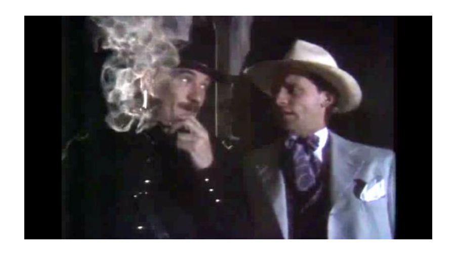
Fig. 1.1 Iago (left) and Roderigo (right) 'For when my outward action doth demonstrate / The native act and figure of my heart / In compliment extern, 'tis not long after / But I will wear my heart upon my sleeve / For daws to peck at: I am not what I am.' 17

the upper class Venetian court, in spite of Iago's machinations. Unlike Branagh's Iago who holds a deep (possibly erotic) love for the Moor, McKellen's outsider is entirely motivated by his contempt and envy of Othello's social integration.<sup>18</sup>