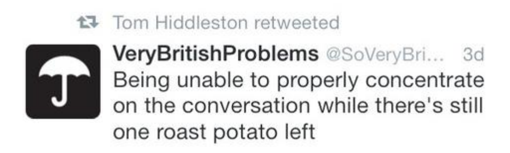
Fig. 3.12 Twitter screen capture from Hiddleston's account. 78

sense of foolishness and mischievousness. 'Prance' similarly alludes to an antiquated idiom that is offset by the light-heartedness of its definition. Finally, as with the Jaguar advert parody, Hiddleston's endorsement of the Twitter account VeryBritishProblems (@SoVeryBritish) exemplifies his self-conscious performance as an Englishman.