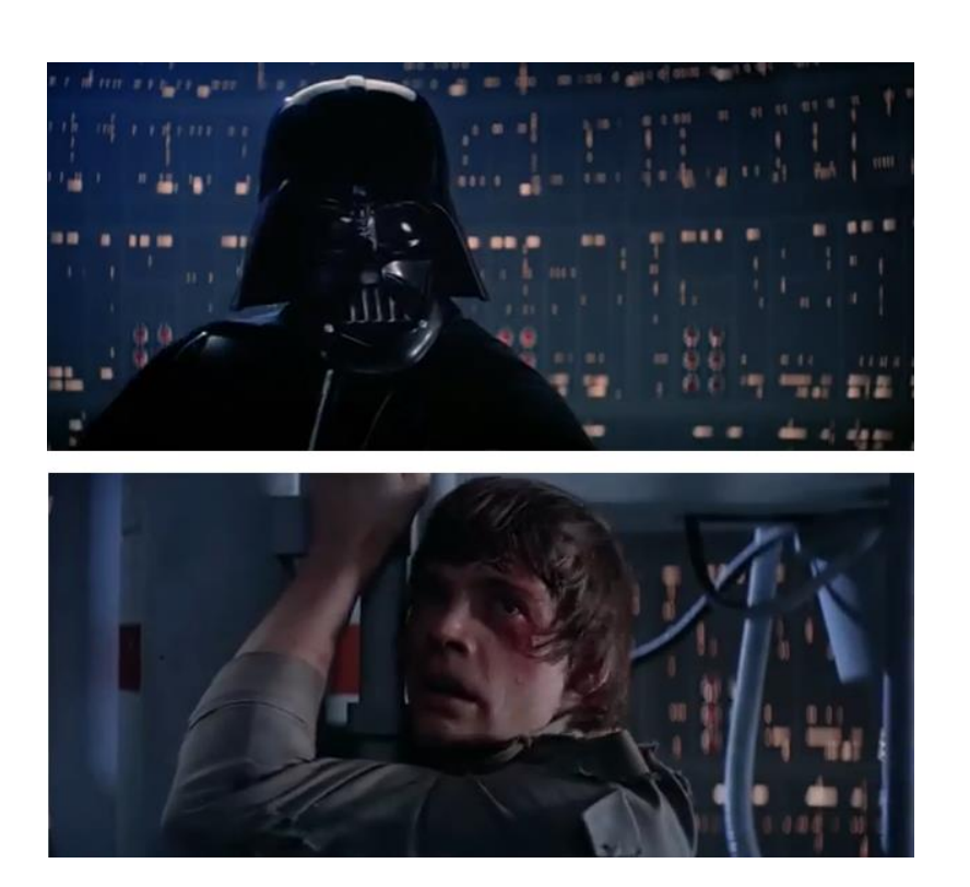
VADER: Join me and together we can rule the galaxy as father and son.