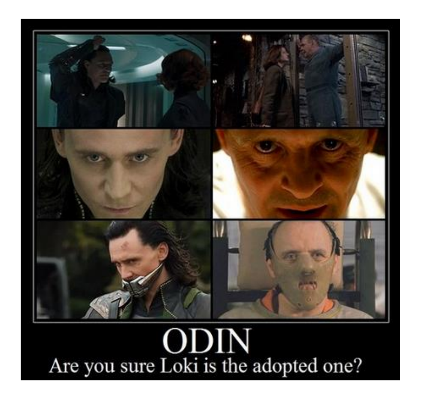
Fig 3.9.The visual and narrative similarities between Loki and Anthony Hopkins' (Odin) most famous incarnation, Hannibal Lecter. <sup>69</sup>

screen roles. They are valuable adaptive sites in themselves, moreover, which contribute to his evolving star persona and the creation of new facets of his identity. Memes extend the dramatic lives of their fictional and non-fictional representations, positioning character as the result of conscious and artificial performance in a way that the film text mostly seeks to elide.<sup>68</sup>