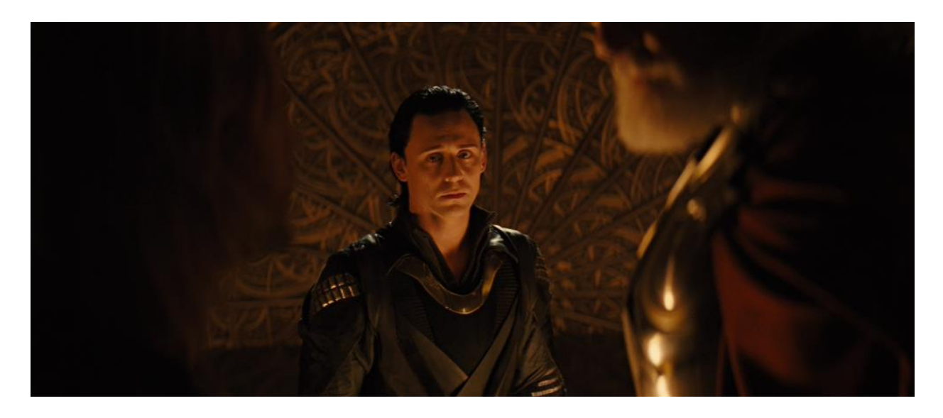
Fig. 3.3 During Thor's banishment the camera cuts from the tight, reverse angle close-ups of Odin and Thor to Loki: one of the 'loved ones' Thor has supposedly betrayed.

figure 3.2 and 3.3 (below), revealing the truth of his machinations: his purposeful manipulation of Thor's pride in order to undermine Odin's trust in his son.