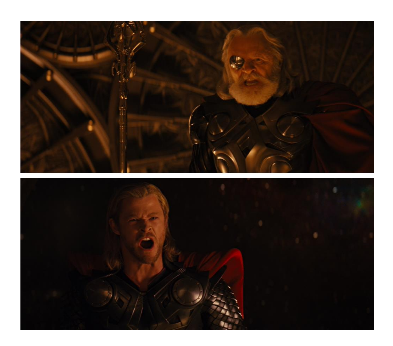
ODIN: You are a vain, greedy and cruel boy! THOR: And you are an old man and a fool!

ODIN: Yes, I was a fool to think you were ready...You have betrayed the express command of your king. Through your arrogance and stupidity, you've opened these peaceful realms and innocent lives to the horror and desolation of war! You are unworthy of these realms, you're unworthy of your title, you're unworthy... of the loved ones you have betrayed!