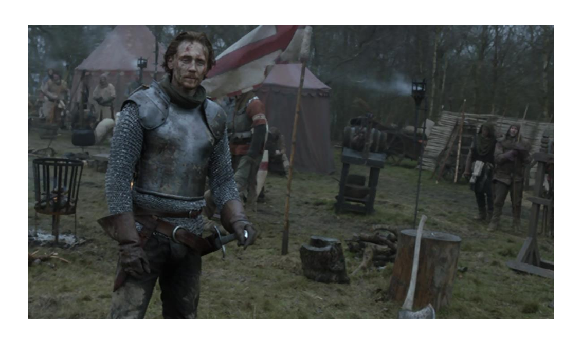
Fig.3. 8 Henry instructs his soldiers to sing 'Non Nobis' and 'Te Deum' (4.8.117).