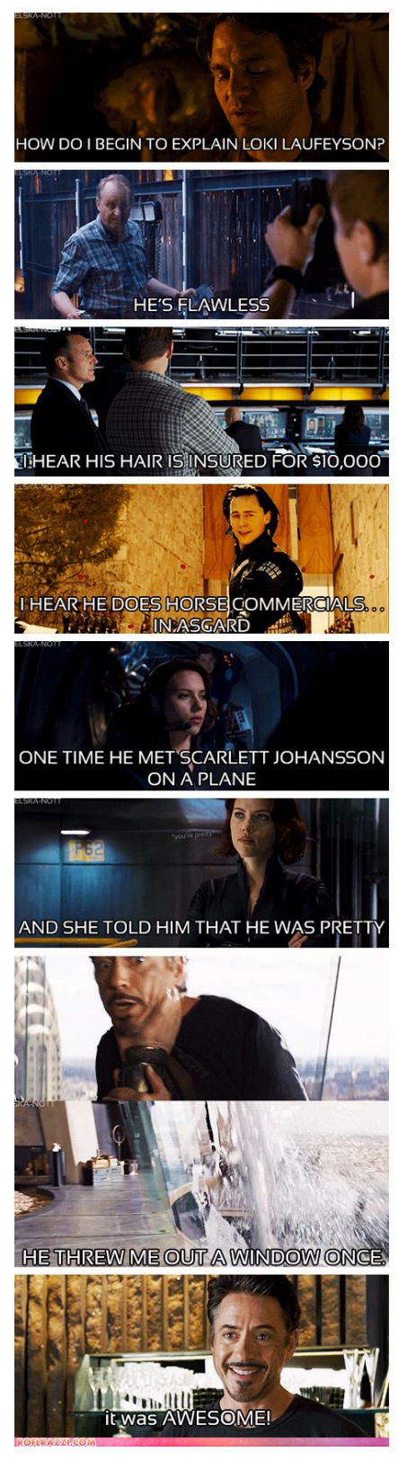
Fig. 3.10 Avengers Assemble/Mean Girls mash up. ^{71}