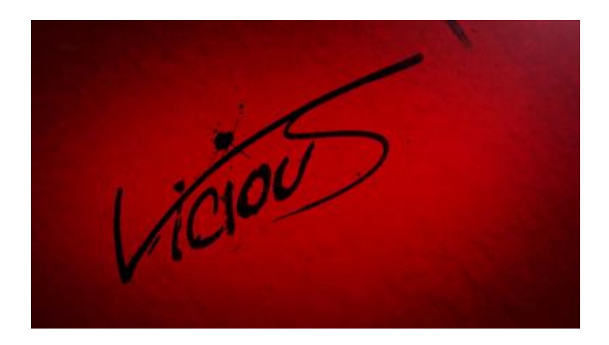
Fig. 1.8 The title page for Vicious

The handwritten credits, with the splotches mimicking the frequent misfires of a fountain pen, gesture towards a form of artistic production frequently utilised in period dramas, in which authorship is aligned with the physical act of writing. Curiously, Vicious thus situates itself within a culture of producing and consuming 'quality' or 'classical' texts. This is somewhat at odds with the broadness of its situational comedy but aspired to both in the programme's casting and Freddie's desperate desire to — ironically — match the cultural cachet possessed by McKellen, Jacobi or de la Tour.