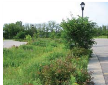
bottom: The Rain Garden at the Minnesota Landscape Arboretum handles water runoff from several large parking lots.