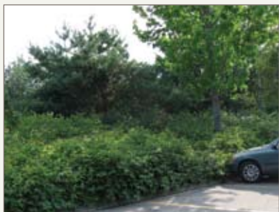
Bush honeysuckle forms a dense cover on the edge of this parking lot. It's a good choice for a tough, low growing shrub in the shade.

Shade limits plant growth. The heights listed here are for less than ideal conditions. Many plants will grow larger when grown in full sun with adequate moisture.