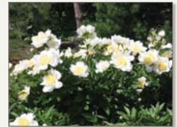
Peonies are long lived, cold tolerant perennials that deer rarely eat.