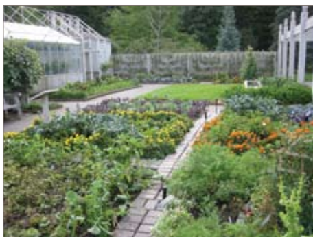
top: Home vegetable gardens need full sun and well-drained soil. Specific vegetable plants and herbs for alkaline soils and near black walnut trees are listed in this publication.