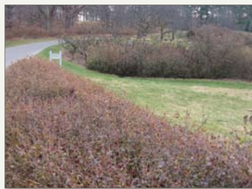
Fragrant sumac 'Gro-low', a shorter, 2' cultivar, edges the roadway along a slope at the Minnesota Landscape Arboretum.