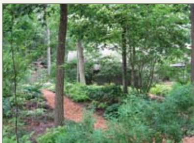
Plan a path to enjoy wild geranium, hosta, wild ginger, and sweet woodruff.

Compiled by Theresa Rooney, Hennepin County Master Gardener. Theresa gardens under a 100-year-old elm tree and very sandy soil (with 2 large dogs).