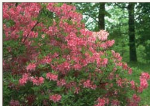
Northern Lights azaleas, U of M introductions for Zone 4, have a spicy fragrance that is delightful.

Compiled by Terry Yockey, Goodhue County Master Gardener. Goodhue County Master Gardeners have created a pocket park out of a parking lot in downtown Red Wing, MN. This high-visibility public park allows the public to enjoy fragrant and beautiful flowers.