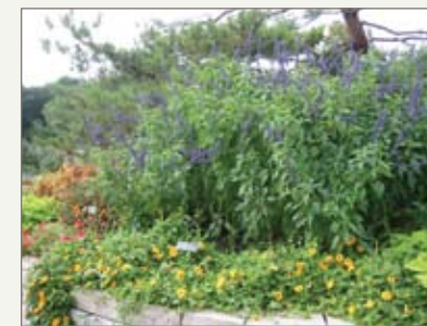
'Indigo Spires' is a tall salvia that blooms all summer.