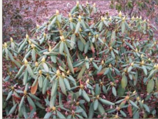
Rhododendron leaves react to cold climates by drooping and curling inward to minimize water loss.

Broadleaf evergreens are a welcome but rare sight in USDA Zone 4. Green foliage in the dead of winter, even curled and transformed by cold, still provides interest in the garden. These plants are the best bets for surviving the zone's climate, but all prefer protection from drying winds and bright winter sun; therefore protected areas on the north and eastern side of a building are good locations.