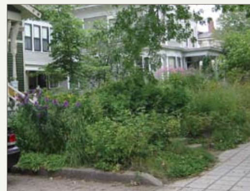
A boulevard garden can be in the front yard, as shown here on this St. Paul street.

Compiled by Rose Bush, Ramsey County Master Gardener. Rose became a Master Grdener in 2001 and has a 4-year-old boulevard garden that includes most of these plants. A handful of these tried and true, easy, versatile perennials were used in a Habitat for Humanity landscaping project led by Master Gardeners.