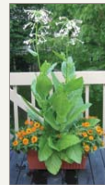
Flowering tobacco, a showy annual with a sweet fragrance, dwarfs 'Profusion Orange' zinnia. Both prefer full sun.