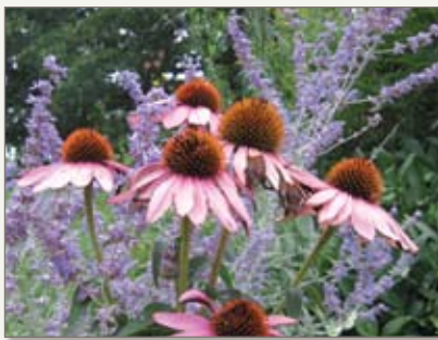
Purple coneflower and perovskia (background) are tough perennials for clay soil.