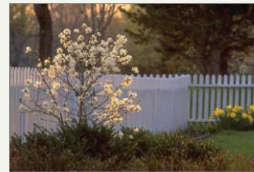
Star Magnolia welcomes spring with its fragrant flowers.