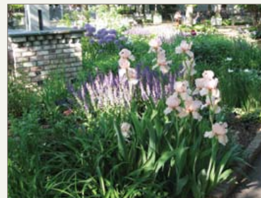
Iris and salvia are tough perennials for a boulevard garden.