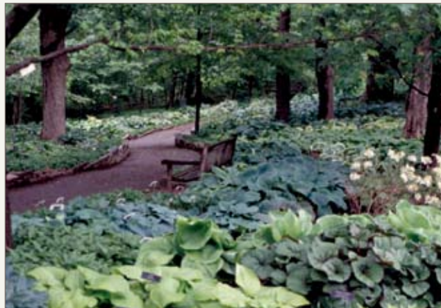
Hosta grow well under many trees, maples as shown here at the Minnesota Landscape Arboretum, as well as black walnut trees.