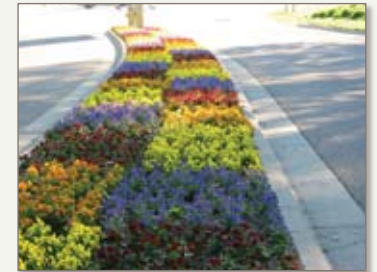
Showy pansies flower in early spring and, when mulched, can even be planted the previous fall.

“Cold tolerance” here is defined as seeds that can be planted in the garden and will grow in cold soil and survive early spring frost, and/or young bedding plants that can survive frost in the spring and early autumn. Minnesota growing conditions call for cool temperatures at almost any time of the year. These annuals will tolerate cool temperatures and even grow well after a light frost. Most are hardy to the mid-20s F.