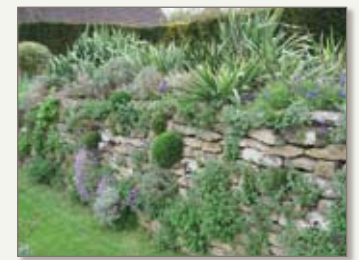
Campanula, lavender, sedum, scilla, and yucca easily grow in this sunny wall.