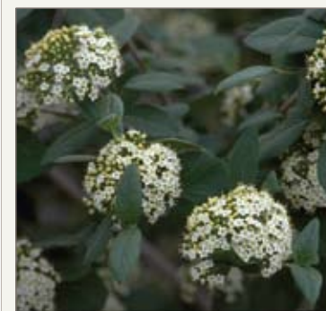
'Emerald Triumph' viburnum is a U of M introduction that grows quickly to 6-10'.

In general, ornamental grasses are tolerant of alkaline pH; there are many to choose from including native grasses. Herbs such as wormwood, Artemisia absinthium ; borage, Borago officinalis ; chamomile, Chamaemelum nobile ; parsley, Petroselinum crispum ; and thyme, Thymus spp., grow well in alkaline conditions. Legumes such as beans and peas, peppers, and spinach are good vegetables to grow in high pH soils.