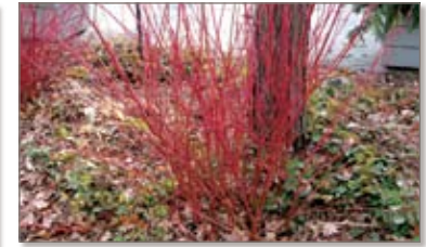
l to r: This lakeshore features oxeye, fireweed, and Joe-Pye weed. Eupatorium (Joe-Pye weed) is a tall, tough native for wet sites. The edge of a pond planted with blue vervain and Joe-Pye weed. Red osier dogwood 'Cardinal' and 'Isanti' are U of M introductions that tolerate wet sites.

Plants on this list will re-establish native plant buffers where the native shoreland vegetation has been altered. Suitable for any zone in Minnesota, these were selected based on their ability to establish readily from seed, spread from rhizomes, tolerate seasonal flooding, fruit in fall, self-sow, stabilize bank and soil, attract bees/butterflies/ hummingbirds/moths, as well as provide beautiful foliage and color throughout the seasons. Most importantly, this natural buffer will help to maintain the quality of the lake.