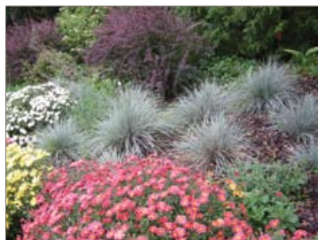
middle: Crimson Pigmy barberry, background, tolerates alkaline soil, is deer resistant and can be pruned for knot gardens. Blue oatgrass (middle) and hardy chrysanthemums (foreground) are additional choices for boulevard gardens and sunny dry sites.