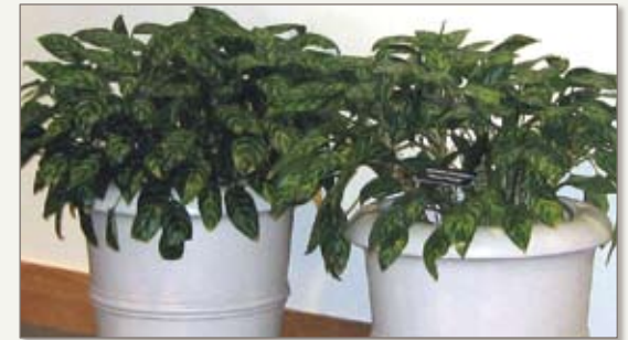
Chinese evergreens can grow indoors with no direct light, as shown on this inside wall at the Minnesota Landscape Arboretum.