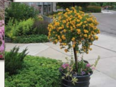
Lantana tolerates hot dry sites such as this container planting at the Minnesota Landscape Arboretum.