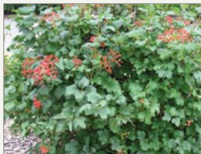
Viburnum opulus 'Compactum' is also a good choice for shady conditions. Spring flowers, summer fruit, and fall color provide interest throughout the year.