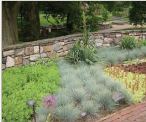
Dry garden plants are perfect for a septic mound; dwarf blue fescue is shown here with sedum on either side and yucca in the background.

Septic mounds are difficult sites requiring minimal disturbance to keep the drainfield intact. Frequent working of the soil is not a good idea. Plants listed above have low maintenance and reduced water requirements. Their fibrous root system helps to hold the soil and prevent erosion off the mound. All are winter hardy in Zones 3 and 4.