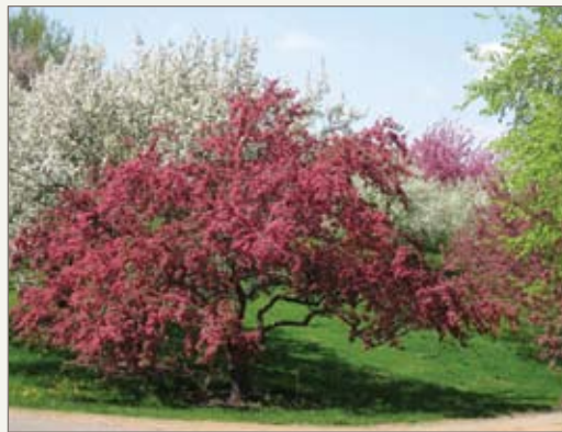
Crabapples are tough and easy to grow on a boulevard.