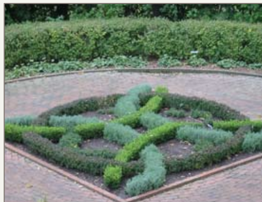
Lavender is the grey foliage in this Minnesota Landscape Arboretum knot garden, which requires winter protection in Zone 4. Purple barberry and green boxwood are also pictured.