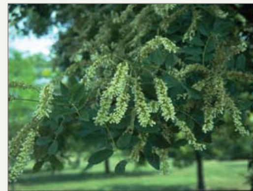
Amur maackia has attractive foliage and makes a good choice for boulevards.