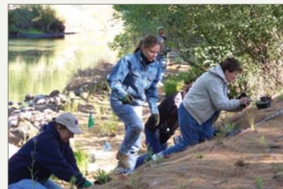
Kanabec Master Gardeners restoration project along the Snake River.