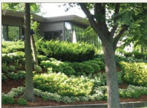
Daylilies and hosta provide color and cover on this steep residential slope.