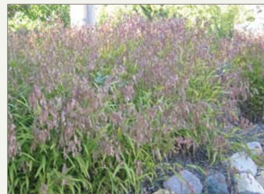
Northern sea oats or river oats are native to moist shady sites in the U.S. and will usually self-sow.