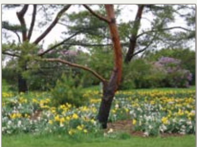
Daffodils are a good choice under trees; they like dry summer conditions.