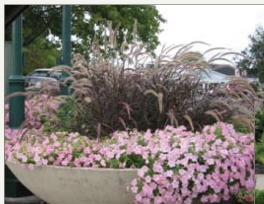
Purple fountaingrass loves heat and full sun. It has no cold tolerance and dies with the first frost.