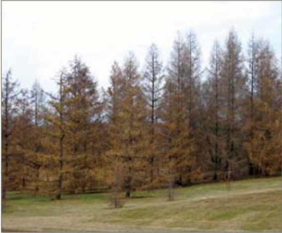
Larch are native to Minnesota and are one of the few deciduous conifer trees. Shown here in November with lingering fall color, larch are well suited for wet or compacted soils.