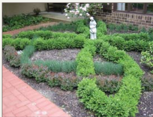
Boxwood, 'Crimson Pigmy' barberry, and ornamental onion have contrasting foliage that makes a colorful knot garden.