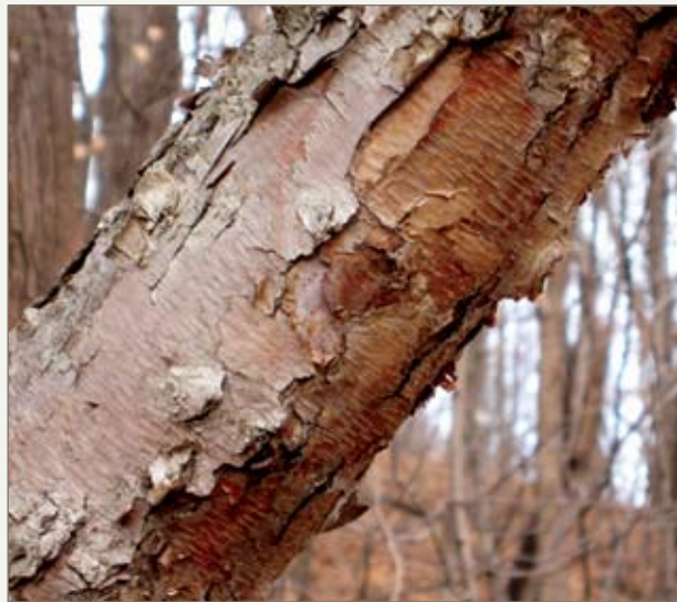
r: River birch has attractive bark year-round; it is much more tolerant of dry soils than white paper birch.