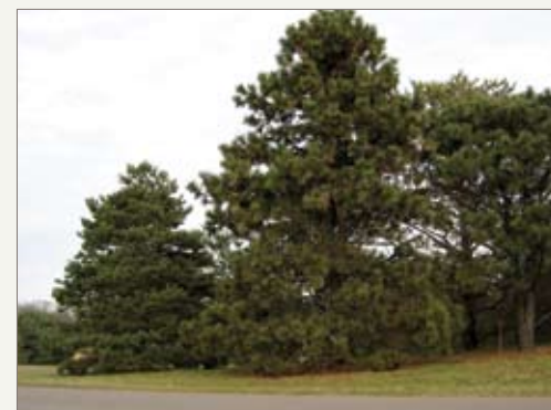
Pine trees have minimal litter and make a good permanent addition to the landscape.