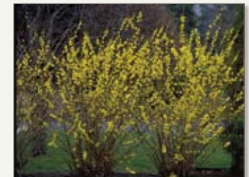
'Northern Sun' is a UM cold hardy introduction of forsythia, a shrub rarely eaten by deer.