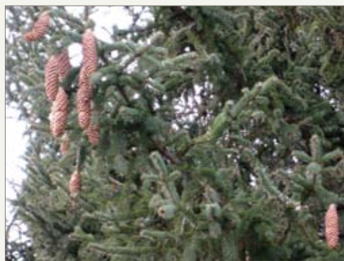
Spruce have cones that can become litter, but usually these are a minor nuisance.

What is a messy tree? Trees that drop large or thick leaves, twigs, flowers, fruit, seeds and nuts might be considered ‘messy.’ However, each of these ‘messes’ performs a function contributing to survival or reproduction. Many people value these features and enjoy them as part of the beauty of the tree. Wildlife often live from these features! Many plants today are bred to be sterile, with no fruit or pollen and thus have minimal tree ‘litter.’ Female trees can produce large fleshy fruits that some people consider ‘messy.’ As a homeowner you may be concerned with tree litter clogging gutters, falling on cars, drive-ways, walkways, patios or decks. The list below is not all inclusive, but meant to be a starting point on identifying trees with minimal litter potential.