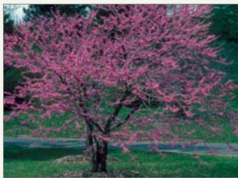
Redbud is an early spring flowering native tree that tolerates shade.