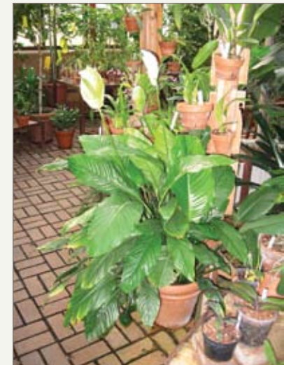
Peace lily tolerates low light but likes moist soil, it wilts quickly when water is needed.