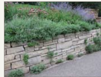
Catnip (foreground atop wall) is a vigorous perennial that has self-seeded into crevices.