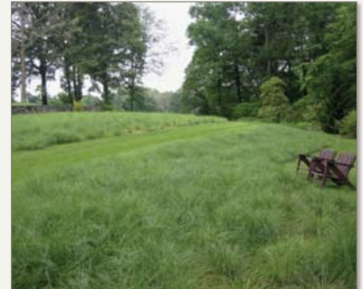
Prairie dropseed, left unmowed, forms attractive mounds between a mowed walkway.