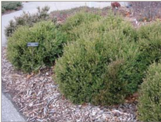
Selected cultivars of boxwood make good evergreens for Zone 4 in protected areas.