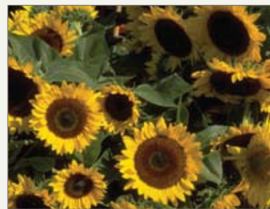
New cultivars of sunflowers have a variety of colors and forms, often with branched, multiple flowers.