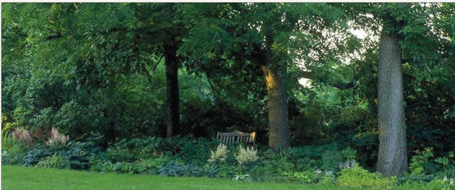
The trees are each side of the bench are black walnuts. There are many juglone tolerant plants; however, many plants will not tolerate this tough site.