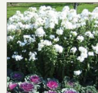
Garden phlox is a dependable perennial with a lovely scent.