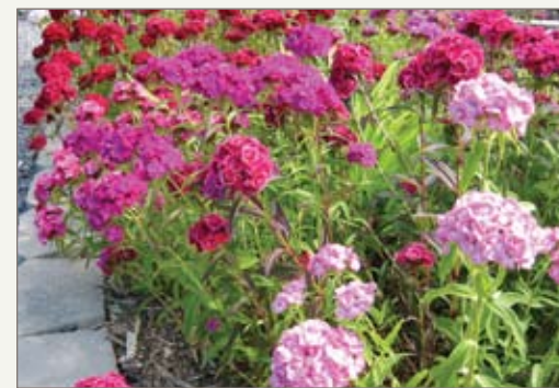
Sweet William is a fragrant old-fashioned biennial that produces abundant seed, left undisturbed it can grow like a perennial.

Self-seeding can be a desirable way to increase garden perennials, or it can be a nuisance and a means of spreading invasive plants. Many seedlings revert to less desirable forms. Pay attention to avoid exotic plants self-seeding into native areas.