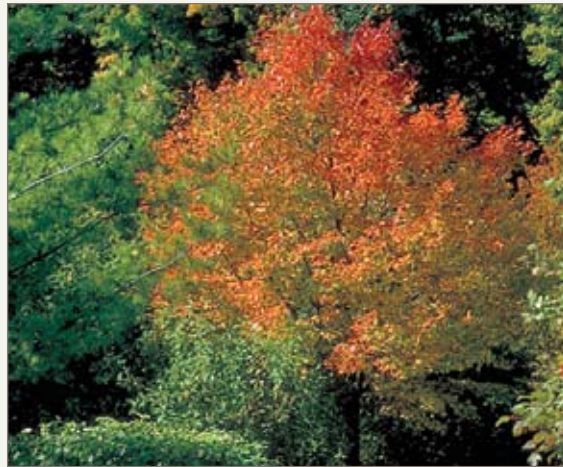
'Northwood' red maple has bright orange fall color and grows to 50 feet. It is a U of M introduction developed by the Minnesota Agricultural Experiment Station, released in 1980.

Compacted sites are common in urban and suburban areas where construction equipment is used to build homes and alter the landscape. Trees on this list will tolerate compacted soils, but remember no trees respond well to a major grade change or construction damage.