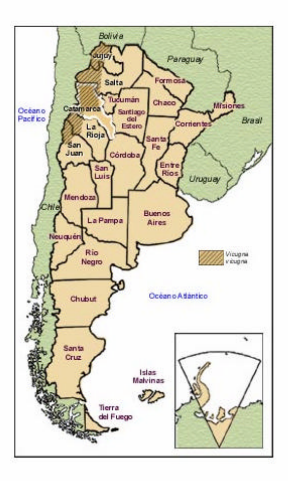
AREA OF VICUÑA DISTRIBUTION IN THE REPUBLIC OF ARGENTINA

provinces of Tucumán and Santiago del Estero to the east; Córdoba and La Rioja to the south and the Republic of Chile to the west over the Andes. In the province of Catamarca, the vicuña inhabits wide sectors of puna and high Andean environments of the departments of Antof agasta de la Sierra, Tinogasta, Belén and Santa María, a range representing some 4,500,000 ha. (45.000 km²) to the north and west of the province.