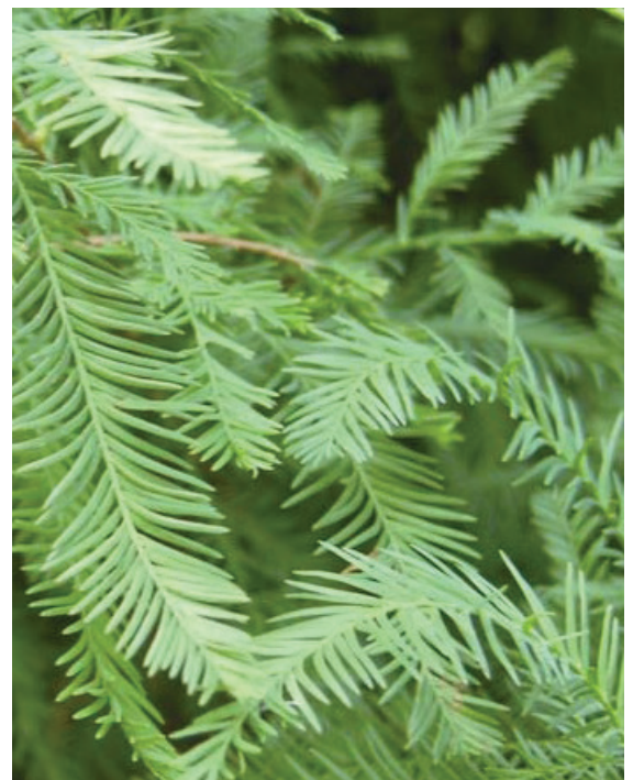
Autumn Gold Bald Cypress leaves