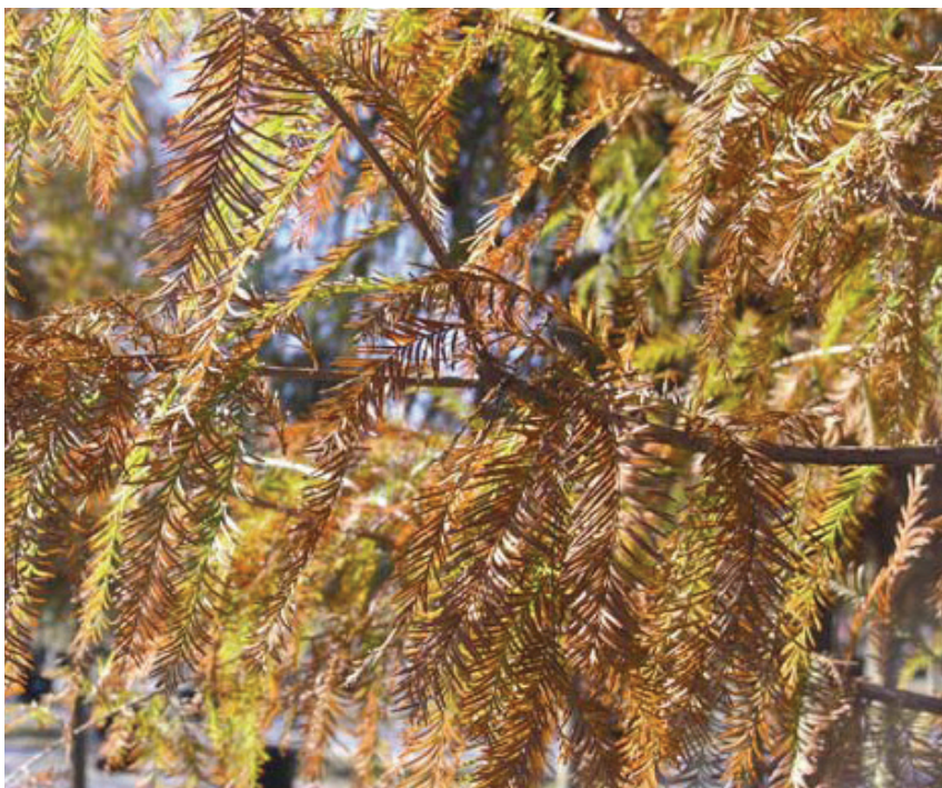
Autumn Gold Bald Cypress winter color

Autumn Gold is a patented cultivar of Bald Cypress. The merits of this selection are improved dense, fine-textured summer foliage that is enhanced with an autumn gold color in the fall, as well as improved uniform branching and a dominant central leader. This cultivar enhances the natural beauty of the Bald Cypress and is abundantly qualified for increased use in America's landscape.