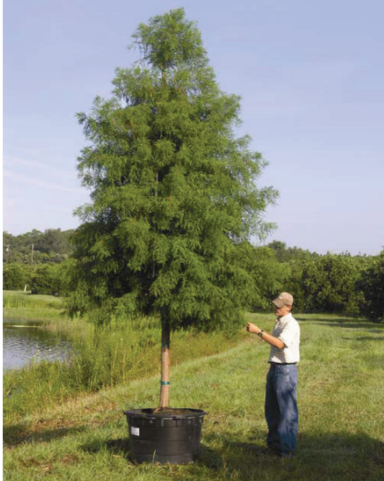
Autumn Gold Bald Cypress field grown

taxodium distichum sofine 'Autumn Gold' TM