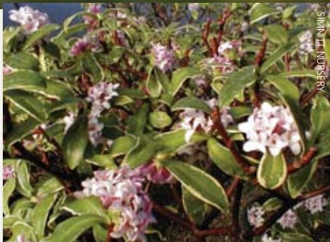
Daphne odora 'Marginata', commonly known as winter daphne or fragrant daphne, is the most widely-grown type of daphne.