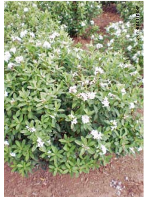
Daphne transatlantica cultivars, formerly known as Daphne caucasica, are known for their rugged adaptability to a variety of conditions.

large, some evergreen and others deciduous, they fill many design needs in the garden.