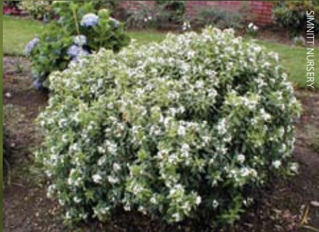
Daphne 'Jim's Pride' is a highly-recommended cross between D. transatlantica and D. collina . It grows well in a variety of environments and has large, great-smelling white flowers all summer long.