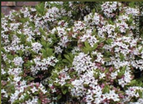
Daphne x burkwoodii 'Carol Mackie' has pretty, variegated leaves, blooms in early summer and adapts well to a variety of conditions, including cold and drought.