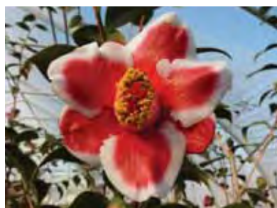
Fall blooming Camellia japonica 'Tama Electra'.

Camellia yubsienensis 4-8' ● ☀ 1 g, 2' $25 In late winter, this species makes a spectacular floral display due to a very heavy bud set, sometimes with over a dozen long pointy buds at the tip of a branch, and the white flowers have pretty undulate wavy petals. Some clones have a nice fragrance. Small leaves have a reticulate venation. Native to the Chinese provinces of Hunan, Jiangxi and Guangdong. (Zone 7B?)