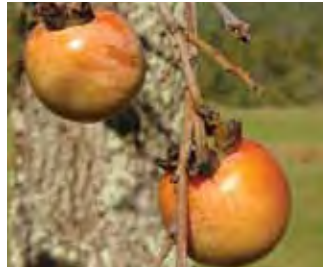
Diospyros virginiana