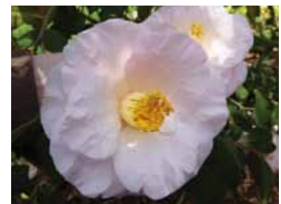
Spring blooming Camellia japonica 'April Blush'.