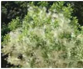
Chionanthus virginicus Fringetree