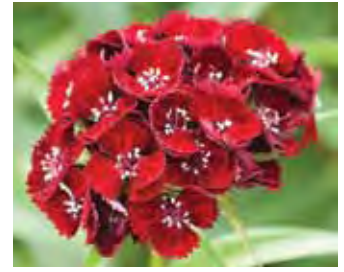
Dianthus barbatus 'Heart Attack'