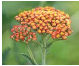
Achillea 'Feuerland'

🌿 Viola walteri 'Silver Gem' Prostrate Blue Violet 3-5" ● ● 🌿 1 qt $7 Selected by Mt. Cuba Center for its striking silvery-colored, heart-shaped leaves with contrasting green veins. Adding to its appeal, the undersurface of the leaves vary from pale purple-green to burgundy. Drought tolerant once established. Fritillary caterpillar food source. N 🦋