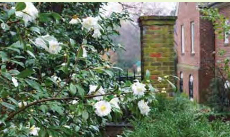
Camellias blossom in a local garden.