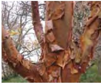
Acer griseum Paperbark Maple.