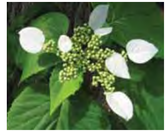
Schizopbragma hydrangeoides (Littleleaf Form)