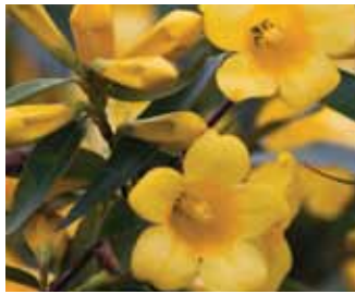
Gelsemium sempervirens 'Margarita'