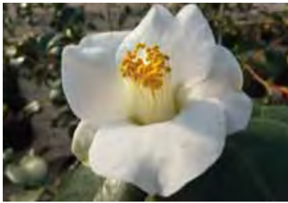
Spring blooming Camellia japonica 'Korean Snow'.