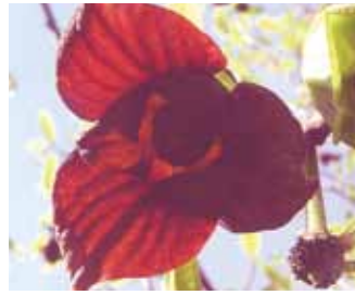
Asimina triloba