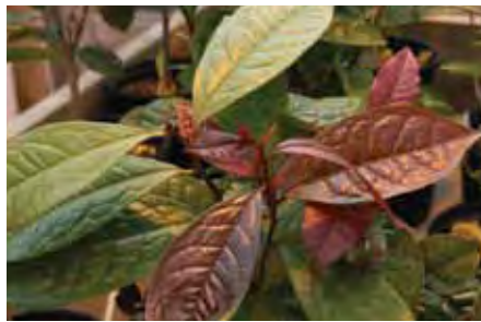
Tender Camellia cbrysanthoides foliage