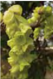
Corylopsis glabrescens

Latin Name Common Name Mature Size Light Soil Pot Size, Plant Size Price