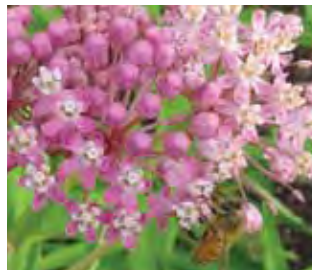
Asclepias incarnata Swamp Milkweed