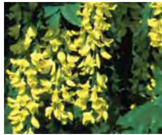
Laburnum × watereri Golden Chaintree