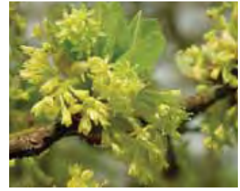
Sassafras albidum

Latin Name Common Name Mature Size Light Soil Pot Size, Plant Size Price