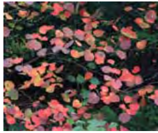
Disanthus cercidifolius Redbud Hazel