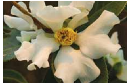
Tender Camellia yubsienensis .

Latin Name Common Name Mature Size Light Soil Pot Size, Plant Size Price