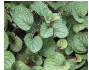
Viola walteri 'Silver Gem'