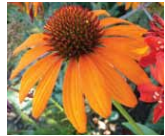
Echinacea purpurea 'Tiki Torch'