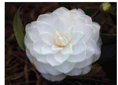
Spring blooming Camellia japonica 'Sea Foam'.

Camellia 'Winter's Star White' 6-10' ● ☀ 3 g, 3' $35 All of the beauty of C. 'Winter's Star' but with large single white flowers. (Zone 6A)