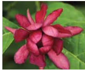
Calycanthus 'Hartlage Wine'