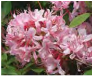
Rhododendron periclymenoides