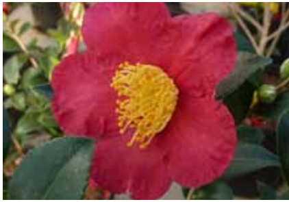
Camellia sasanqua 'Yuletide'.