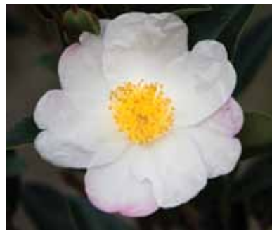
Camellia oleifera hybrid 'Survivor', tea-oil camellia

While isolated camellia specimens have been known to survive outdoors for years in the mid-Atlantic states, active breeding programs to develop reliably winter hardy cultivars began only 30 years ago after a series of devastatingly severe winters demonstrated the hardiness of a little known species, the tea-oil camellia, C. oleifera .