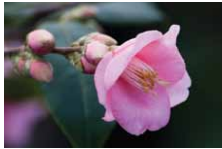
Fall blooming Camellia sinensis 'Rosea'.