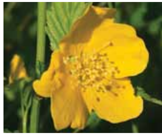
Kerria japonica 'Golden Guinea'