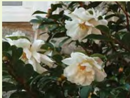
Camellia 'Winter's Snowman'