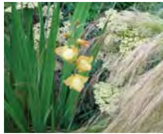
Nasella tenuissima with Gladiolus 'Boone' Silky Thread Grass