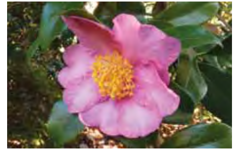
Fall blooming Camellia 'Winter Star'.

Latin Name Common Name Mature Size Light Soil Pot Size, Plant Size Price