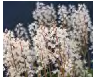
Tiarella cordifolia 'Running Tapestry'