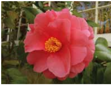
Spring blooming Camellia japonica 'Kumasaka'.

Hybridizers combined the hardiness of this white fall-blooming species from China with the floral attributes of traditional