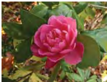
Camellia 'Autumn Spirit'.

As always, we offer an in-depth look at a particular group of plants, this year the genus Camellia . The selection goes beyond offering various cultivars with differing flower color, to a more extensive exploration of the genus with particular emphasis on hardy selections and new hybrids targeted at colder garden