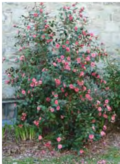
Camellia japonica 'April Kiss' blooms peak in April.

1. The spring blooming varieties begin as early as March and continue until late April or early May. Individual varieties have an earlier or later period of bloom, but the peak season is April. This is the classic camellia with many cultivars derived from Camellia japonica and its hybrids. Flowers may exceed 4 inches in diameter in colors ranging from pure white through shades of pink to dark red. Flower forms vary from single through semi-