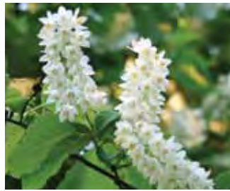
Styrax obassia