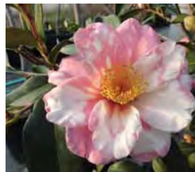
Fall blooming Camellia × vernalis 'Shibori Egao'.

bloom period occurring from mid October until Thanksgiving.