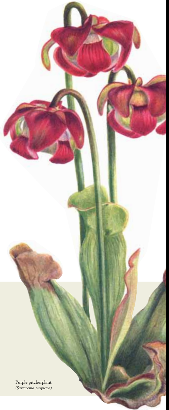
Purple pitcherplant ( Sarracenia purpurea )

Visit www.mtcubacenter.org to reserve a tour or sign up for a class.