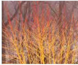
Cornus sanguinea 'Winter Flame'