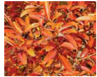
Lindera glauca var. salicifolia

Latin Name Common Name Mature Size Light Soil Pot Size, Plant Size Price