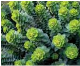
Euphorbia myrsinites Donkeytail Spurge