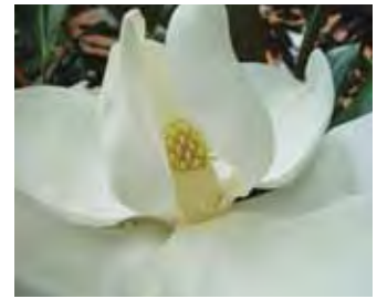
Magnolia grandiflora 'Kay Parris'

Latin Name Common Name Mature Size Light Soil Pot Size, Plant Size Price