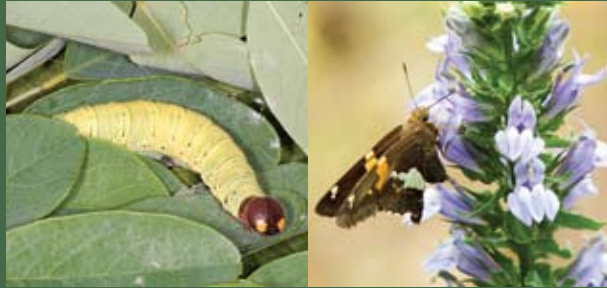
Silver-spotted Skipper larva and adult.

Did you know you can attract fluttering Lepidoptera—butterflies, moths, skippers—to your garden by growing the food plants they love in the caterpillar stage? Providing plants to attract caterpillars ensures you will have plenty of adult butterflies to enhance the beauty of your garden. In turn, young and adult Lepidoptera will provide a food source for birds and other wildlife that prey on them.