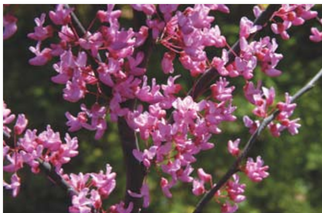
Cercis canadensis .