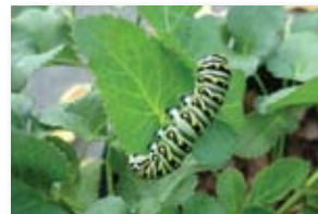
Black Swallowtail adult and larva. See this page Zizia aurea and page 17 for more information.