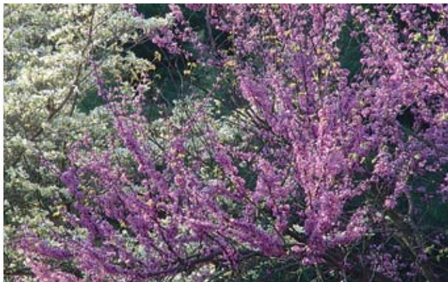
Cercis canadensis .

Latin Name Common Name Mature Size Light Soil Pot Size, Plant Size Price