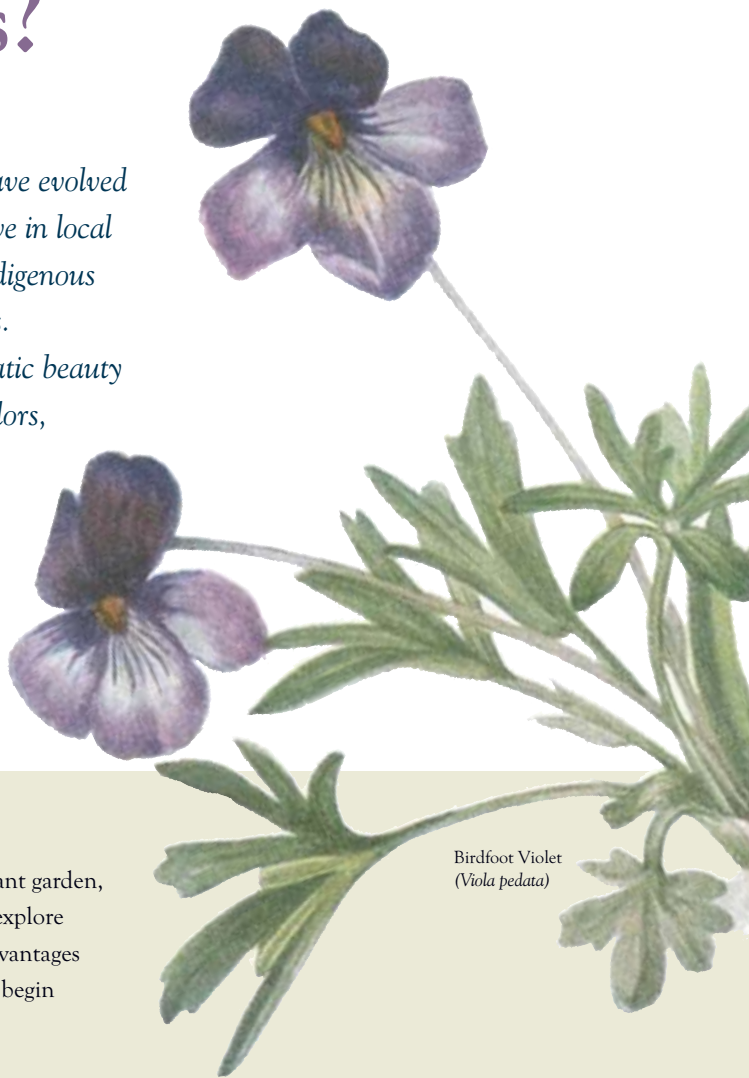
Birdfoot Violet ( Viola pedata )

Native plants offer diversity and dramatic beauty for gardeners in a myriad of shapes, colors, and sizes across the seasons.