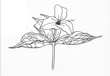
Trillium grandiflorum (Great or Snow Trillium)