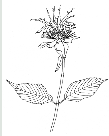
Monarda didyma (Oswego-tea or Bee-balm)