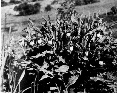
A Remarkable Plant of Cypripedium pubescens