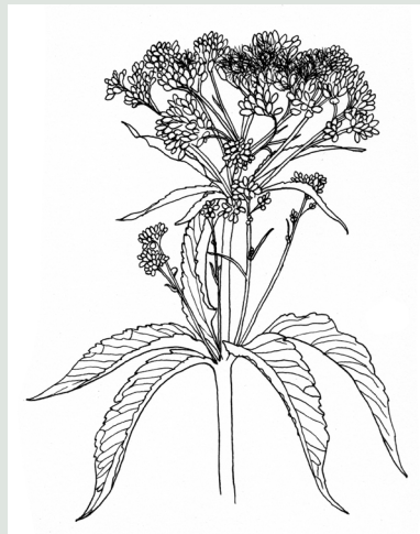
Eupatorium purpureum (Sweet-Joe-Pye-weed)