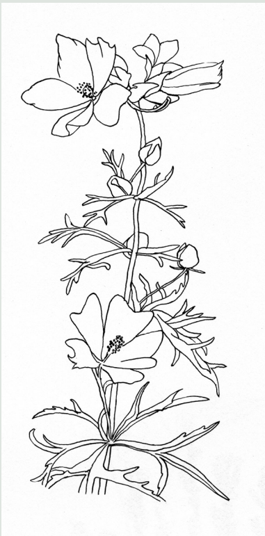
Hibiscus palustris (Swamp-Rose-Mallow)