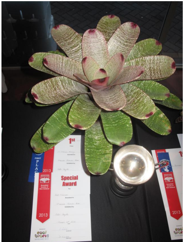
Below: T Tectorum