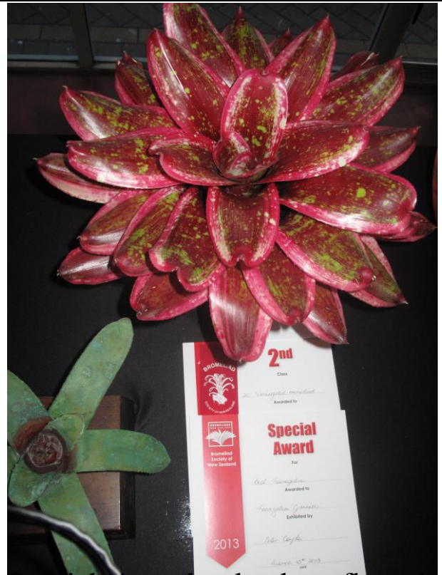
Special Awards clearly reflect the effort by participants.