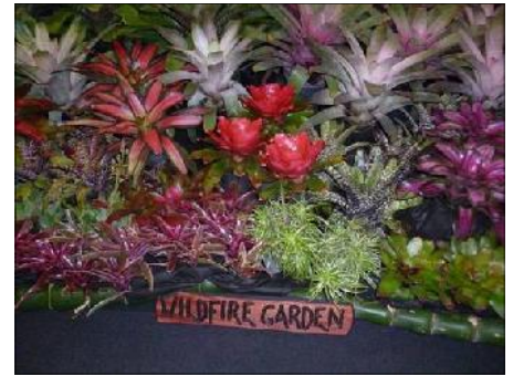
Wild Fire Garden display containing 3 red plants in the centre which are one of Grace Goode's hybrids, Neoregelia 'Reverence'.

He grows many broms from seed and enjoys hybridising too. His hybrids are spectacular! George is also very concerned about the conservation of species. He feels it is vital that we all do our bit and grow species from seed. It was interesting to see the quarantine house that George designed and had built, $30,000 AUD! It is not operational yet due to the ban on importation of broms from the US. They are working hard to convince the