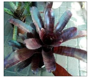
Neoregelia 'Groves Red Tiger'

Neoregelia 'Hannibal Lector' has since been used in many other crosses.