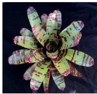
Neoregelia 'High Voltage'