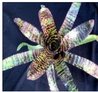
Neoregelia 'Freddy Krueger'