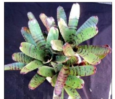
Neoregelia 'Hannibal Lector'