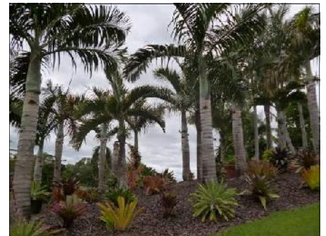
Second garden visit to Stan and Jane Walkley's lovely sprawling garden.