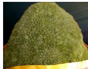
A Reserve Champion of the Show, Deuterocohnia brevifolia .