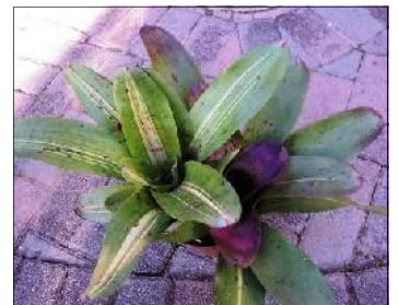
Neoregelia 'Sybil Jane'

BSI Journal copies are in the library and available to take out on loan, plus other interesting resources on USB. The BSI website has a link, BSI Journal Archives, where you can access back copies of the Journals.