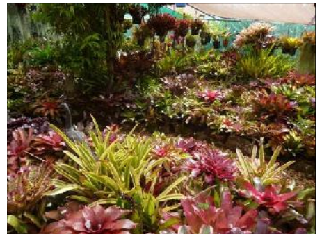
A garden visit to Buderim Bromeliads.