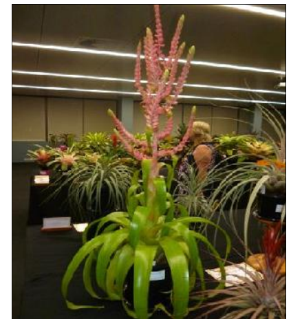
Tillandsia 'Samantha' in the competition.