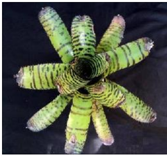
Neoregelia 'Norman Bates'.