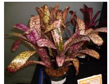
Billbergia 'Kawana Sparkler'