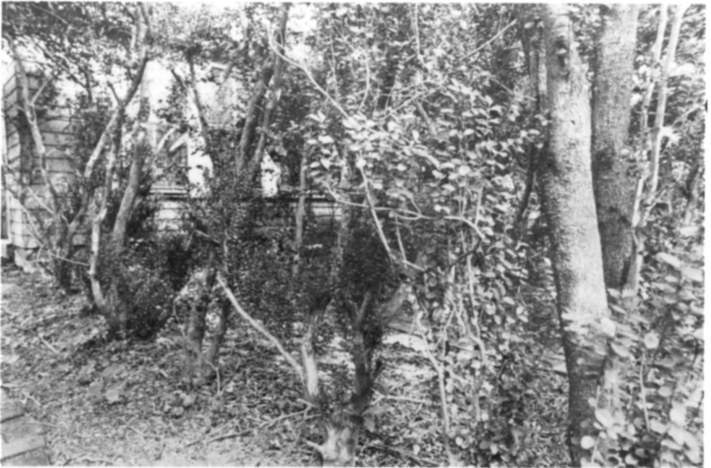
Fig. 1. Before Pruning.