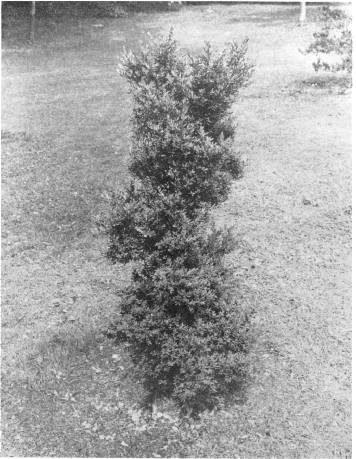
Fig. 1. 'Locket' Photographed May, 1976 at 21 years: 59 inches tall and 22 inches wide.