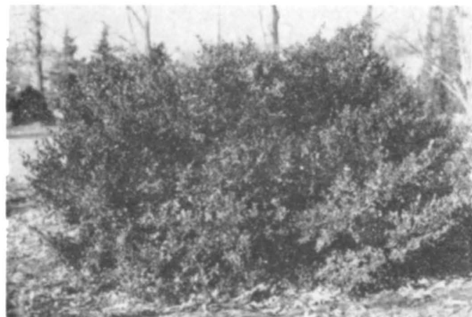
Fig. 1. Japanese boxwood. Typical habit of a mature specimen at the U. S. National Arboretum.

The form 'National' was described on page 62, Vol. 12, No. 4 of the Bulletin without illustration. Fig. 2 of the present note shows the form and height of this plant at about 21 years of age. Its ultimate height is an unknown factor. 'National' has been distributed by the U. S. National Arboretum for testing purposes.