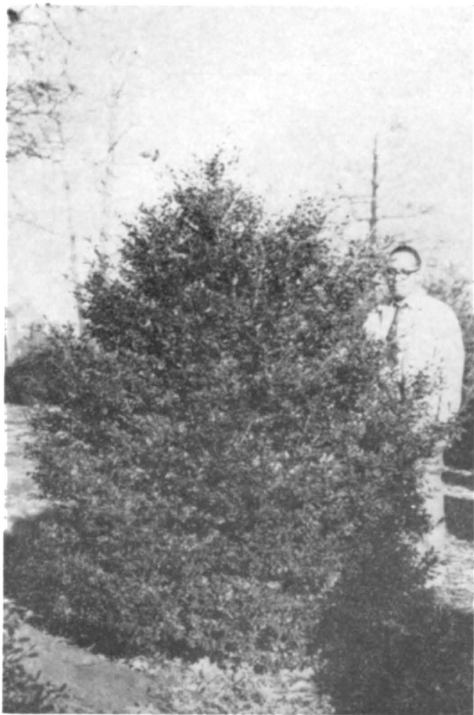
Fig. 2. Cultivar 'National' with Roland M. Jefferson, Taxonomist of the National Arboretum.

show an occasional reversion in growth habit to the normally vigorous B. microphylla var. japonica . U.S.D.A. Hardiness Zone 8."