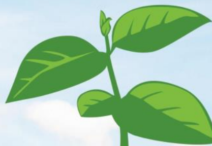
Roots WITHOUT Mycorrhizae