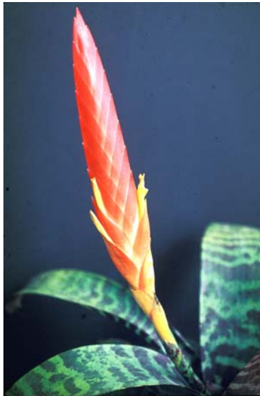
Lutheria splendens (formerly Vriesea splendens )