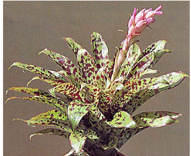
Tillandsia biflora

The bromeliad world owes a debt of gratitude to the authors of this 2016 report and to their colleagues, researchers, lab assistants etc. for this major advance in bromeliad taxonomy. □