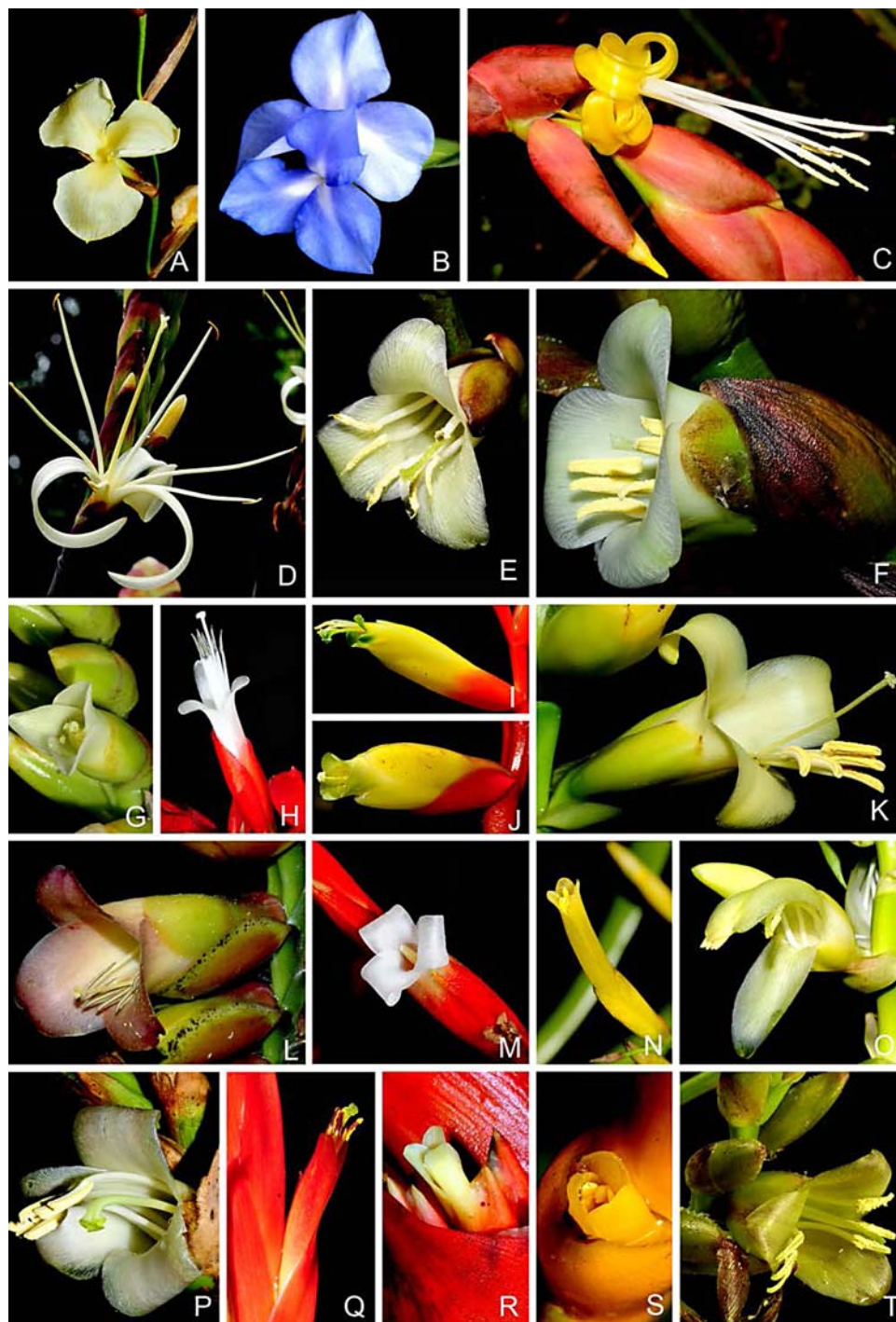
FIGURE 3. Corolla types in Tillandsioideae (continued). A. Lemeltonia dodsonii (Leme 2523; salverform). B. Wallisia lindeniana (Barfuss s.n.; salverform). C. Alcantarea farneyi (Leme 1910; tubular with strongly recurved petal blades). D. Alcantarea robertokautskyi (Leme 3866; tubular with strongly recurved petal blades). E. Stigmatodon plurifolius (Leme 6997; campanulate). F. Stigmatodon apparicianus (Leme 7379; campanulate). G. Stigmatodon amadoi (Leme 5953; campanulate). H. Vriesea flammea (Leme 5471; tubular with spreading petal tips). I. Vriesea psittacina (Leme 7075; tubular). J. Vriesea platynema (Leme 1670; tubular). K. Vriesea saxicola (Leme 5236; campanulate). L. Vriesea pseudoatra (Leme 3917; campanulate). M. Vriesea (' Cipuropsis ') elata (Leme 743; tubular with recurved petal blades). N. Vriesea breviscapa (Leme 8235; tubular). O. Werauhia nephrolepis (Leme 3955; cupshaped base and one petal blade spreading, the other two forming a hood). P. Werauhia gladioliflora (Leme 3967; campanulate). Q. Lutheria glutinosa (Leme 2525; tubular). R. Mezobromelia capituligera (Leme 5111; tubular). S. Goudaea chrysostachys (Leme 2509; tubular with cucullate petal tips). T. Zizkaea tuerckheimii (Gouda s.n.; campanulate).