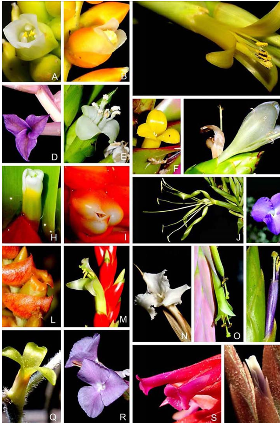
FIGURE 2. Corolla types in Tillandsioideae. A. Catopsis hahnii (Leme 2482; urceolate). B. Catopsis pisiformis (Leme 2410; urceolate); C. Gregbrownia lyman-smithii (Leme 4655; tubular with spreading petal blades); D. Barfussia laxissima (Takizawa s.n.; salverform); E. Guzmania patula (Leme 4062; tubular with recurved petal blades); F. Guzmania kareniae (Leme 3439; tubular with spreading petal blades); G. Guzmania cylindrica (Leme 4586; tubular with enlarged, erect, slightly divergent petal blades); H. Guzmania sanguinea var. comosa (Leme 3253; tubular with cucullate petal tips); I. Guzmania musaica (Leme 3538; tubular with cucullate petal tips). J. Pseudalcantarea viridiflora (Takizawa s.n.; tubular with spreading, helicoiform petal blades). K. Racinaea hamaleana (Leme 7319; salverform); L. Racinaea crispa (Leme 2437; urceolate). M. Tillandsia malzinei (Leme 361; tubular with recurved petal blades). N. Tillandsia xiphioides (Takizawa s.n.; salverform). O. Tillandsia incurva (Leme 7299; tubular with divergent petal tips). P. Tillandsia fasciculata s.l. (Leme 4833; tubular). Q. Tillandsia usneoides (Leme 306; tubular with spreading petal blades). R. Tillandsia graomogulensis (Leme 1489; salverform). S. Tillandsia geminiflora (Leme s.n.; tubular with spreading petal tips). T. Tillandsia tectorum (Takizawa s.n.; tubular).