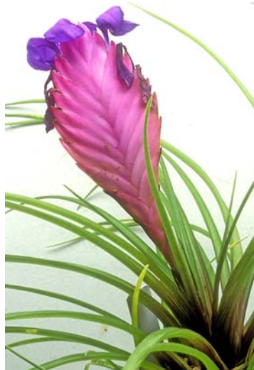
Wallisia cyanea (formerly Tillandsia cyanea )

2. Eleven new genera have been created, raising the total of supported genera in sub-family Tillandsioideae to Eighteen. (The data suggested the possibility that the species Vriesea subandina could be moved to a new, single species genus to be called Cipuropsis , but it was too weak to justify such a move at this time.) The genera are: Racinaea (78 species), Tillandsia (772 species), Barfussia (3 species from