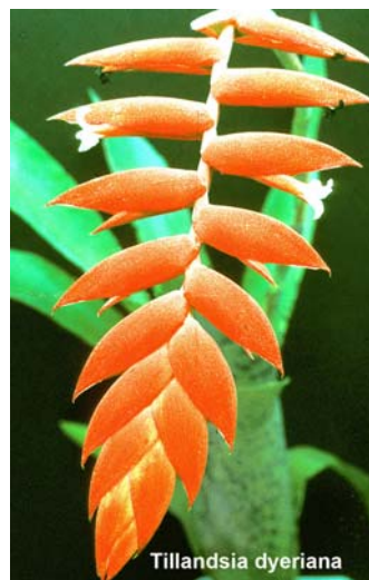
Racinaea dyeriana (formerly Tillandsia dyeriana )

5. Complexes - Some genera are similar in appearance and are closely