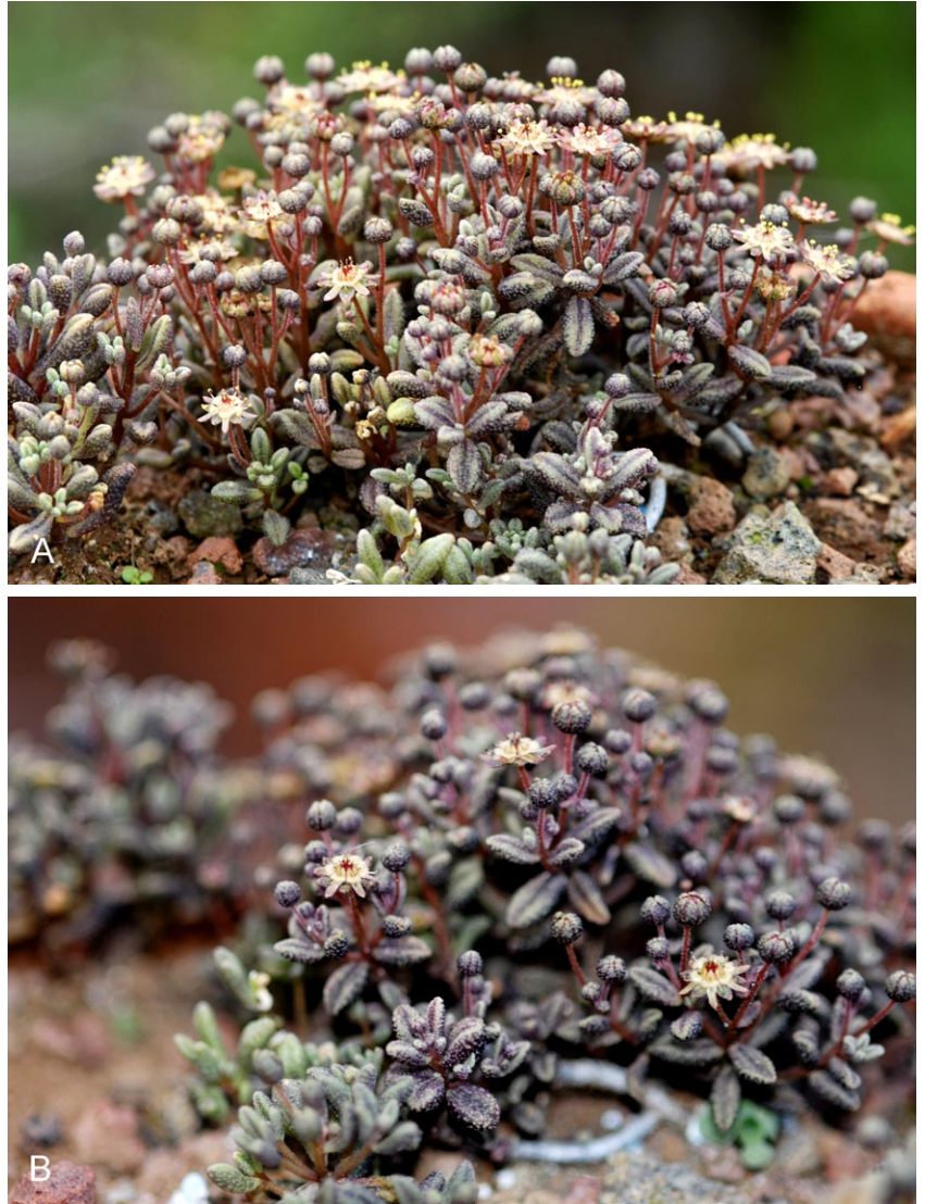
Fig. 3. A–B: an individual of Monanthes subrosulata at the type locality (Spain, La Palma, “Canal de Tegalate”, 425 m) on 1 Apr 2006.

References on the chorology of the species of Monanthes in La Palma (Santos 1983; Nyffeler 1992; Bañares 2008) and a recent survey in the field revealed two sites with co-occurring taxa (showing a close connection among individuals): (1) M. laxiflora – M. polyphylla subsp. amydros in the central part of La Palma at La Es-