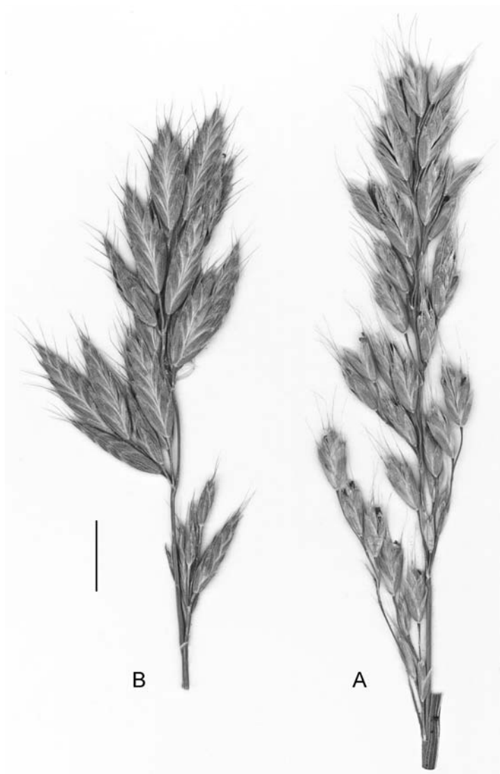
Fig. 1. A: Bromus parvispiculatus (from the holotype, Willing 87413). – B: B. hordeaceus subsp. mediterraneus (France, Var, 1860, F. Schultz, herbarium normale, nov. Ser. Cent. 13, No. 1272 as B. molliformis ). – Scale bar = 1 cm.

of glumes and lemmas on drying, a relative high lemma awn insertion of 0.5-1.7 mm below the obtuse or short-bilobed lemma apex as well as the more or less spreading, softly and densely long-hairy indumentum at least on the lower leaf sheaths (except for B. hordeaceus subsp. longipedicellatus , a probably hybrid derivative; Spalton 2001). The interrelationships of all these taxa are obscure. Some similarities in the loose panicle configuration of B. hordeaceus subsp. pseudothominei (6.5-8 mm long lemmas; the mostly non-weedy subsp. thominei , similar in lemma size, differs, e.g., by its compact inflorescences!) and B. parvispiculatus may one lead to the assumption that the latter is the Mediterranean vicariant of the more northerly distributed subsp. pseudothominei and should therefore better be treated as a subspecies of B. hordeaceus .