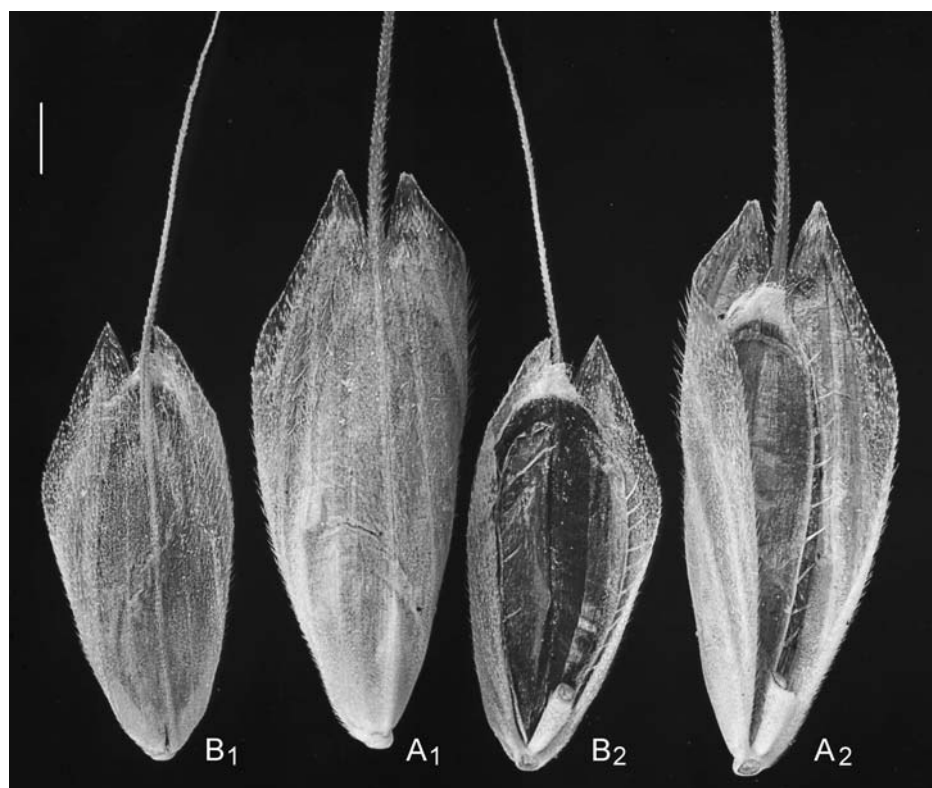
Fig. 2. Florets in fruiting state (1 = dorsal and 2 = ventral view) – A: Bromus incisus (from Otto 10651); B: B. lepidus (from Otto 10461). – Scale bar = 1 mm; photograph by Otto.

The Herbarium of the Botanical Museum Berlin-Dahlem (B) holds a mounted specimen of an annual brome grass obtained in 1946 from R. Gross, who himself received it from the National Her-