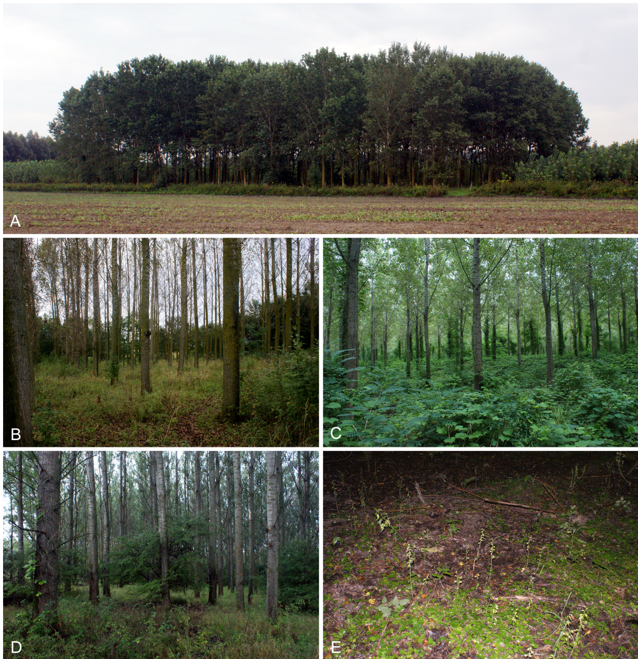
Fig. 3. Habitats of Epipactis tallosii in hybrid poplar monocultures. – A: Croatia: Baranjsko Petrovo Selo, plantation surrounded by agricultural cropfields; B: Croatia: Čadavica; C: Serbia: Kanjiža; D, E: Hungary: Vácegres.

undetected during the surveys. The species was found in poplar plantations of all five visited countries (Fig. 2). In the territory of Croatia, Romania, Serbia and Ukraine the occurrence E. tallosii was formerly unknown.