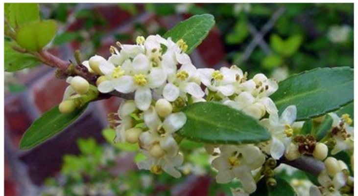
Bud and flower detail Camelia