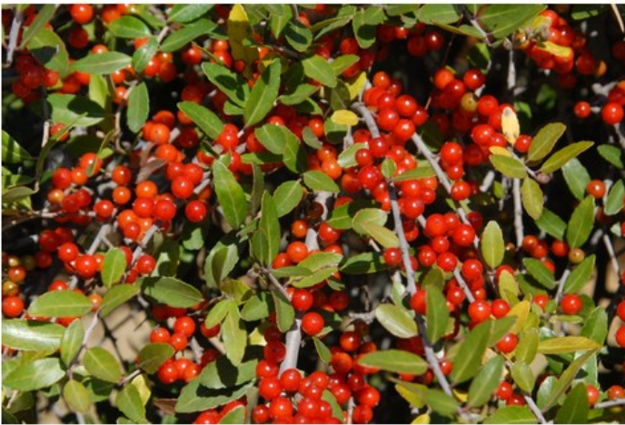
Fruit Close-up