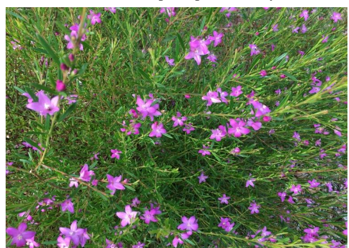
recently where they have a very healthy display of Crowea exalata underneath the restaurant deck along with Philotheca myoporoides .

They are lovely plants which flower for many months, including winter, in sun or shade and the bushes are a useful size for small gardens, growing up to 70 cm. My C. exalata plants have multiplied, I'm assuming this is from seeds but I'm not sure. The new plants appear close to the original ones. Pruning needs to be done to keep the plants bushy.