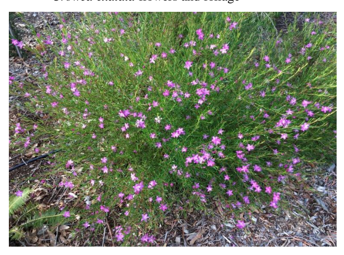
Crowea exalata flowering bush