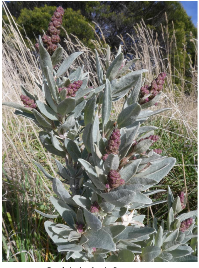
Purple buds of male flowers