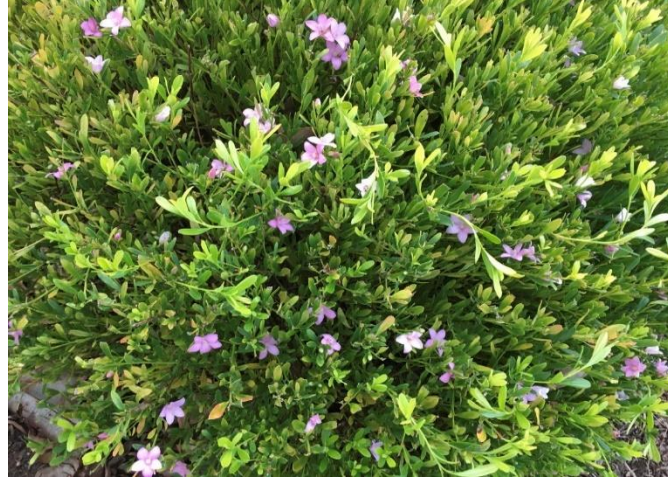
Crowea saligna flowering bush