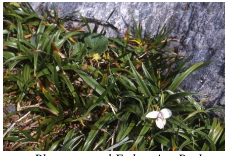
Plants around Federation Peak

able to notice some of the small alpine plants present, including the beautiful Richea alpina (short candleheath), leaves of Milligania sp, Geum talbotianum (Tasmanian snowrose) and Orites milliganii (toothed orites), and an unexpected flower of Diplarrena latifolia (western flag-iris).