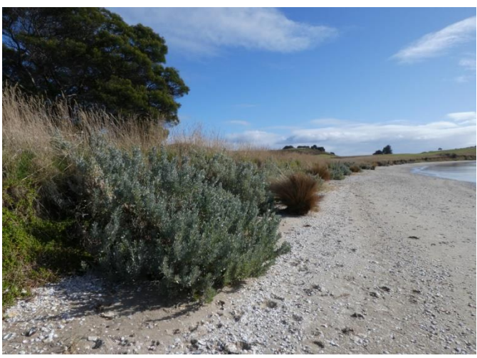
Atriplex cinerea at high water mark on Shelly Beach Atriplex cinerea is usually a much-branched, rounded shrub about 1 m high, with dense silvergrey foliage and ridged stems. The leaves are up to 8 cm long, elliptic to oblong, and have a slightly sticky feel due to bladder-like hairs. The male flowers are in crowded spikes at or towards the end of the branches and are purple when in bud, becoming creamy yellow when the anthers emerge. The female flowers are more modest, being in small clusters and occurring lower down in the which leaf axils. As they mature they become corky allows them to float so they can find new locations.

Atriplex cinerea is excellent for coastal revegetation and stabilisation – quite a lot of erosion was evident along parts of the beach, but less where this plant occurred. It would make a good contrast plant in a reasonably well drained garden site, and would be very happy in a coastal garden which would be subject to salty conditions. Apparently, the foliage can be used for its salty, herby flavour in soups and stuffings or can be cooked like spinach. I haven't tried it myself!