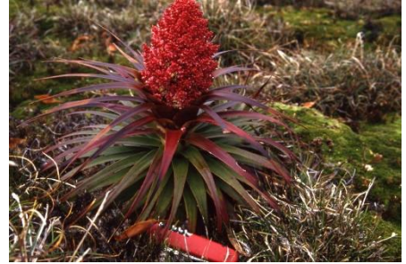
Richea alpine Mt Bobs

Then down again, more carefully, trying not to look all the way down to Lake Geeves, 700m below. Around and up the final steps of the Traverse, and we were on the flat part of the range again. And I was