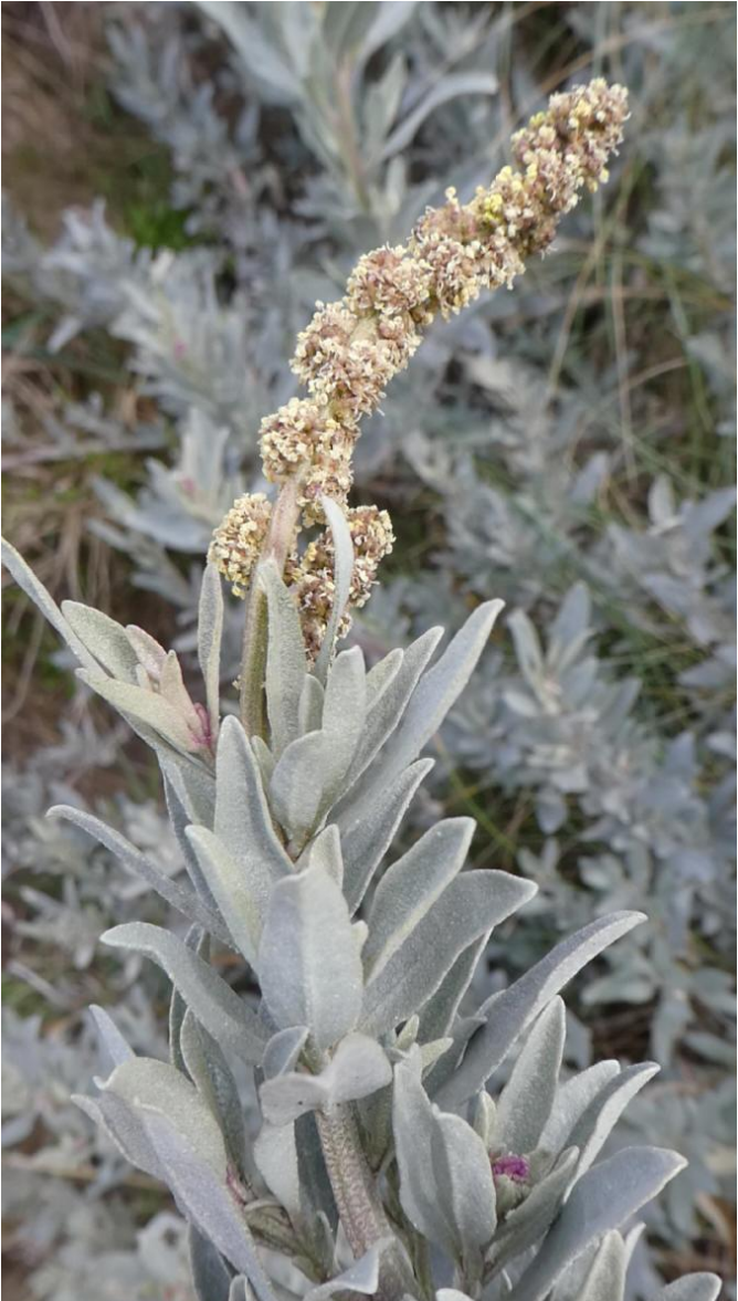
Male flowers showing creamy anthers

One of the interesting plants on our walk earlier this month was the grey saltbush, Atriplex cinerea which lined Shelly Beach which is north of Opossum Bay on the eastern side of Arm End. Recently moved, with all its friends, from the family Chenopodiaceae to Amaranthaceae, it is salt tolerant and usually found at the high-water mark.