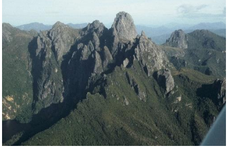
Federation Peak from the air

This is from a talk given to Hobart Group on 9 August, 2023. Federation Peak is perhaps the most spectacular wild place in Tasmania, and the most rugged of any of Australia's mountains. Located at the eastern end of the heavily glaciated Arthur Range, in the central part of the South-West, the 1225m peak is difficult to get to by either of the main routes – from the end of the Picton Forestry Road at Farmhouse Creek, via the West Craycroft Valley and Moss Ridge, or from the Arthur Plains via Luckman's Lead and the Eastern Arthur Range. Getting to the peak is one thing, but the final ascent is a