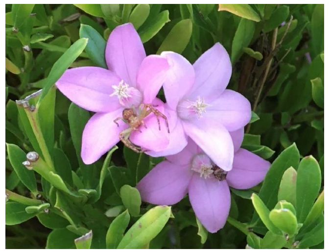
Crowea exalata flower