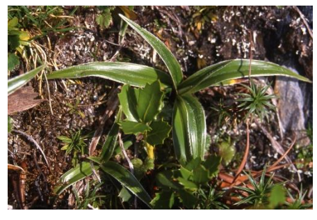
More plants around Federation Peak

After a quick visit to Hanging Lake and its encircling moraine, John then led us along the range, around a projection called the Devils Thumb, and down the Forest Chute on the north side of Federation. Through a fine old rainforest, with occasional glimpses up to the awesome faces of Federation, past Lake Gaston at the bottom, then up a remarkably clear pebbly rock chute (a glacial phenomenon most likely) back to Bechervaise camp. We returned via Moss Ridge – a bit easier going down – the next day, after the most exhilarating experience I've ever had in the bush.