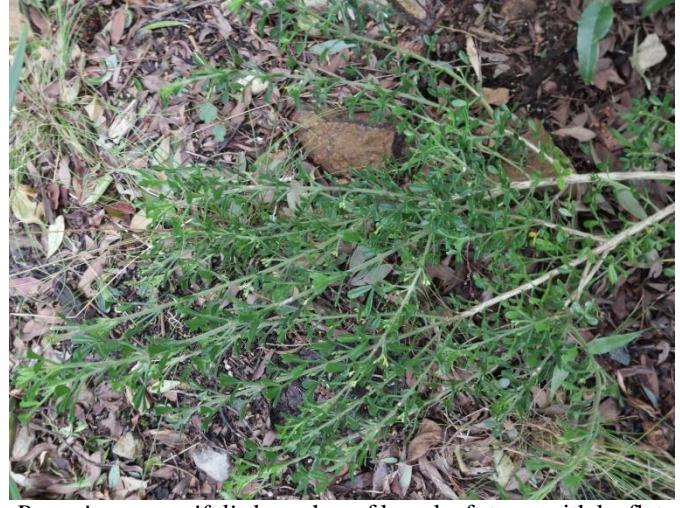
Boronia anemonifolia branches of long leaf stems with leaflets