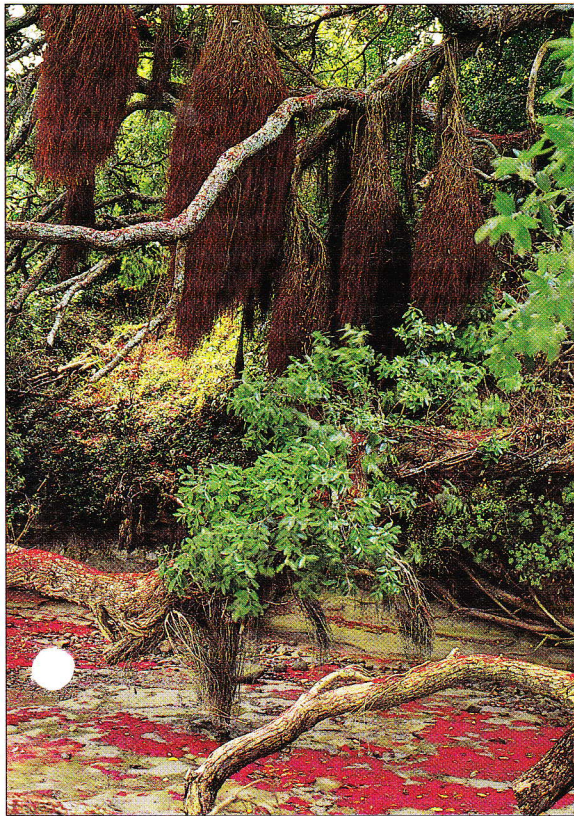
ABOVE: Mature pohutukawas often develop curious aerial roots.

where their survival is threatened. Possums are causing great damage, particularly to trees which are already under stress from other causes. Many pohutukawas are now growing without the plants they once associated with. Where previously the bush grew around and behind them, livestock now graze, trampling their roots and depriving them of their natural litter.