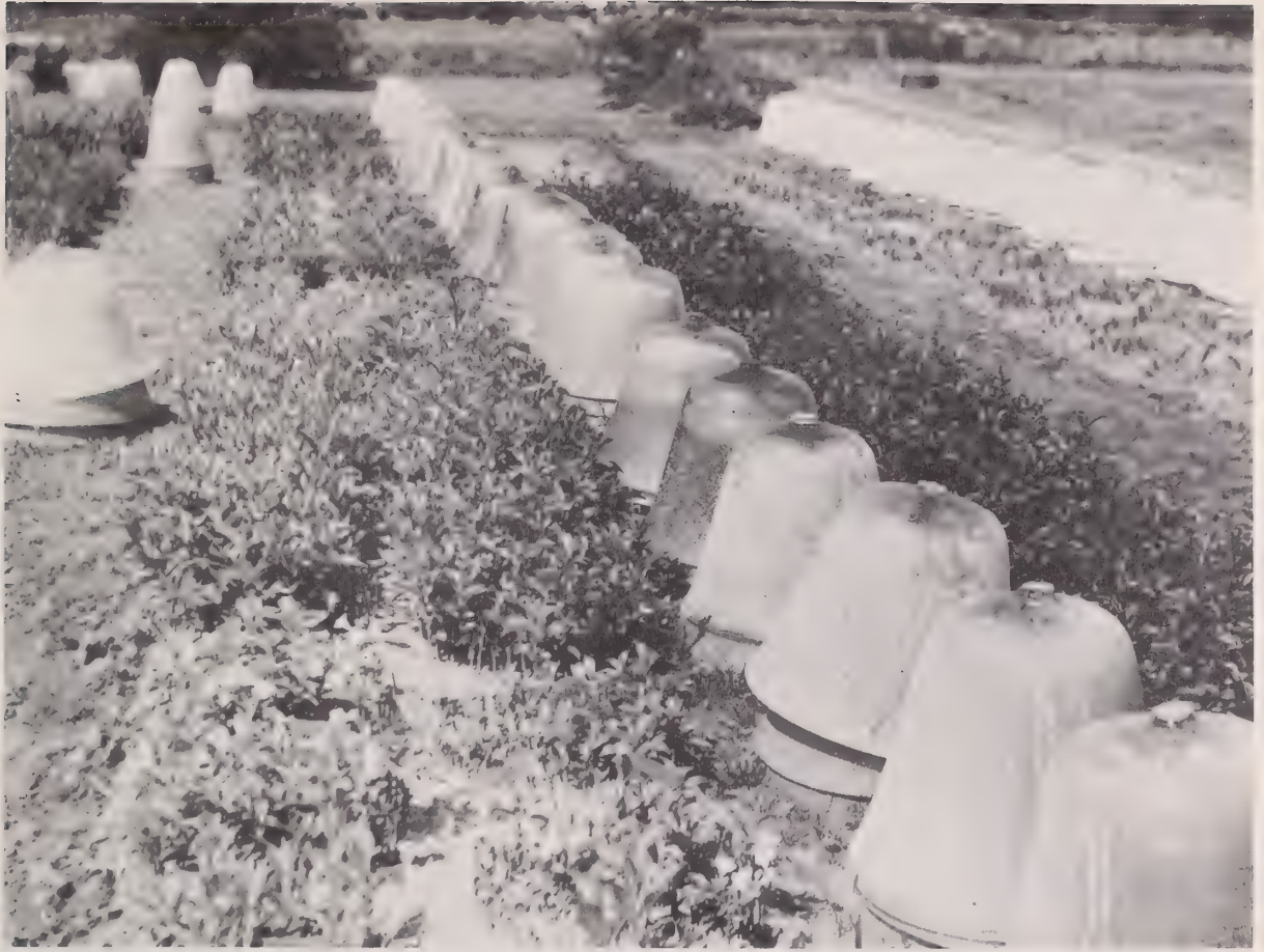
Figure 4. --Rows of cuttings rooted under bell jars in the field, Boskoop.

Plants produced in greatest abundance of Boskoop encompass three major groups--broad-leaved evergreens, deciduous flowering shrubs, and conifers. Of broad-leaved evergreens, the following are important: Rhododendrons and azaleas ( Rhododendron ), holly ( Ilex ), and barberry ( Berberis ). Deciduous flowering shrubs, such as Forsythia , Magnolia , Weigela , Deutzia , and Ligustrum , are grown on an extensive scale. Conifers, especially dwarf-growing kinds, are featured in nearly every nursery. Tall growing sorts, such as the well-known Koster and Moerheim blue spruce ( Picea pungens 'Koster' and 'Moerheimii') are still grown at Boskoop in large numbers. Polyantha and floribunda roses are produced on a limited scale, but no hybrid tea roses are grown. Russell lupin ( Lupinus ), Astilbe , and Salvia × superba are grown extensively by a few nurseries specializing in perennials.