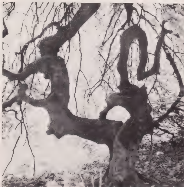
Figure 45. -- Fagus sylvatica 'Tortuosa'. Naturally occurring phase of the European beech of slow growth and with contorted branches. Park of Wilhelmshöhe, Kassel, West Germany.

Fraxinus spaethiana Lingelsh, a Japanese ash with petioles much swollen at the base; 30 feet tall.