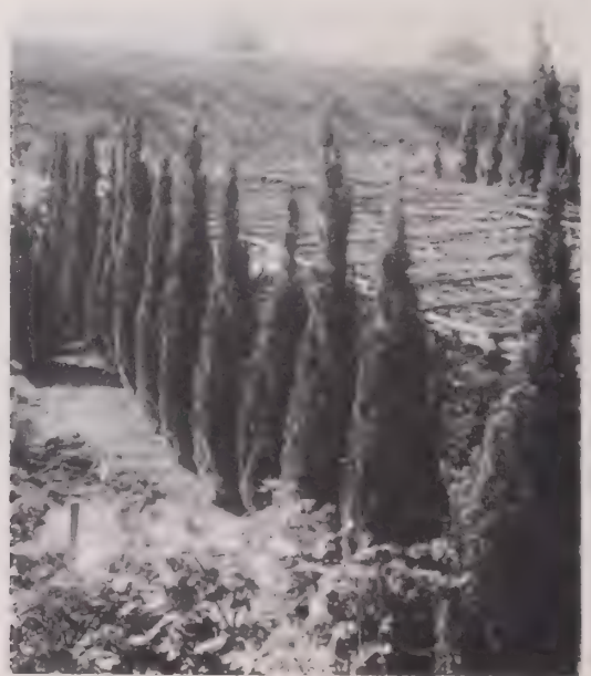
Taxus baccata 'Fastigiata Robusta' (P.I. 266556).

Vigorous, fast-growing fastigiate plant of the English yew, with dark-green foliage. Young plants shown in nursery of Herman Zulauf, Schinznach-dorf, Switzerland, where this cultivar was originally produced.