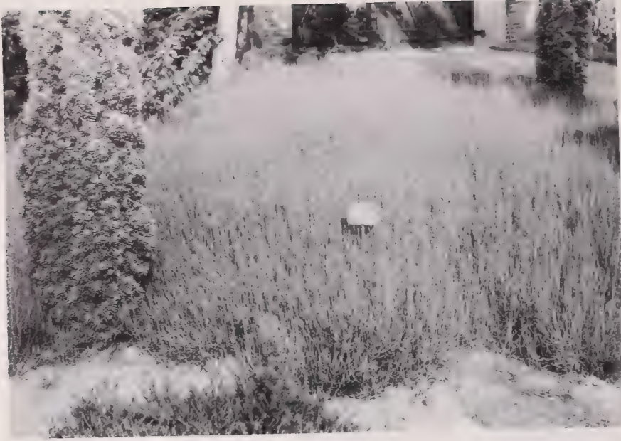
Figure 20. -- Ephedra distachya L. , 12 inches tall, used as a ground cover, Pinetum Blijdenstein, Hilversum.