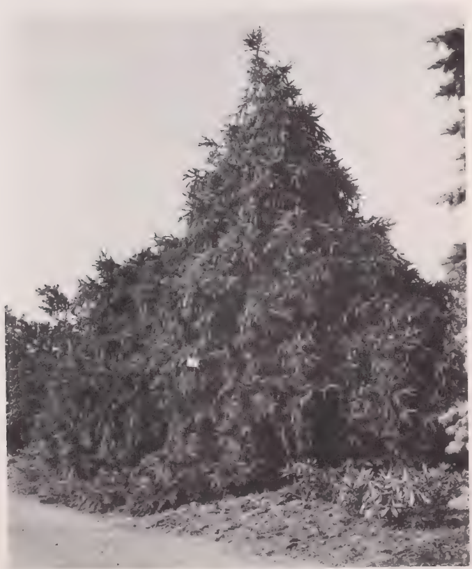
Figure 27. -- Picea abies 'Acrocona'. Slow-growing selection of the Norway spruce, densely branched, the cones borne on the branch tips. Nursery of H. A. Hesse, Weener/Ems, West Germany.