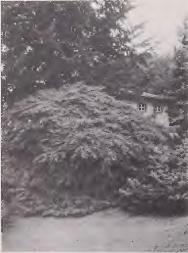
Carpinus betulus 'Pendula'. Plant 50 to 60 years old, 120 feet in circumference with a branch spread of 30 feet. Siebenbergen, Karlsau, Kassel, West Germany.