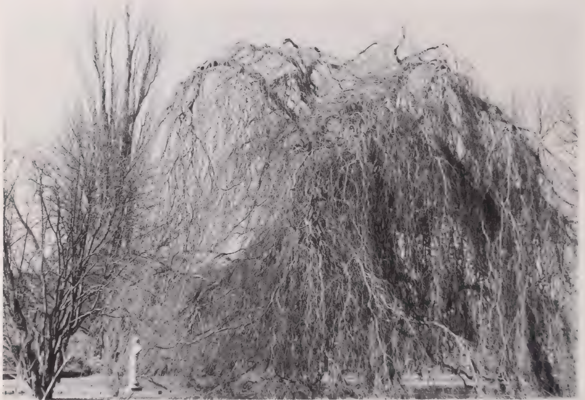
Figure 22. -- Fagus sylvatica 'Pendula', the European weeping beech. Specimen 45 feet tall with a branch spread of 66 feet at ground level; planted in 1830. Hortus Botanicus, Leiden, Netherlands. (Courtesy of Ding Hou.)

Fagus sylvatica L. 'Pendula', weeping beech, 45 feet tall with a branch spread of 66 feet at ground level; planted 1830 (fig. 22).