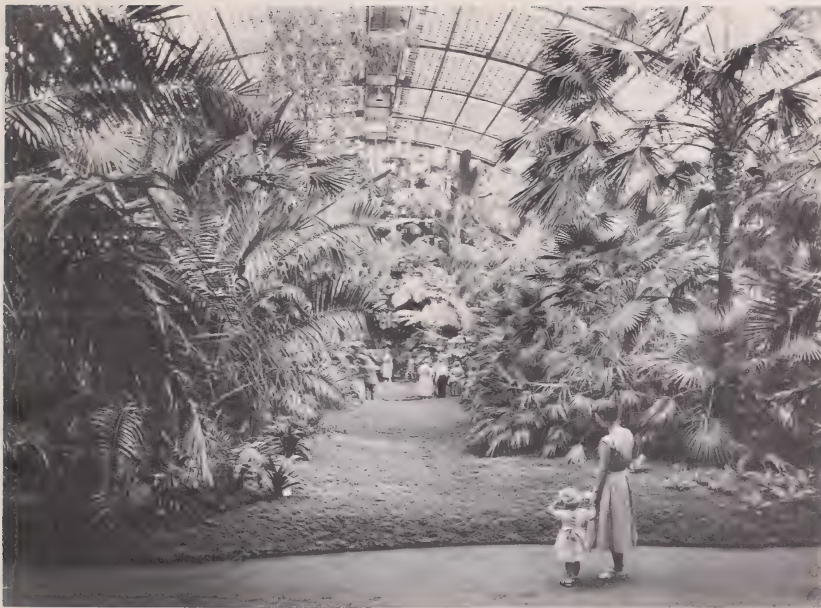
Figure 46. --Inside the large palm house, Palmengarten, Frankfurt am Main, West Germany.