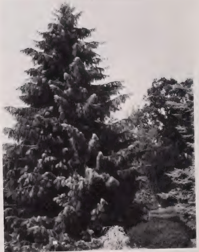
Figure 21. -- Brewer spruce (Picea breweriana) , 25 feet tall, Pinetum Blijdenstein, Hilversum.