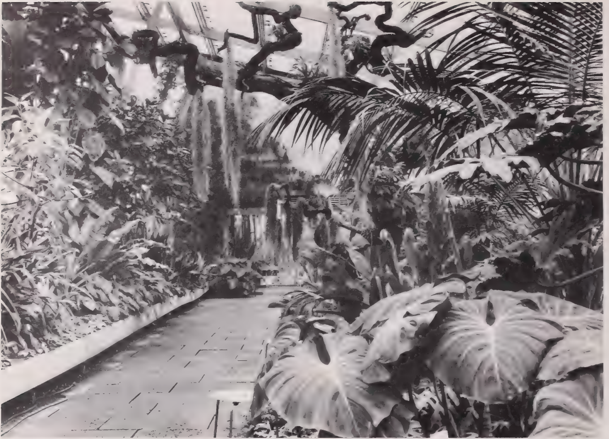
Figure 39. --View of the new conservatory of the Berggarten, Hannover, with tropical plants.

Philodendron wendlandii Schott (Araceae). An aroid collected in Costa Rica by Herman Wendland in 1857.