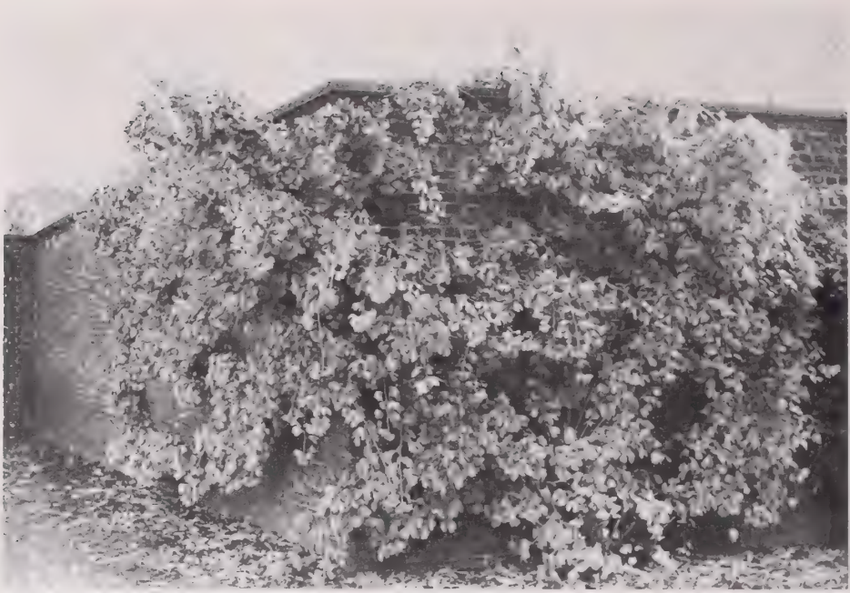
Figure 41. -- Ginkgo biloba 'Pendula', with strongly pendulous branches, espaliered on a garden wall; planted in 1848. Berggarten, Hannover, West Germany.

Sophora japonica L. 'Pendula'. A large specimen grafted on a standard stem 15 feet tall, the pendulous branches with a 25-foot spread.