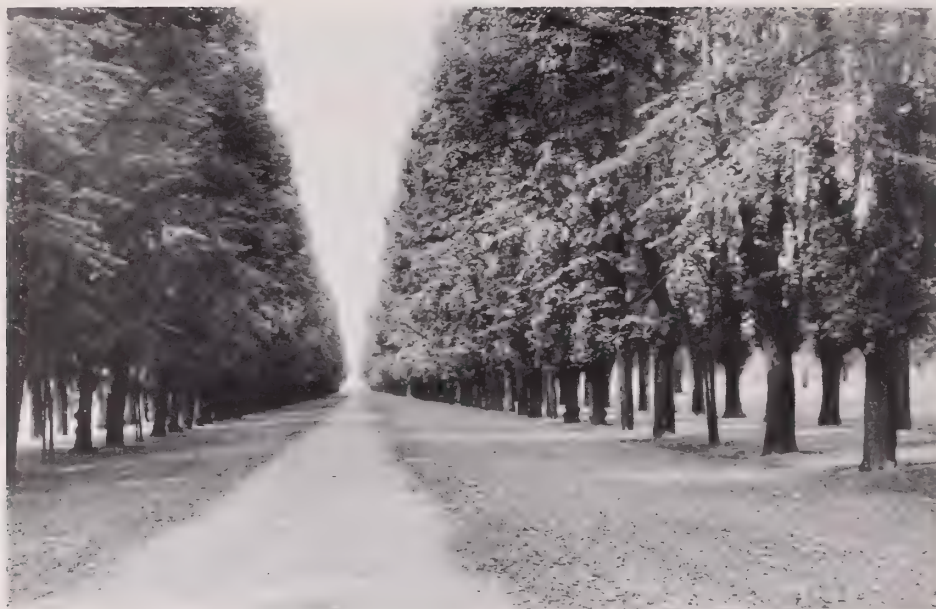
Figure 36. --The grand "Allée of Herrenhausen," 1-1/4 miles long, planted in 1727 with 1,316 lime trees ( Tilia platyphyllos Scop.). Royal Garden of Herrenhausen, Hannover, West Germany.

nearby, also was developed under royal patronage, but as a botanic garden for scientific purposes.