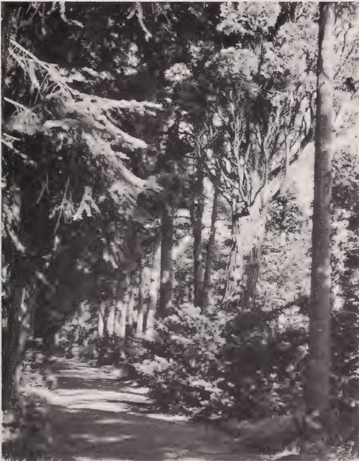
Figure 50.--Avenue of conifers originally planted as a nursery row about 80 years ago. Kalmthout Arboretum, Kalmthout, Belgium

The de Belder family acquired the property in 1951 and quickly restored the derelict nursery of about 20 acres. Many old specimen trees exist throughout the property; around these, new introductions are constantly being added. An avenue of tall conifers (fig. 50), originally planted as a nursery row during the days of