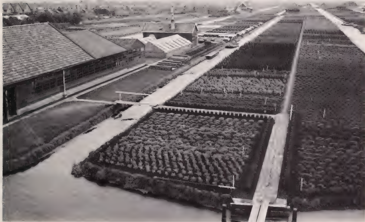
Figure 2. --View of nurseries bordered by canals, Boskoop.

The Boskoop nursery area near Leiden and Rotterdam is a classic example of the efficient management of land by the Dutch. Indeed, Boskoop is unique among areas devoted to nursery crops. Most impressive are the neatly tended nursery plots, the innumerable canals, and the colorful houses of the nursery owners. In all, approximately 675 nurseries are located on 1,400 acres, once the bed of an ancient lake. The area virtually is a latticework of canals. In fact, canals are the main thoroughfares of trade in this town of more than 8,000 people (fig. 2). Attractive homes of the nurserymen, some with thatched roofs, stand in neat rows, many with lawns and flowerbeds that extend to the edge of the canals, which in summer are infested with duck-weed ( Lemna ) and mosquito-fern ( Azolla ).