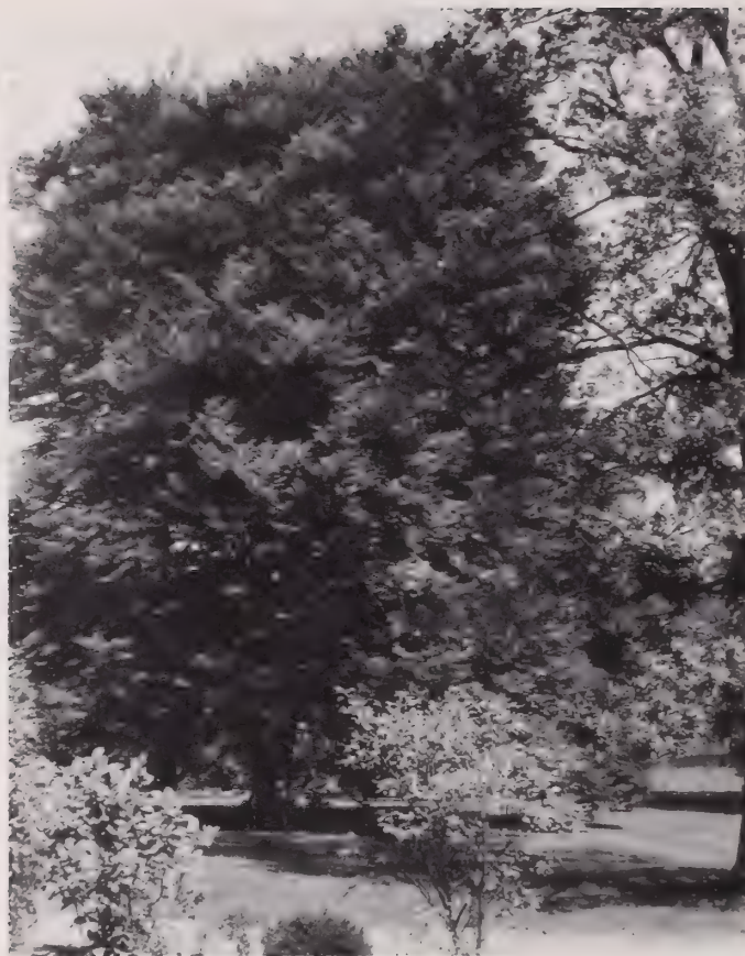
Figure 43. -- Fagus sylvatica 'Laciniata', a large specimen of the fern-leaved beech, botanic garden, Dortmund, West Germany.