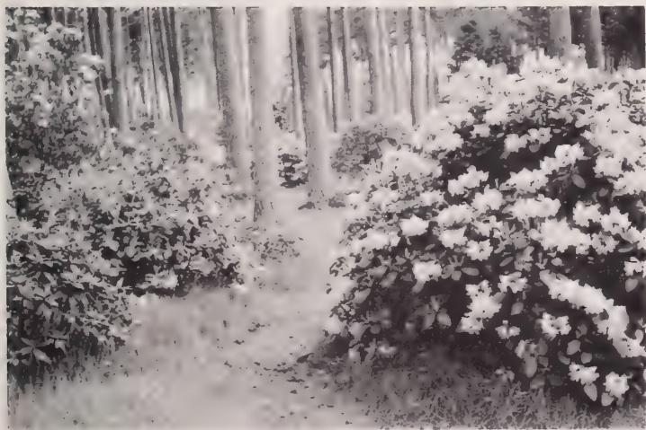
Figure 34. -- Rhododendron williamsianum hybrid (foreground) in Scotch-pine ( Pinus sylvestris ) woodland. Dietrich Hobbie rhododendron garden, Linswege, Oldenburg, West Germany. (Courtesy of Dietrich Hobbie.)

The first Hobbie hybrids were crosses of R. 'Britannia' × R. williamsianum , which produced the clone called R. 'Ammerlandense' . The hybrid of R. 'Britannia' × R. forrestii var. repens has produced an outstanding clone called R. 'Linswegeanum' . A plant of great beauty is R. 'Isaac Newton' , a selection of the hybrid R. catawbiense × R. thomsonii , backcrossed with R. forrestii var. repens .