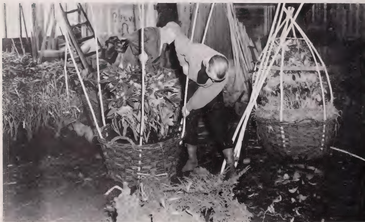
Figure 6. --Preparing plants for shipment, Boskoop.