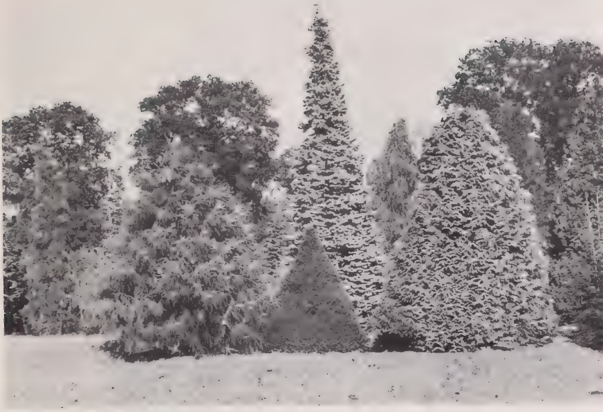
Figure 26. --Group of slow-growing conifers in nursery of H. A. Hesse, Weener/Ems, West Germany.