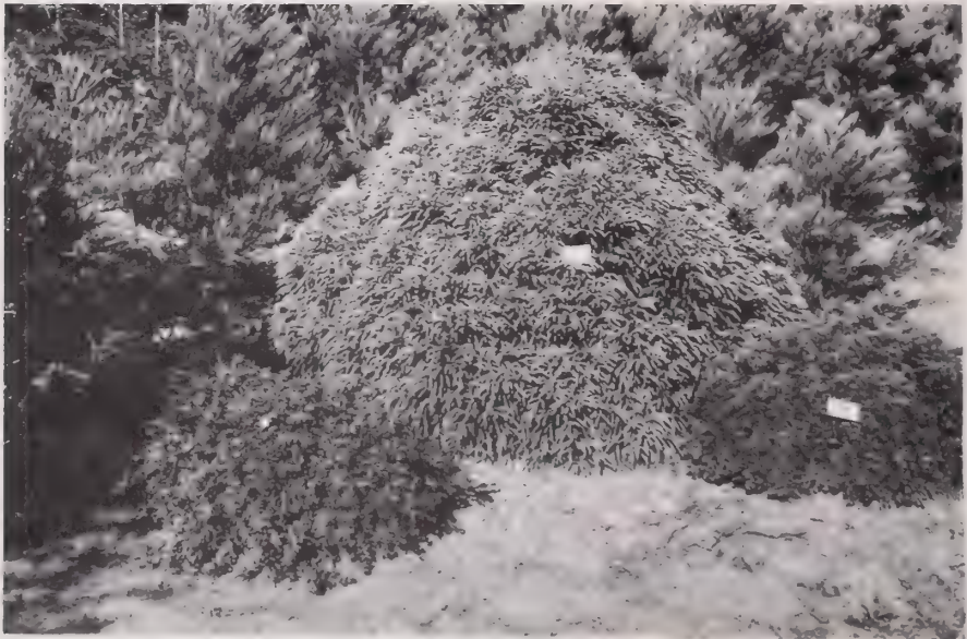
Figure 28. -- Picea abies 'Nidiformis' (foreground), a dwarf-growing selection of the Norway spruce with a flat-topped spreading habit. Nursery of H. A. Hesse, Weener/Ems, West Germany.