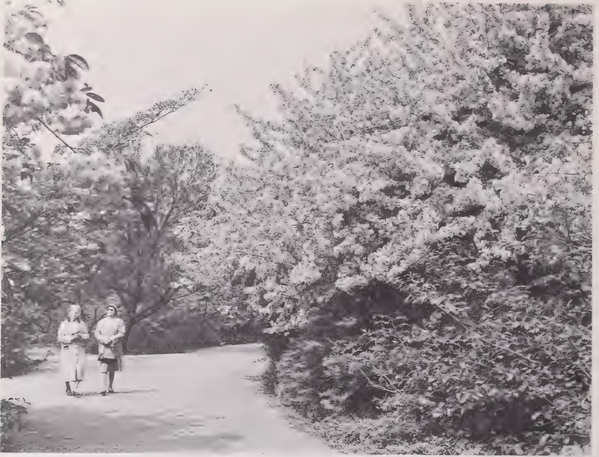
Figure 23. --Flowering crabapples in Zuider Park, The Hague, Netherlands.

Quercus palustris Muenchh. 'Umbraculifera', a seedling selection of the pin oak, with an umbrella-shaped crown.