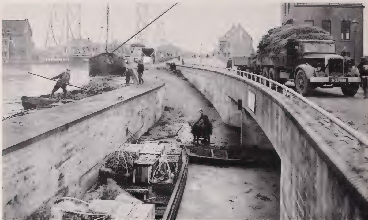
Figure 5. --Cargo of living plants ready for shipment, Boskoop.