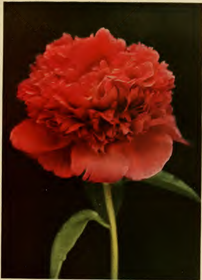
FELIX CROUSSE (Crousse, 1881)

Bomb type. A brilliant flower of good form which blooms freely