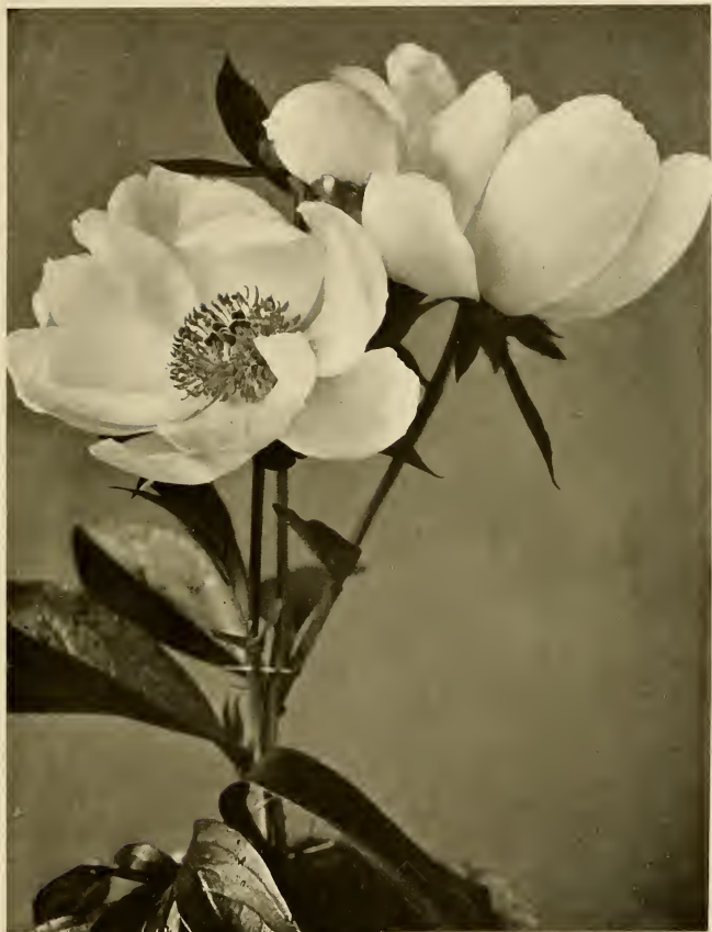
UNNAMED SEEDLING OF HERBACEOUS PEONY, SINGLE TYPE