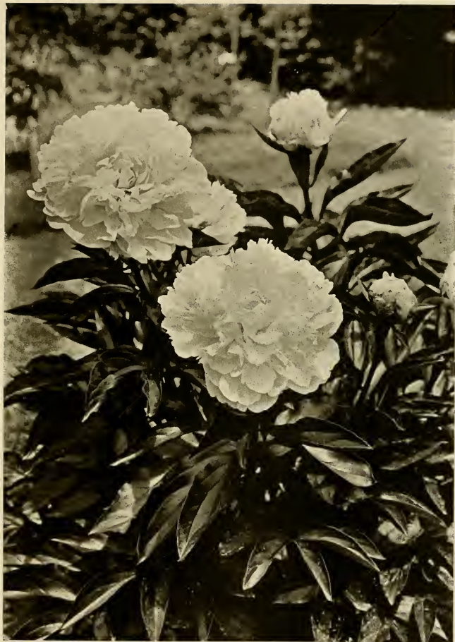
MADAME JULES DESSERT (Dessert, 1909)

Rose type. One of the newer peonies, white tinged with straw and flesh colour