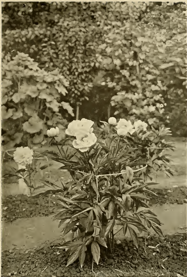
MADAME D. TREYERAN (Dessert, 1889)

Semi-rose type. The wire supports mentioned in Chapter VII are shown