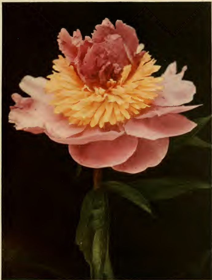
PHILOMELE (Calot, 1861)

Japanese or crown type. The collar of deep yellow gives this flower a most striking appearance