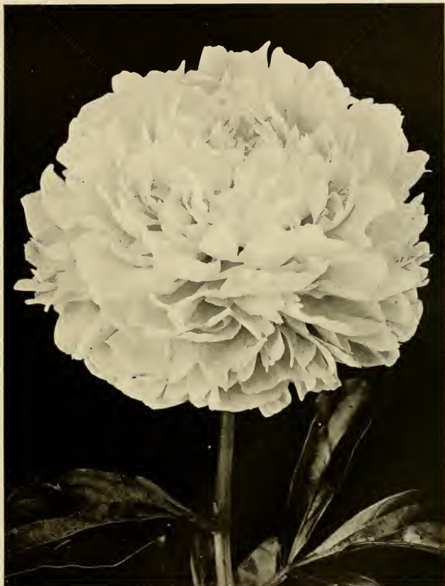
CLAIRE DUBOIS (Crousse, 1886)

Rose type. Strong fine flower of deep pink tinged with mauve