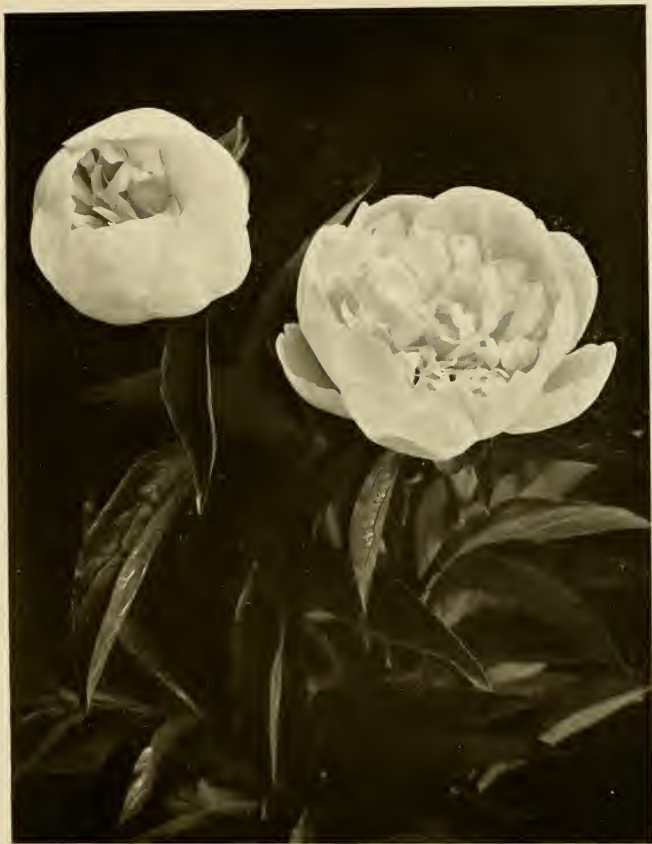
DUCHESSÉ DE NEMOURS (Calot, 1856)

Crown type. This lovely cup-shaped bud is of a greenish tint, which fades to pure white as the flower develops