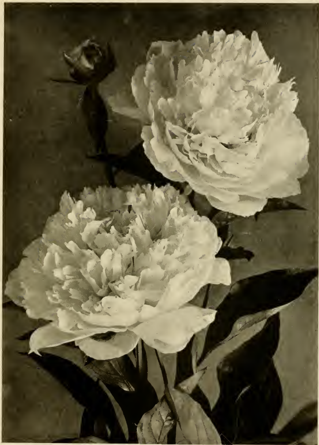
COURONNE D'OR (Calot, 1872)

Semi-rose type. A white peony of distinction and beauty which can be bought at a low cost