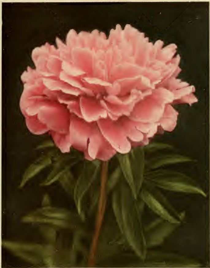
SOUVENIR DE L'EXPOSITION UNIVERSELLE (Calot, 1867)

Rose type. Large flat flowers of rich deep pink. Brilliant and free-blooming variety