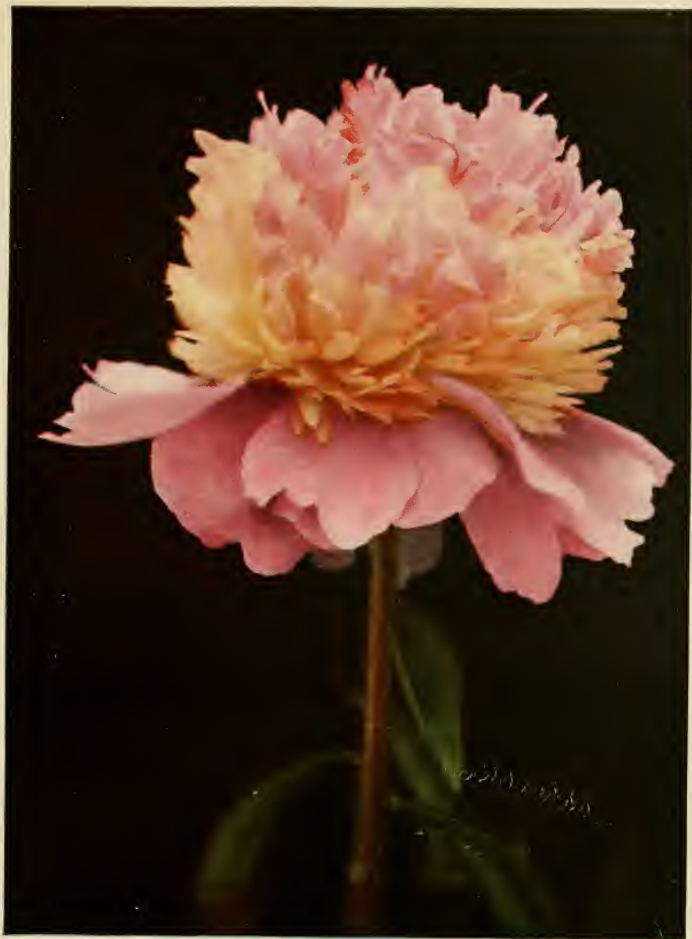
GLOIRE DE CHAS. GOMBAULT (Gombault, 1866)

Crown type. Colouring and form of great charm. A moderate sized peony which blooms freely