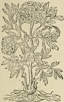
3 Pœonia femina multiplex. Double red Peonie.