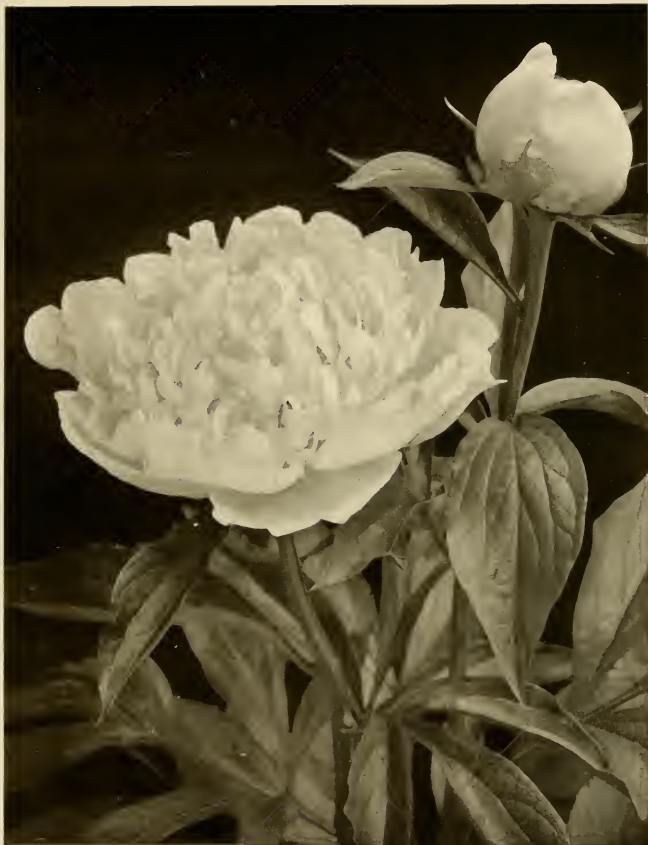
MADAME CALOT (Mieliez, 1856)

Rose type. A high-class and inexpensive light pink peony. It is strong-growing, free-blooming and fragrant