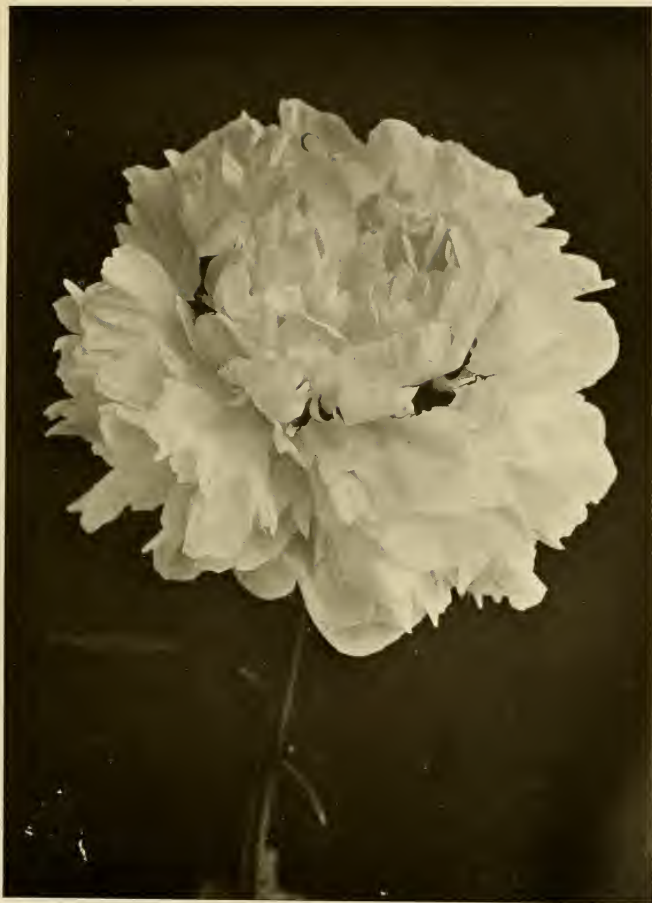
FESTIVA MAXIMA (Mieliez, 1851)

Rose type. One of the finest white varieties. An early and reliable bloomer. This inexpensive peony should be in every garden