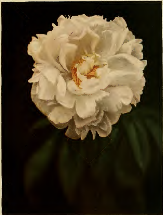
STEPHANIA (Terry, 1891)

Semi-double type. A cup-shaped peony of deep cream. The reflections from golden stamens intensify the colour and light up the flower