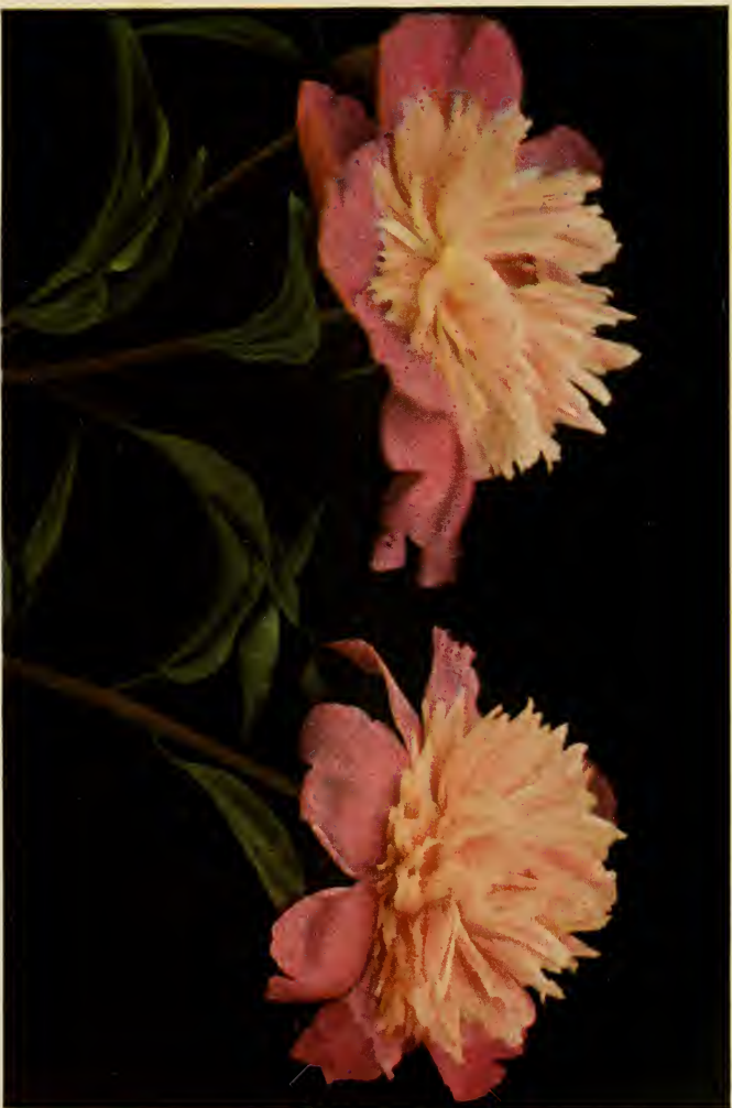
MRS. MCKINLEY (Terry)

Japanese type. A distinct and effective flower