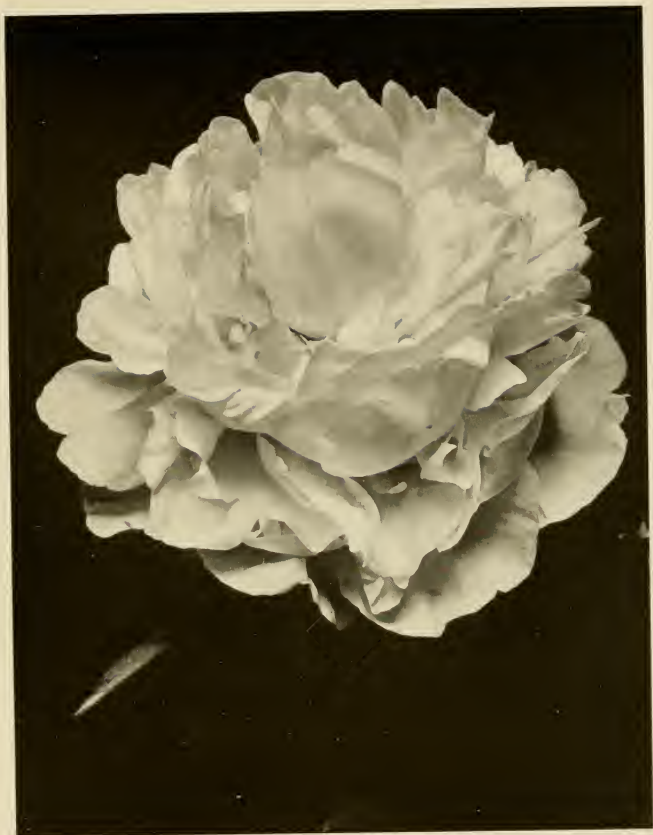
MADAME LEMONIER (Calot, 1860)

Rose type. Full flower of pale pink. The petals are unusually large and glossy