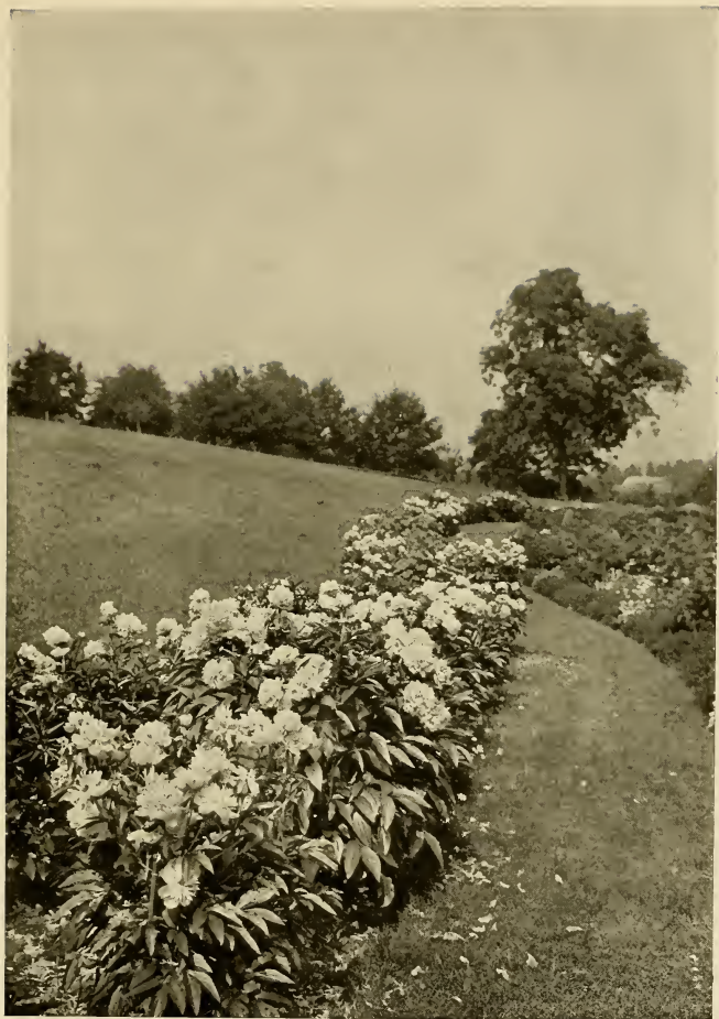
PEONIES IN LANDSCAPE PLANTING ON MISS MORRIS'S ESTATE NEAR PHILADELPHIA