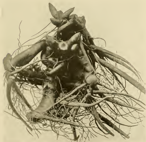
Dormant healthy peony root