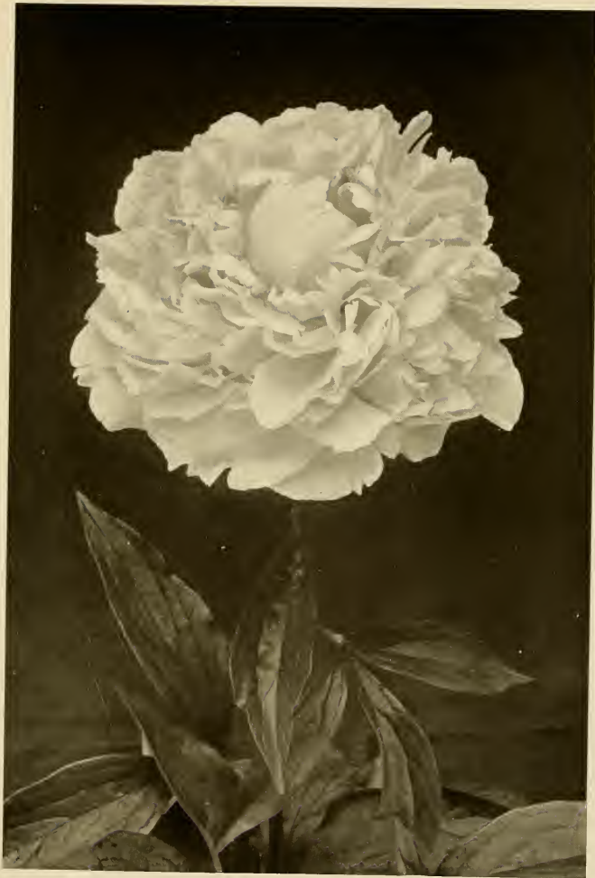
SARAH BERNHARDT (Lemoine, 1906)

Semi-rose type. Moderately deep pink peony of fine form