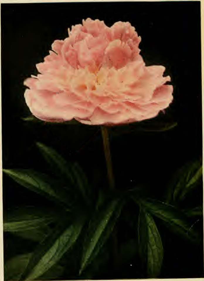
MODELE DE PERFECTION (Crousse, 1875)

Rose type. One of the fine pinks of unusual form. Has strong stems, beautiful foliage and is a free bloomer