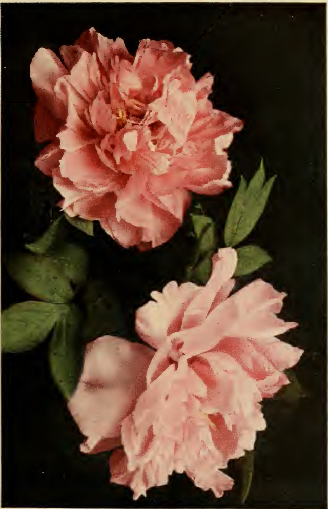
P. SUPERBICOSA OR MOUTAN, "CAROLINE D'ITALIE"

The tree peony, beloved of the Chinese and Japanese, and famous in Oriental art and literature