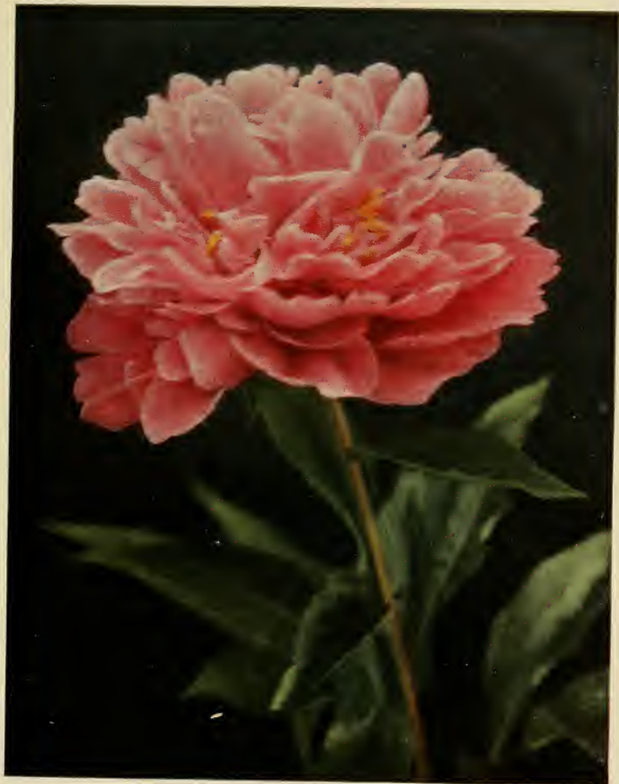
SUZANNE DESSERT (Dessert and Mechin, 1890)

Semi-rose type. Deep pink peonies of merit are not numerous. Suzanne Dessert, while it has a distinct mauve tint, possesses great beauty, which is accentuated by golden stamens and silver-tipped petals