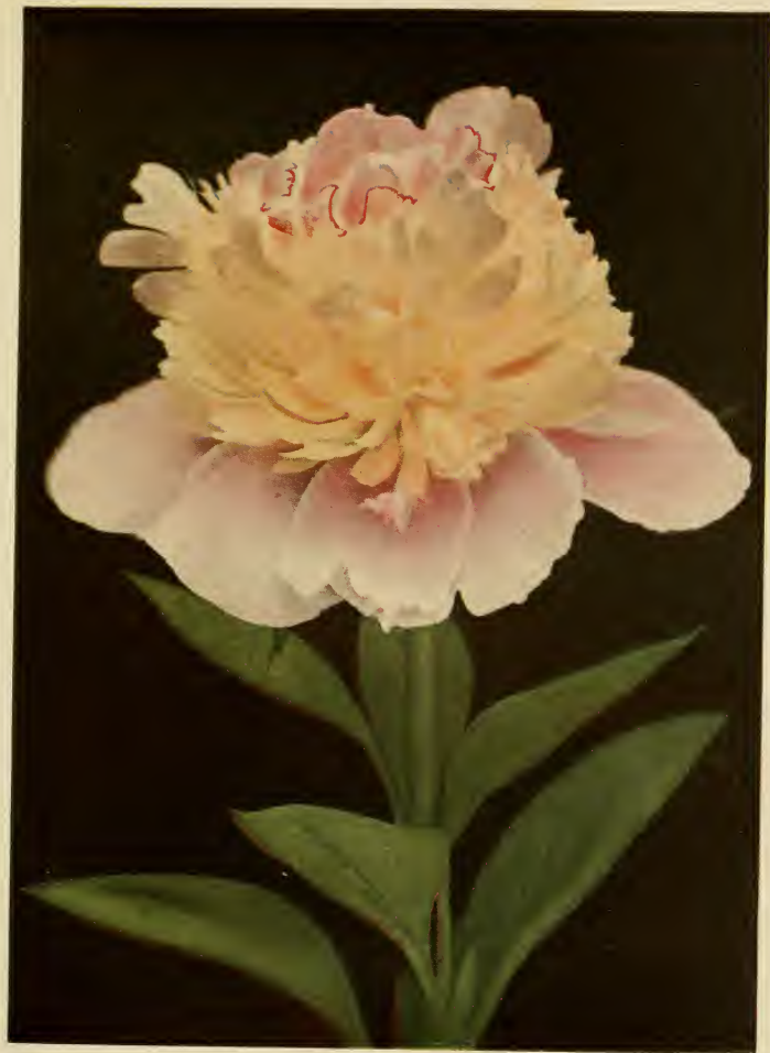
MADAME DE VATRY (Guerin, 1853)

Crown type. An inexpensive peony of great beauty