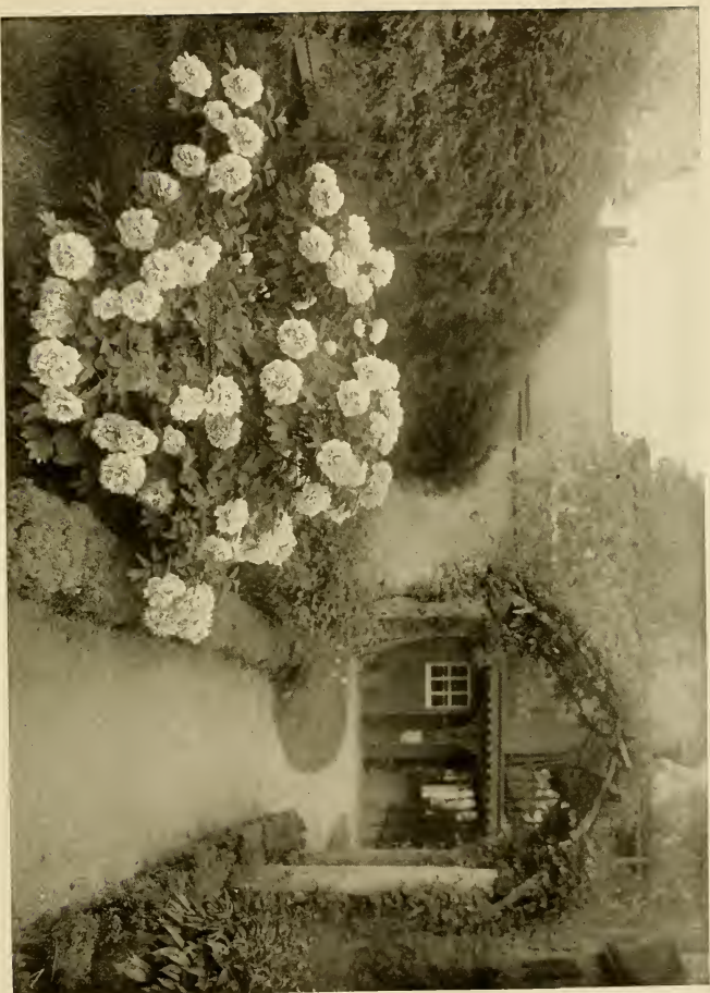
P. MOUTAN (TREE PEONY)

This plant in a garden in Germantown, Pa., bore over seventy blooms