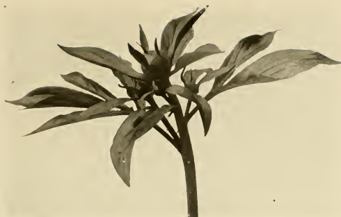
Stalk of P. albiflora showing terminal bud which should be left and lateral buds which should be removed or pinched off