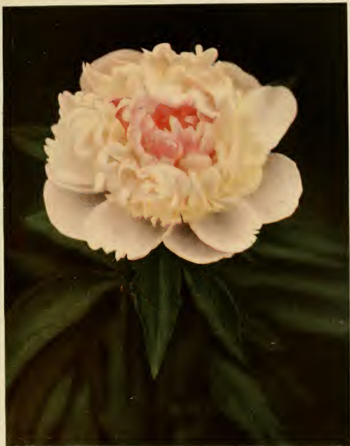
ALICE DE JULVECOURT (Pele, 1857)

Crown type. A well-built full flower of delicate rose blush and cream.