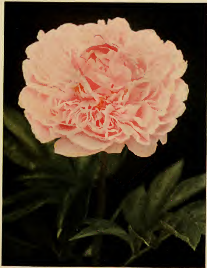
ASA GRAY (Crousse, 1886)

Semi-rose type. A wonderful shade of pink, illumined by the glow of its golden stamens. A strong grower and a profuse bloomer