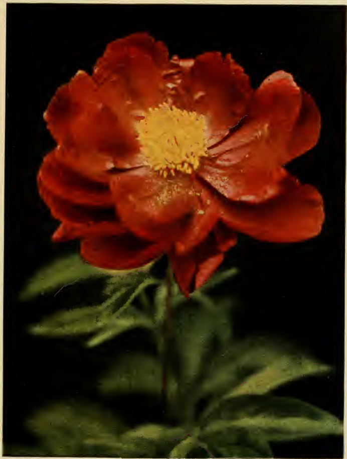
ADOLPHE ROUSSEAU (Dessert and Mechin, 1890)

Semi-double type. One of the finest reds. Blooms freely