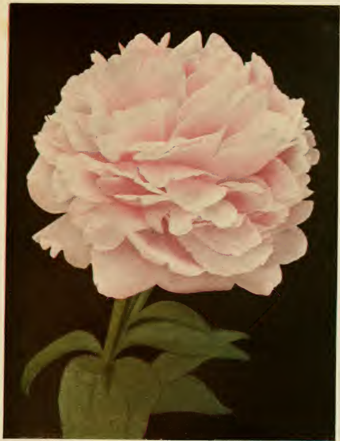
REINE HORTENSE (Calot, 1857)

Semi-rose type. Considered by many the finest pink peony. It has form, fragrance, strong stems and free-blooming qualities