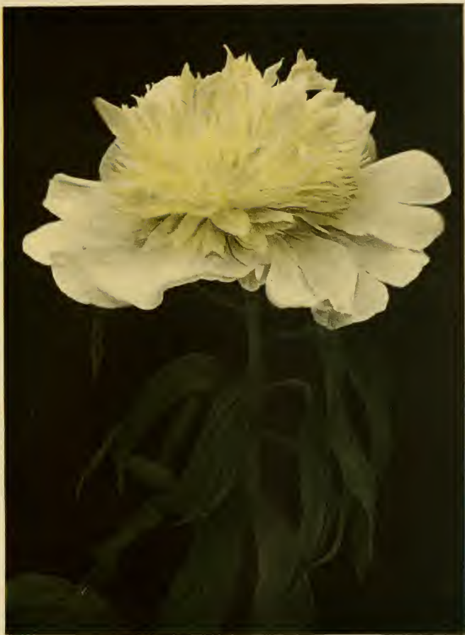
SOLFATARE (Calot, 1861)

Bomb type. A peony of exquisite beauty and distinction