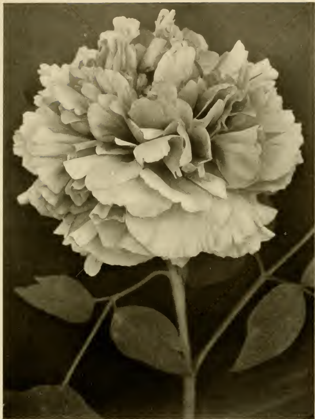
REINE ELIZABETH (P. Moutan)

One of the finest double tree peonies. The flowers are massive—salmon pink with brilliant copper tints