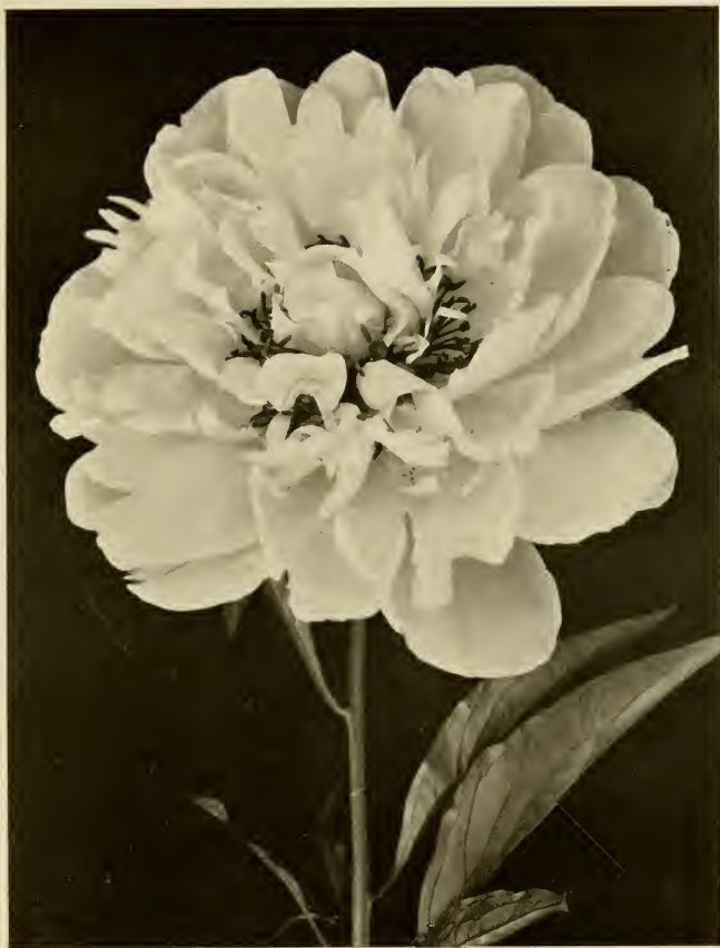
AURORE (Dessert, 1904)

Semi-rose type. An exquisite peony of delicate pale pink with prominent golden stamens. Excellent for cutting