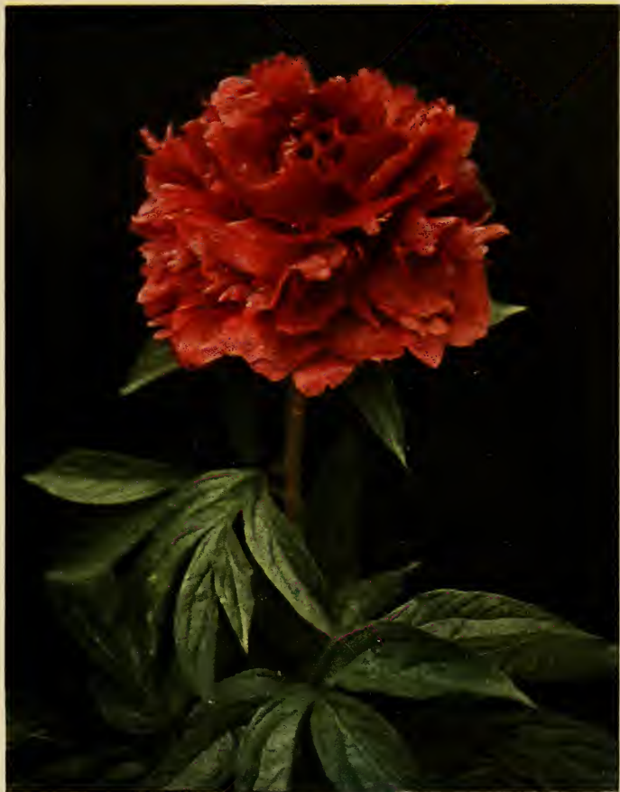
MADAME BUCQUET (Dessert, 1888)

Semi-rose type. A dark red peony of medium size, with fine foliage and reddish stems