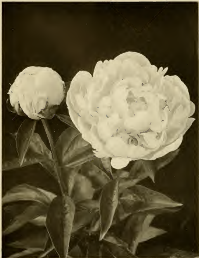
LA TULIPE (Calot, 1872)

Semi-rose type. This large ivory-white flower is flushed with pink. A strong-growing, desirable and inexpensive variety