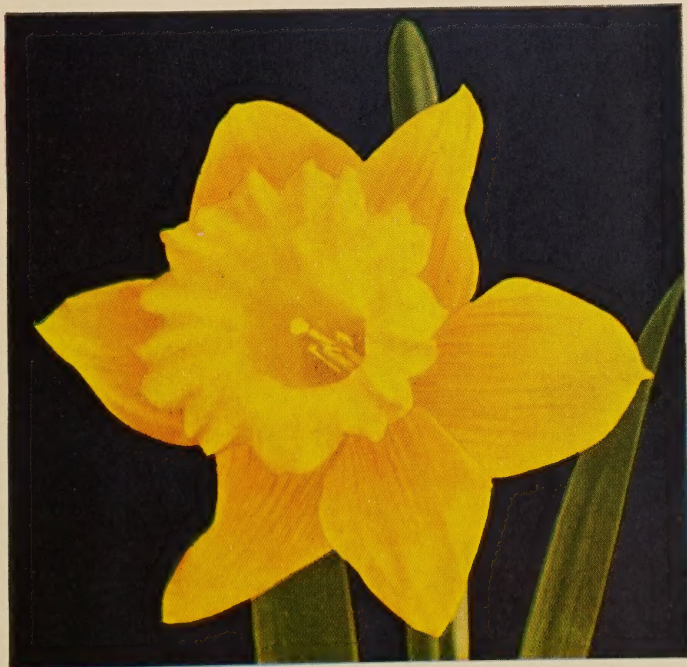
KING ALFRED DAFFODIL (See page 7)

Light yellow, golden yellow, pink, rose, red, white or sunset shades, containing all the tropical sunset colorings from apricot, coppery salmon to brilliant flame. No. 1 bulb: $1.00 per dozen; $7.00 per 100. Postage 10c.