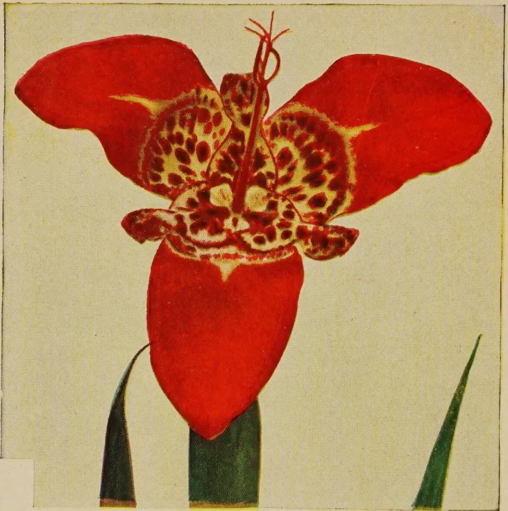
MEXICAN SHELL FLOWERS—TIGRIDIA