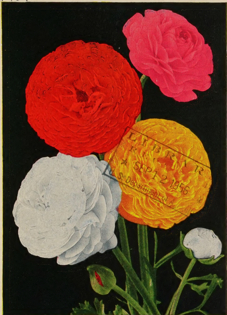
OUR PRIZE RANUNCULUS (See page 5)