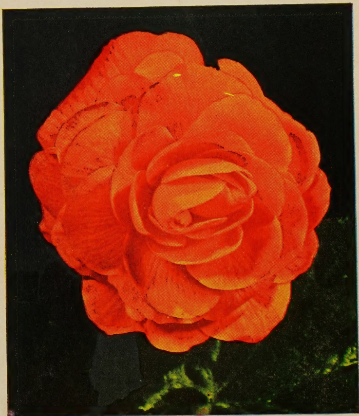
GIANT CAMELLIA-FLOWERED BEGONIA

2½-inch and up in diameter. Do not confuse these with old tubers—they are first year grown from seed, and will produce a magnificent plant. Same colors as above. Each, 60c; dozen, $6.00. Postage 25c.