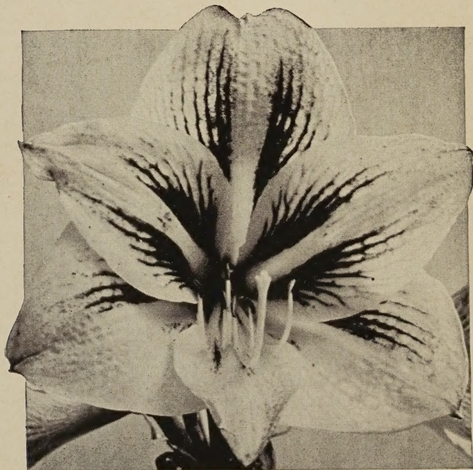
GIANT HYBRID AMARYLLIS (See page 4)

Yours for Better Gardens, BOB ANDERSON FLOWER BULBS Telephone: DUnkirk 9-0688