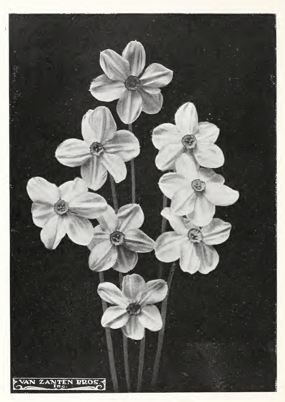
POËTICUS GLORY OF LISSE.