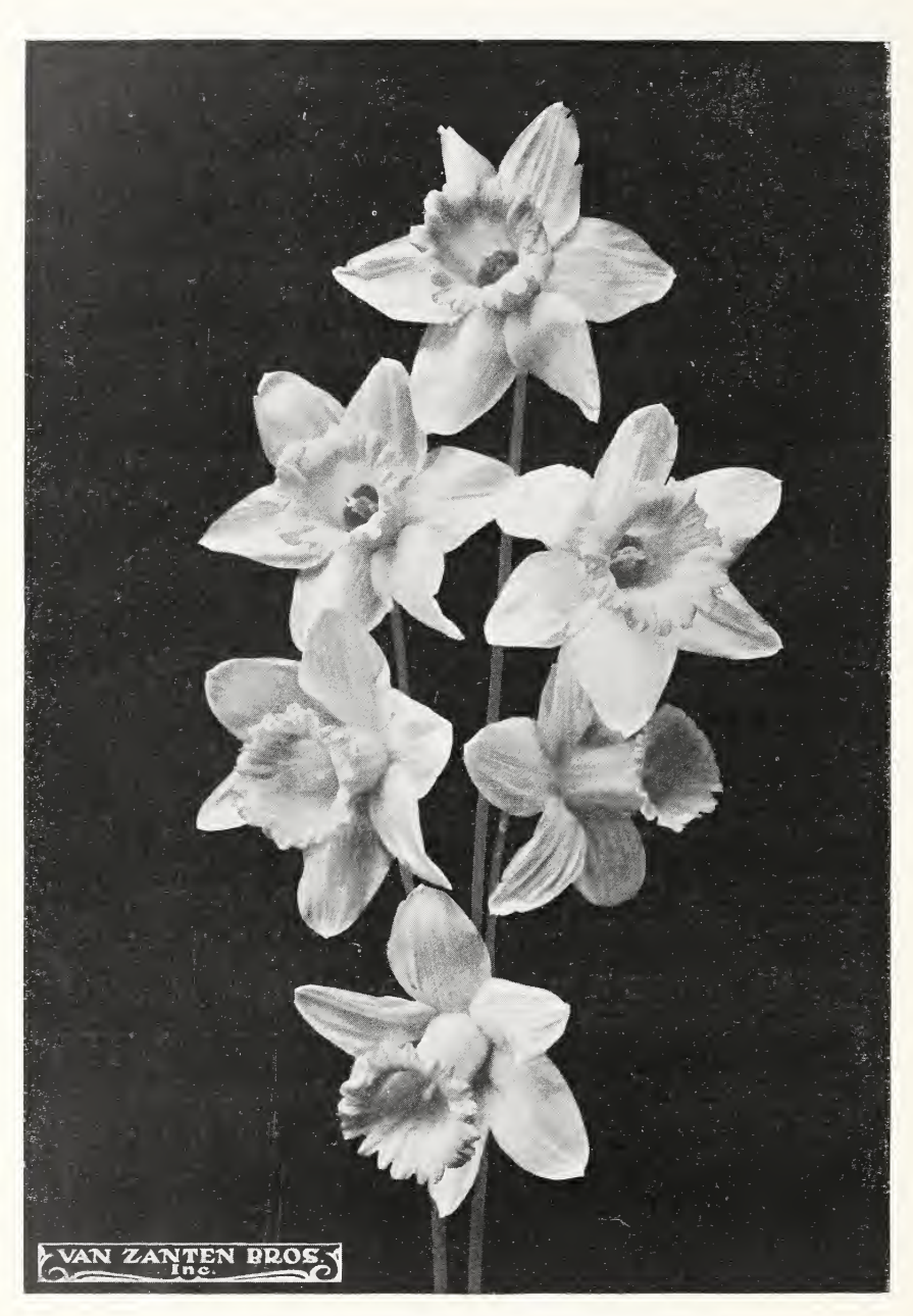
BICOLOR GLORY OF SASSENHEIM.