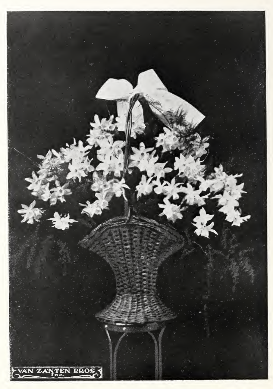
ORCHID NARCISSI THALIA.