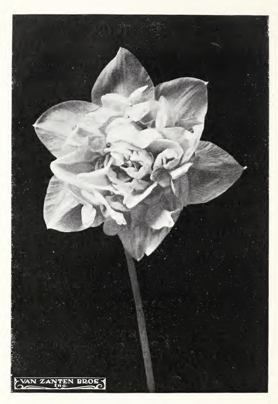
DOUBLE NARCISSUS INCOMPARABLE.