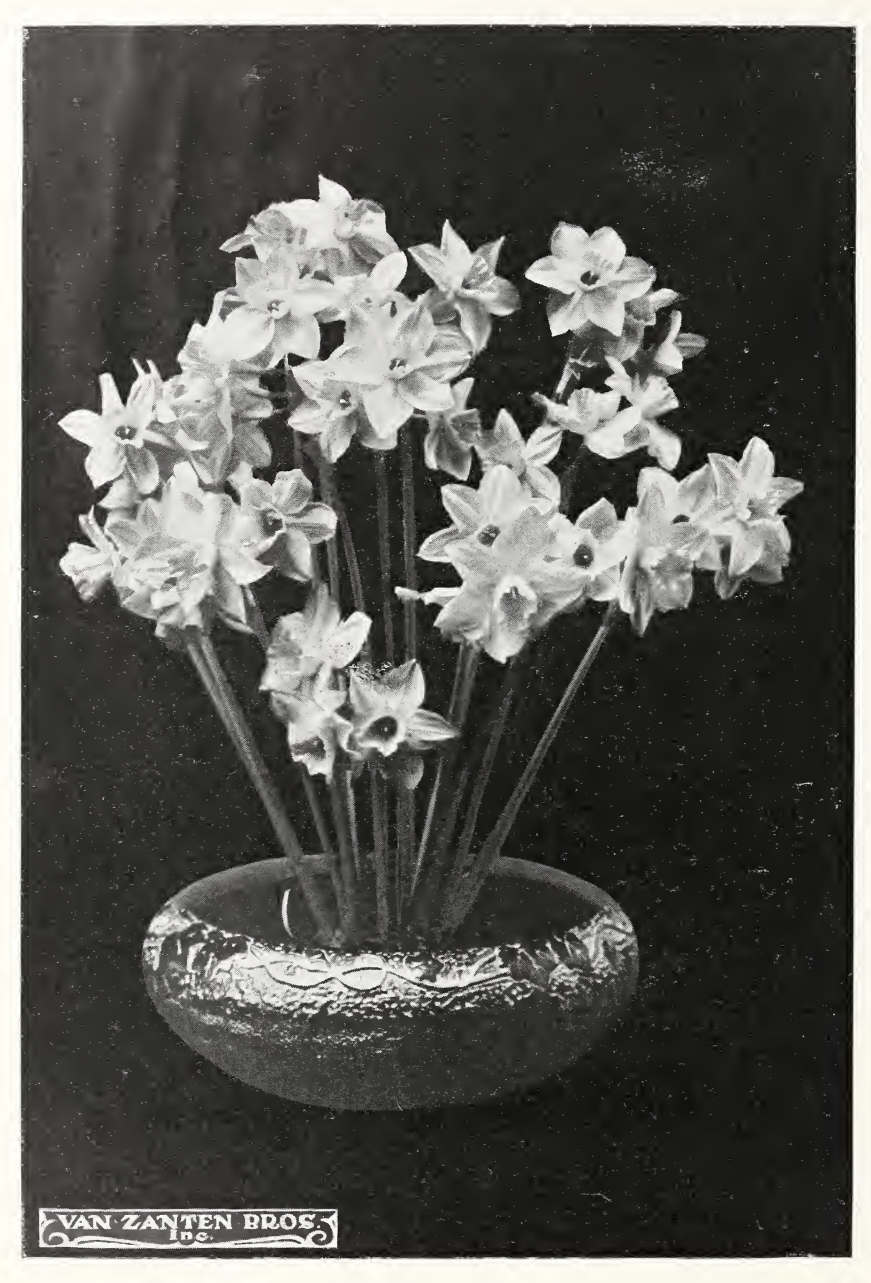
JONQUILS CAMPERNELLE REGULOSUS, SINGLE.