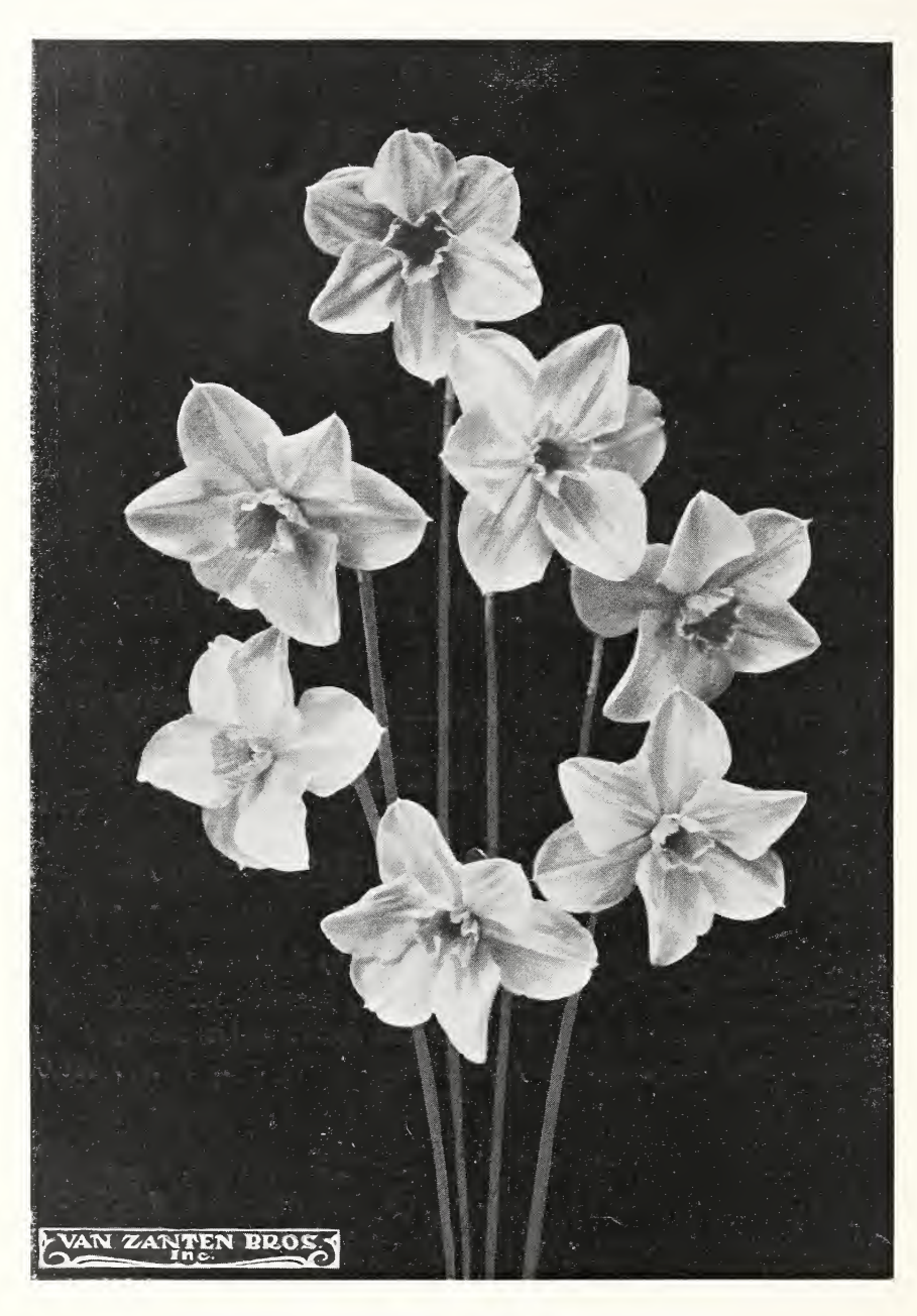
LEEDSII QUEEN OF THE NORTH.