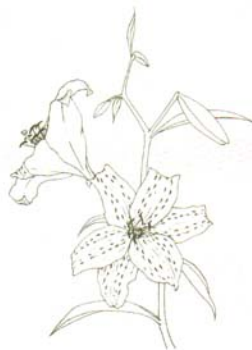
Fig. 2. Lilium auratum .