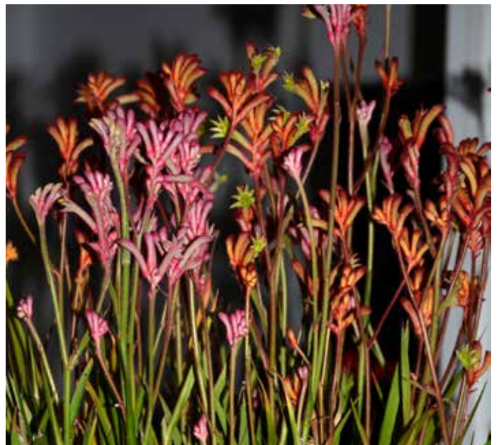
Images: Paddy's Pink, Eucalyptus cernua , Kunzea ambigua , Anigozanthos , Xerochrysum bracteatum , Eremophila 'Beryl'