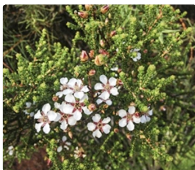
Flowers and leaves. Beecroft Peninsula, Jervis Bay, NSW