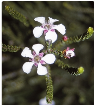
Flowers and leaves. Jervis Bay National Park, NSW