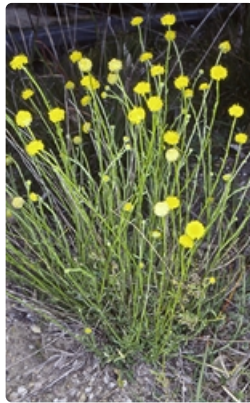
Flowering plant. between Candelo and Wolumla