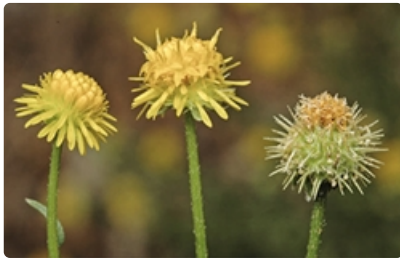
Flower heads. near Cowra