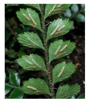
Close up of frond showing sori. © G. Sankowsky

Copyright © Australian Tropical Herbarium 2022, all rights reserved.