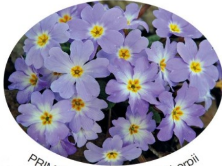
PRIMULA vulgaris ssp. sibthorpii