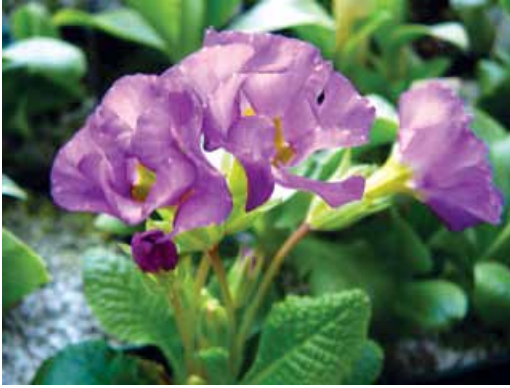
Rosie form acaulis , purple with luminescent tissue-textured petals, from Jay Lunn's seed donation of 2009-10, grown by Judith Sellers

A dark-stemmed candelabra primrose from seed