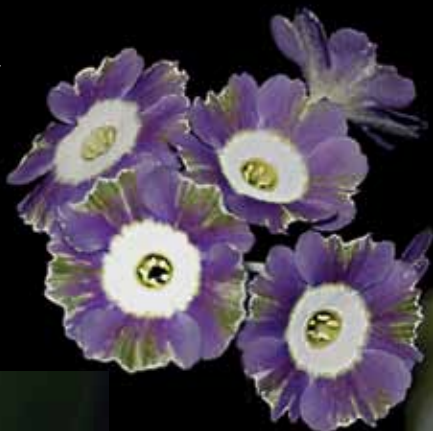
Fancy 'Crinoline York' (above)

We can only admire most of these, for they are not available in North America, though Pop's Nursery will ship to the U.S.