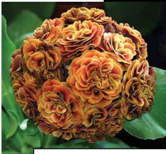
Tim Coop's Show Edge 'Ptarmigan' (below)