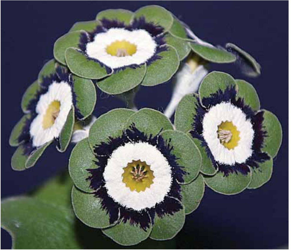
Show edge 'Prosperine', raised by the late Ken Whorton, is a cracker (above)