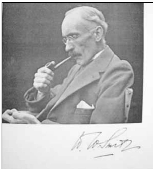
Smith's portrait and signature from the Biographical memoirs of the Fellows of the Royal Society