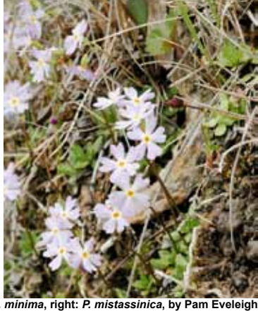
Photo, top: crevice garden, Below left: P. minima, right: P. mistassinica