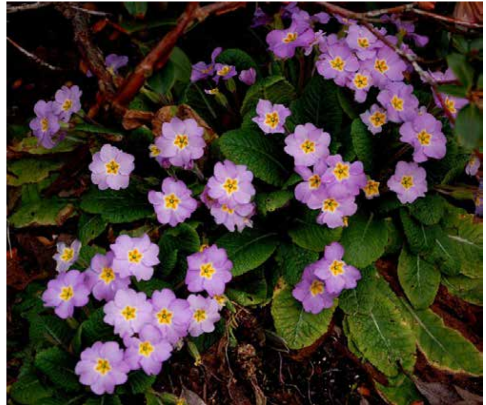
Facing page, top: Primula renifolia. Bottom: Primula juliae. This page, top: Primula grandis. Bottom: Primula sibthorpii.