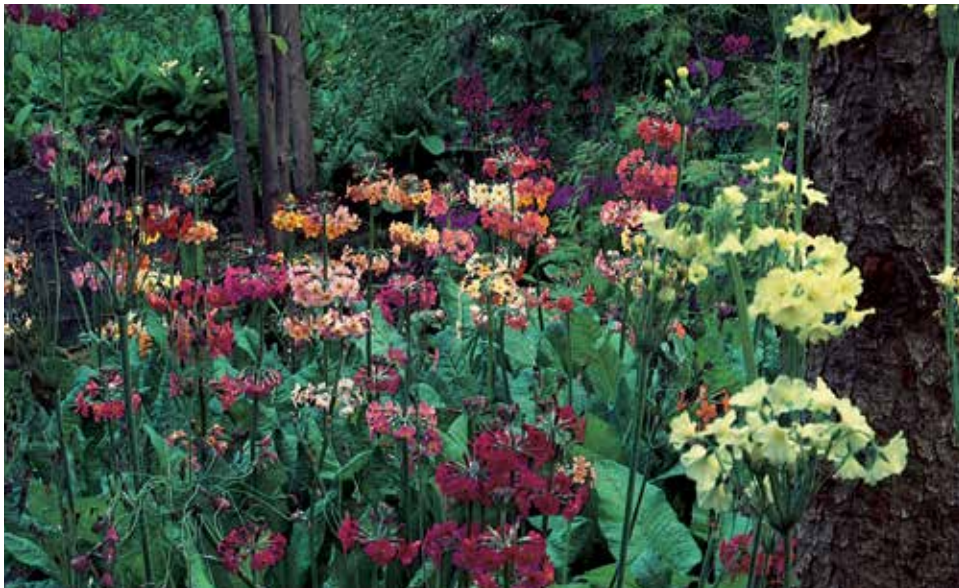
Facing page: Top left: Primula vulgaris ssp. sibthorpii with P. 'Wanda'. Top Right: A corner of the woodland garden with Primula japonica . Bottom: Candelabra primroses.