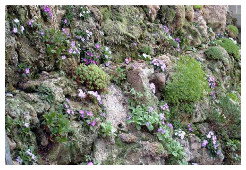
"Fooling both plants and garden visitors into believing that they are in the mountains is no easy matter. The tufa wall is

a sophisticated means of accomplishing this feat."