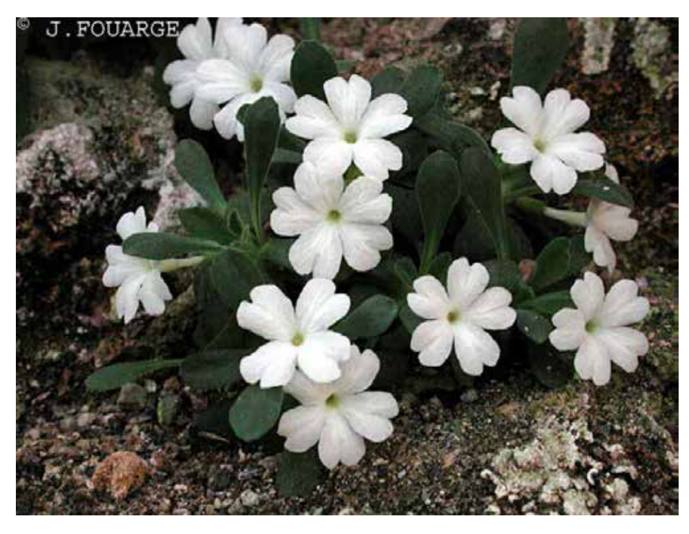
Growing Primula allionii on a Tufa Wall