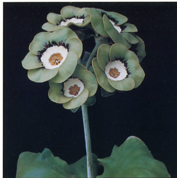
Green edged auricula 'Peter Klein.' Profile on page 30.