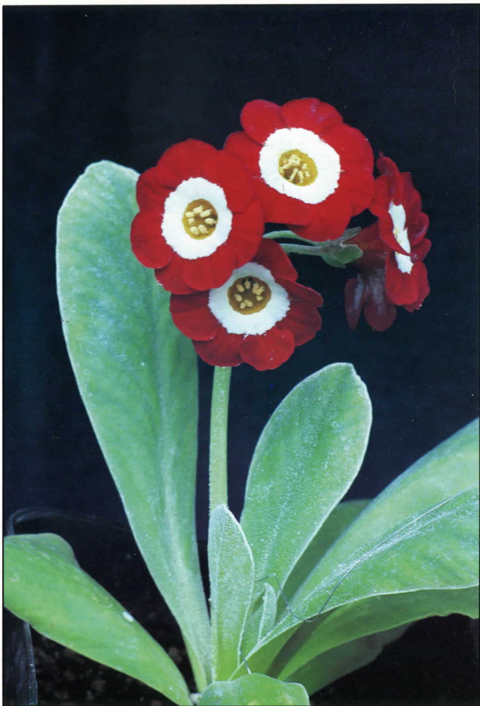
'American Beauty' a red show self. Profile on page 31.