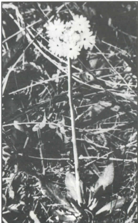
Primula incana.