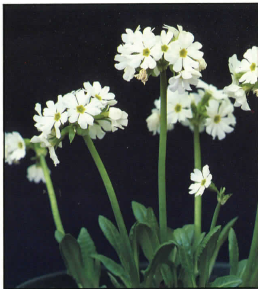
White Primula 'Peter Klein.' Profile on page 33.