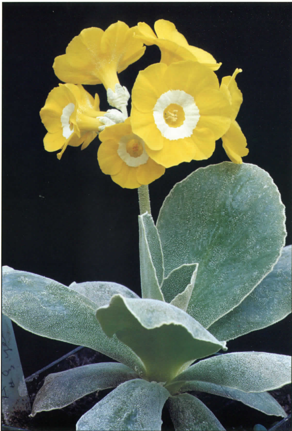
Show self auricula 'Mary Zach.' Profile on page 32.