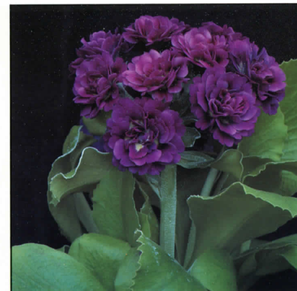
'Rapps Double Purple.' Profile on page 29.

The fiftieth anniversary issue of the American Primrose Society bulletin commemorates the founding of the society by capturing in color some of the fine and garden worthy plants developed by members of the society. All the plants shown on these pages are still cherished and grown today in gardens of American Primrose Society members.