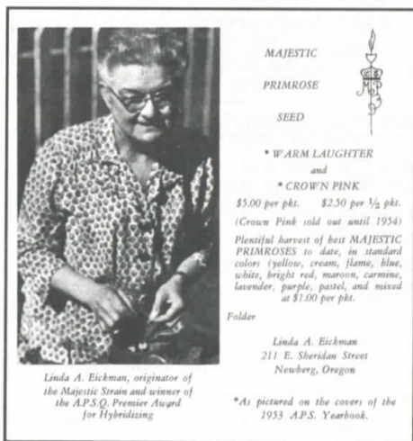
The ad for pink primroses.

There are still a few active members doing this important task today and they are to be