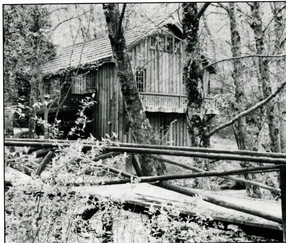
The barn at Barnhaven.