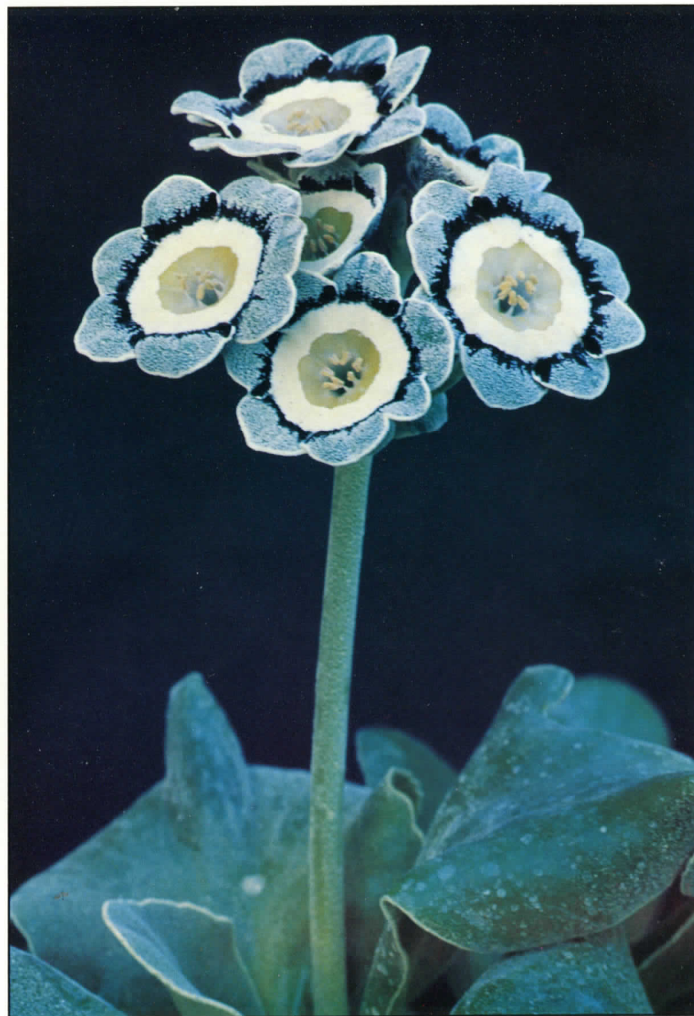
'Cornmeal' a show auricula. Profile on pages 31-32.