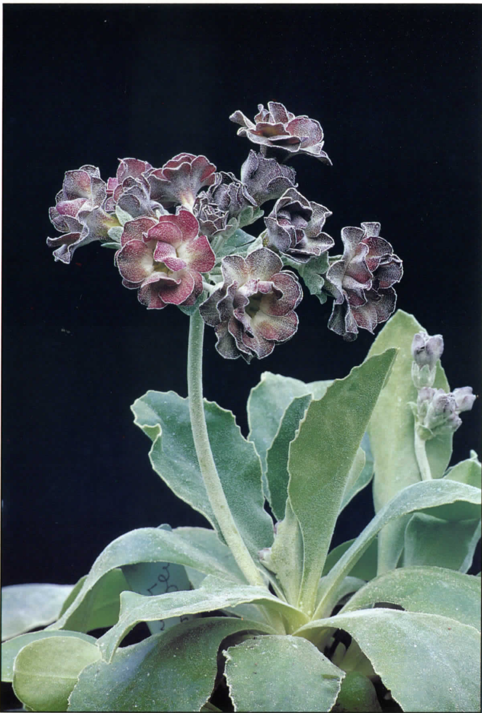
'Dusty Double.' Profile on page 30.