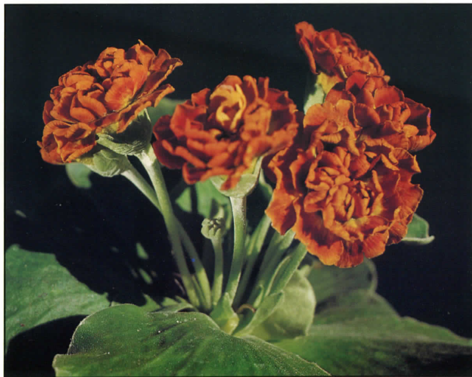
Double auricula 'Brownie.' Profile on page 31.