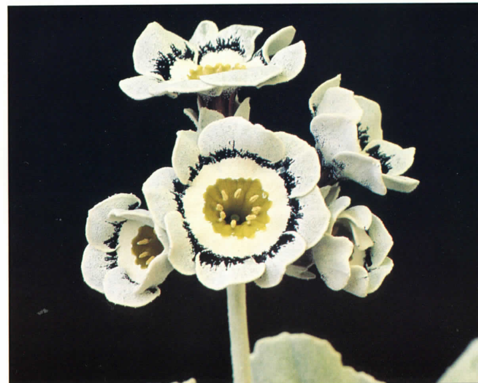
White edged show auricula 'Snow Lady.' Profile on pages 29-30.