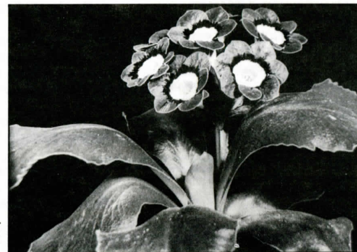
The green edged auricula 'Etha Tate.'