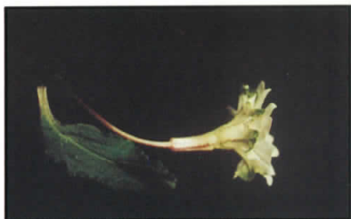
Hose-in-Hose primrose 'Feathers.' Profile on pages 32-33.