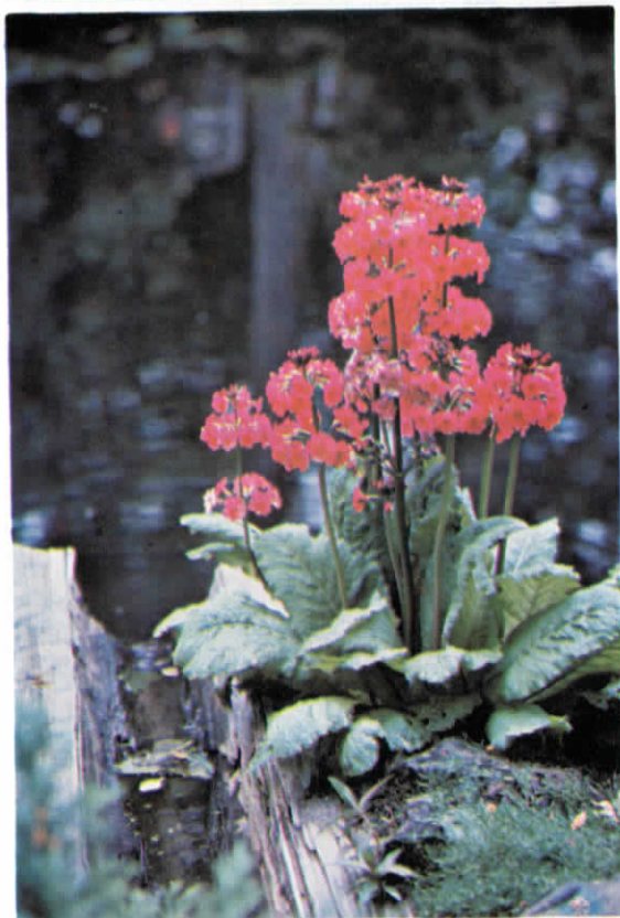
Primula Japonica at poolside