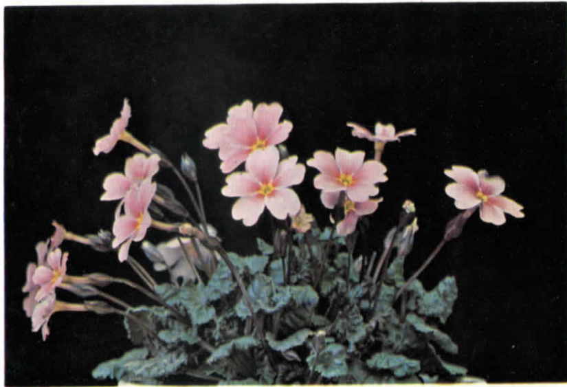
Juliana hybrid, Ida, tiny rockery jewel