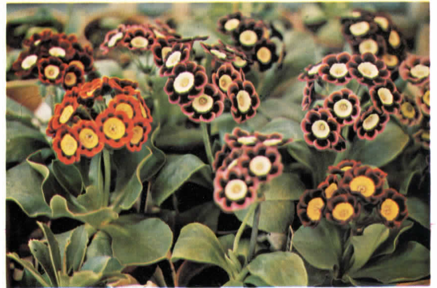
Alpine auriculas in an English greenhouse

Primulas offer colors and growth habits to suit any taste. Meeting their needs for growing conditions is a never-ending challenge. Here are examples: poolside, cool greenhouse, rockery and border.