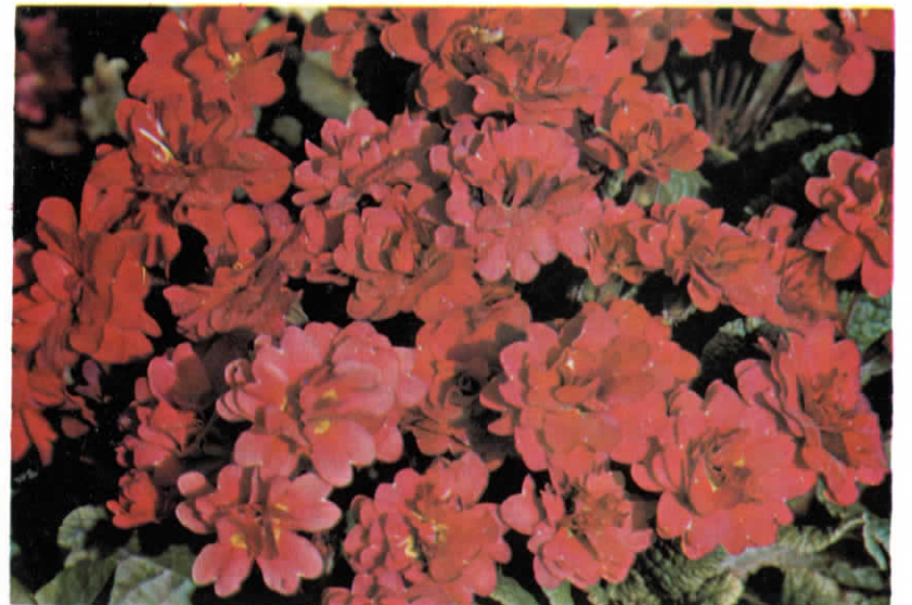
Double primrose dazzles spring border

Primulas offer colors and growth habits to suit any taste. Meeting their needs for growing conditions is a never-ending challenge. Here are examples: poolside, cool greenhouse, rockery and border.