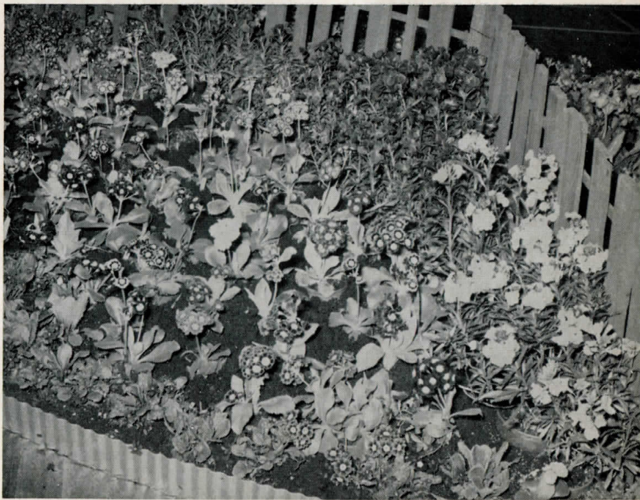
DISPLAY LOT OF AURICULAS — AT A SHOW HELD IN KIRKLAND, WASHINGTON

Wherever the areas of P. auricula and P. rubra coincide, as they often do, particularly in the Engadine, x P. pubescens is to be found. It is an even more variable plant having purple, violet, yellow or