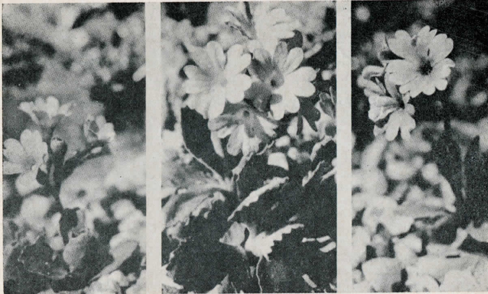
P. RUBRA X VISCOSA