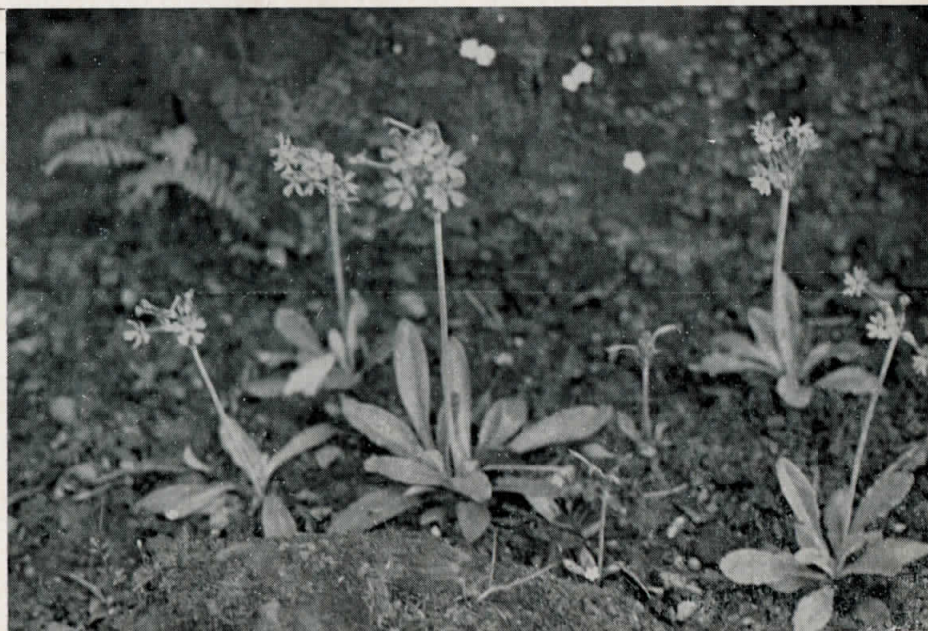
PRIMULA HALLERI FARINOSA

Some kind of soil dust added to your planting beds may save that much prized plant. P. Sieboldii should have soil added to their winter beds as these plants make a new crown each year, the old one dies and a new one comes on top of the old. They are quite shallow growing, so this puts the new crown at the top of the soil level, rains wash the crown out or frosts heave it loose. When you look for it in the spring it's gone. By adding more soil, our plants are there year after year. For best results divide the plants when dormant, they come apart easily then.