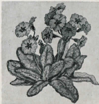
Pacific strain of Polyanthus Primroses . Fresh seed available now.