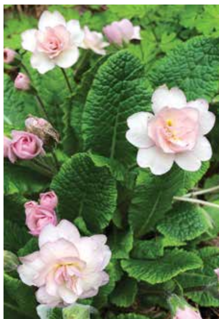
Growing to about six inches tall, 'Sue Jervis' is a pink, double-flowered hybrid primrose.

pression when planted in masses. That said, even singly they charm you into coming in for a closer look. As early bloomers (April/May), they can be grown between and at the base of larger perennials, that will provide them with shade later in the summer. From the bright lemon-yellow of cowslips to the intense jewel tones of the Barnhaven Cowichan strain, the diversity within this