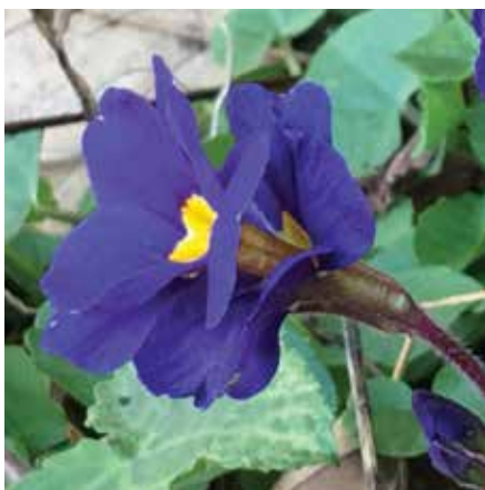
Above: Polyanthus ‘You And Me Blue’ exhibits a flower form known as “hose-in-hose.” Right: A mass planting of Japanese primroses produces a striking groundcover.

Juliana primroses, or Julianas ( Primula × pruhoniciana ), are hybrids of the common primrose with P. juliae , a creeping species that has roundish leaves. Juliana primroses are generally low-growing (under six inches), profuse bloomers, and vigorous growers. Some cultivars, like ‘Wanda’, create large masses with bright