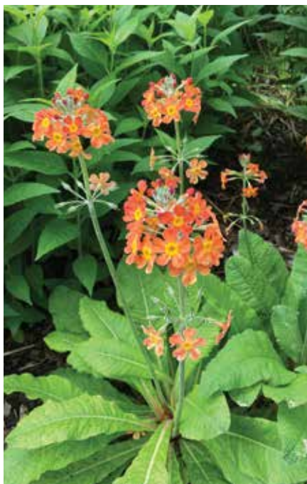
The candelabra inflorescences of P. ×bulleesiana come in an array of bright colors, including orange.

Primula kisoana is rhizomatous and can make a loose groundcover of fuzzy, shallow-lobed, heart-shaped leaves. It is said to love damp conditions, but I have grown it successfully in average-to-dry soil in shade. With eight- to 12-inch stems, P.