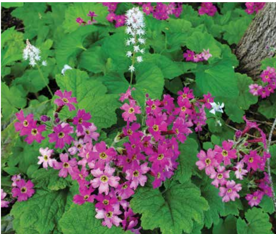
Primula kisoana grows companionably with foamflower ( Tiarella sp.), in this shade garden.

The pièce de résistance of the woodland group is Siebold primrose ( P. sieboldii ). This species comes in a mind-boggling variety of flower forms and white, pink, and lavender color variations. The leaves resemble those of P. cortusoides but are larger. The Japanese have cultivated this species for hundreds of years creating countless named varieties, many of which are available from mail-order nurseries. Growing from creeping rhizomes, it even-