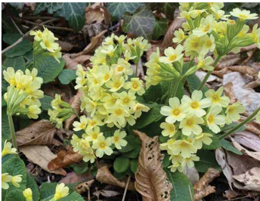
Yellow-flowered oxlips ( Primula elatior ) bloom earlier in spring than common primroses.

gardens since at least the 16th century. My goal is to introduce you to an assortment that can thrive in many regions of North America, adding color, fragrance, and interest from early spring to mid-summer, depending on species.