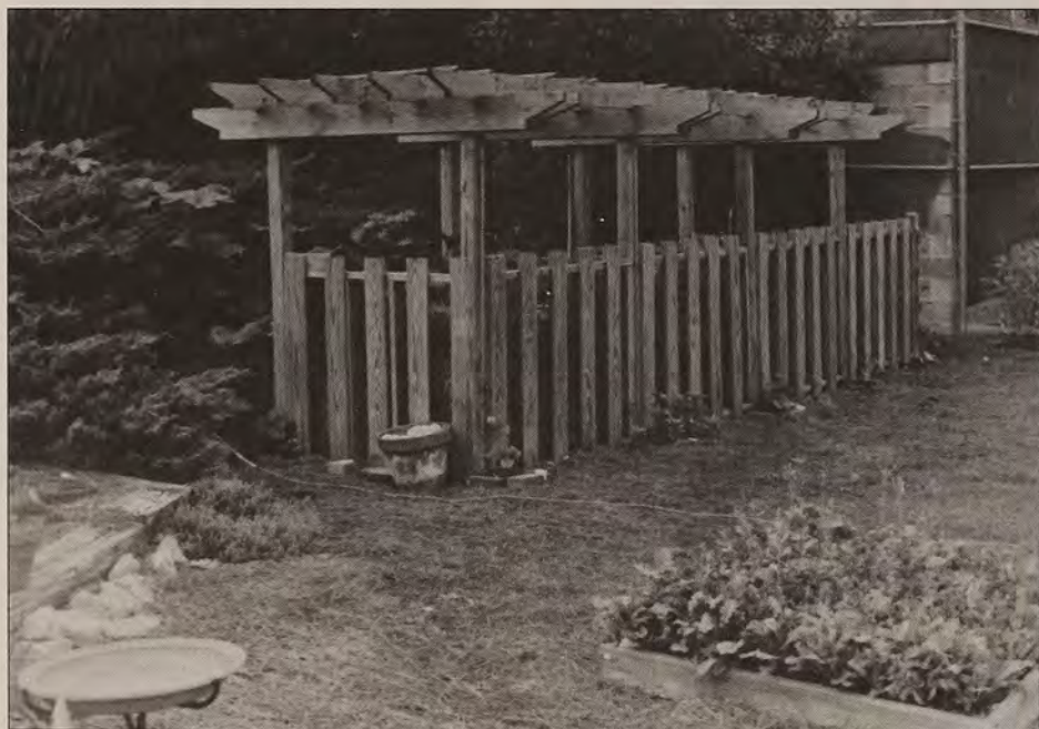
Fran Bull has grown tomatoes and gourds on the top of the "Compost Taj Mahal."

The audience gasped, less at the bright magenta flower on the vine than at the explosive power packed in those little beans: each of us had been given a packet of them as a souvenir. I suspect my husband will want me to plant mine on my side of the garden. —K. F.