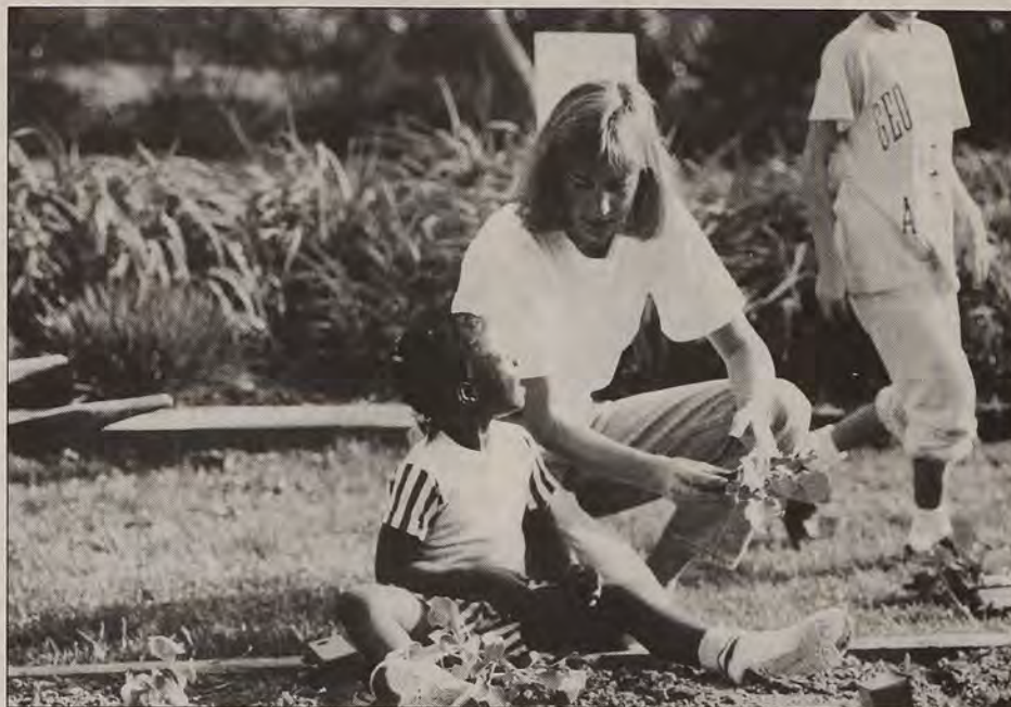
The Life Lab program uses gardens as living laboratories.

Students and teachers work together to transform bare school grounds and/or classrooms into garden laboratories. Depending upon resources and space, those educators having completed a Life