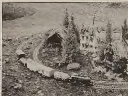
Toy trains rumble around miniature thatched cottages in the German exhibit.

unexpected places. The "Cone Heads" (loosely based on the characters from "Saturday Night Live") put in a brief appearance during the opening ceremonies and had everyone laughing. The four curious Cone Heads glided around the park inspecting camera rounds, taking pictures of tourists, and trying on hats that belonged to visitors, including one worn by a local policeman. The intergalactic visitors instantly befriended one of their own—a bald-headed man sitting in the bleachers—before they wandered off.