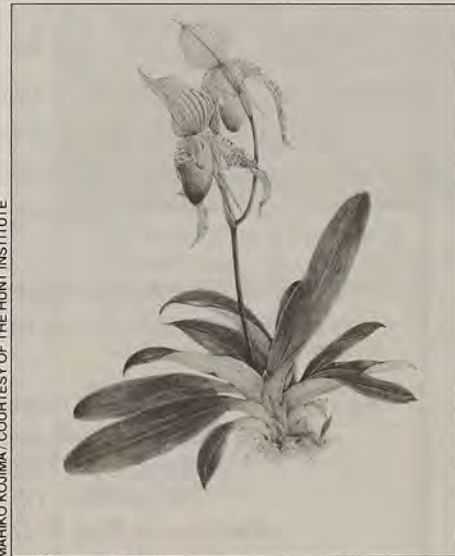
MARIKO KOJIMA / COURTESY OF THE HUNT INSTITUTE

At first glance these three drawings might appear to have been reproduced from some rare 16th- or 17th-century herbal. Although classical in style, they are the work of contemporary artists featured in the Seventh International Exhibition of Botanical Art and Illustration. Presented by the Hunt Institute for Botanical Documentation at Carnegie Mellon University in Pittsburgh, Pennsylvania, the exhibition will feature 90 artworks by 86 artists from Australia, Austria, Belgium, Brazil, Canada, Denmark, England, Germany, India, Japan, the Netherlands, the People's Republic of China, Scotland, South Africa, Sudan, the United States, the former U.S.S.R., and Vietnam. Many of the works displayed are part of the Hunt Institute's permanent collection of more than 30,000 watercolors, drawings, and prints, spanning from the Renaissance to the present. A division of Carnegie Mellon University, the institute houses one of the world's largest collections of botanical literature, art, and archival materials, and has become a popular research facility among botanists, artists, and academicians. The exhibition began on April 13 and runs until July 31, Mondays through Fridays. For more information, contact Saul Markowitz, (412) 268-7565.