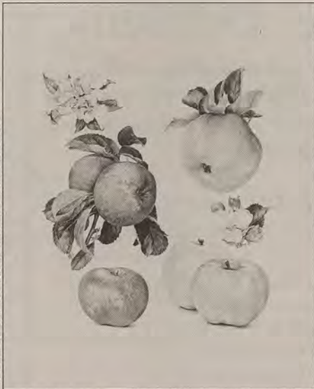
ROSANNE SANDERS / COURTESY OF THE HUNT INSTITUTE