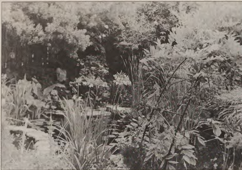
Water-loving plants are the centerpiece of Walter Bull's garden.