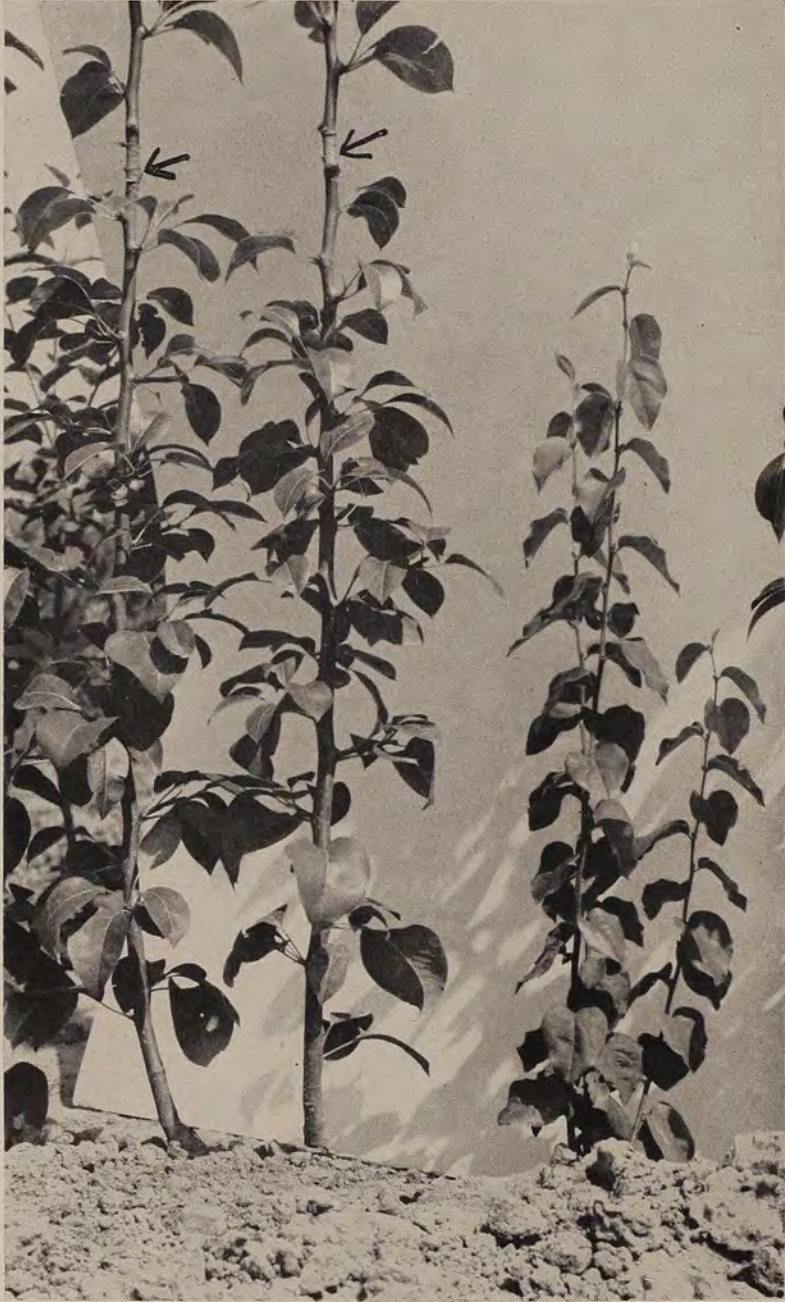
Figure 2. Quince rootstock (right) and one-year budlings of a compatible pear variety budded to a quince rootstock. Incompatible variety has been budded into the compatible one (arrow).