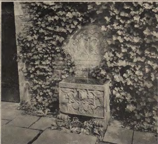
Selected ornamentals. Top, left: St. Francis in his niche; right: A corner of the tea garden overlooking the James River. Bottom, left: Copy of "The Birth of Venus" from the original in the Museo delle Terme in Rome; right: Wall fountain on the terrace opposite the music room, inscribed: Bibe et ande.

The Rose Garden during Garden Week in Virginia.