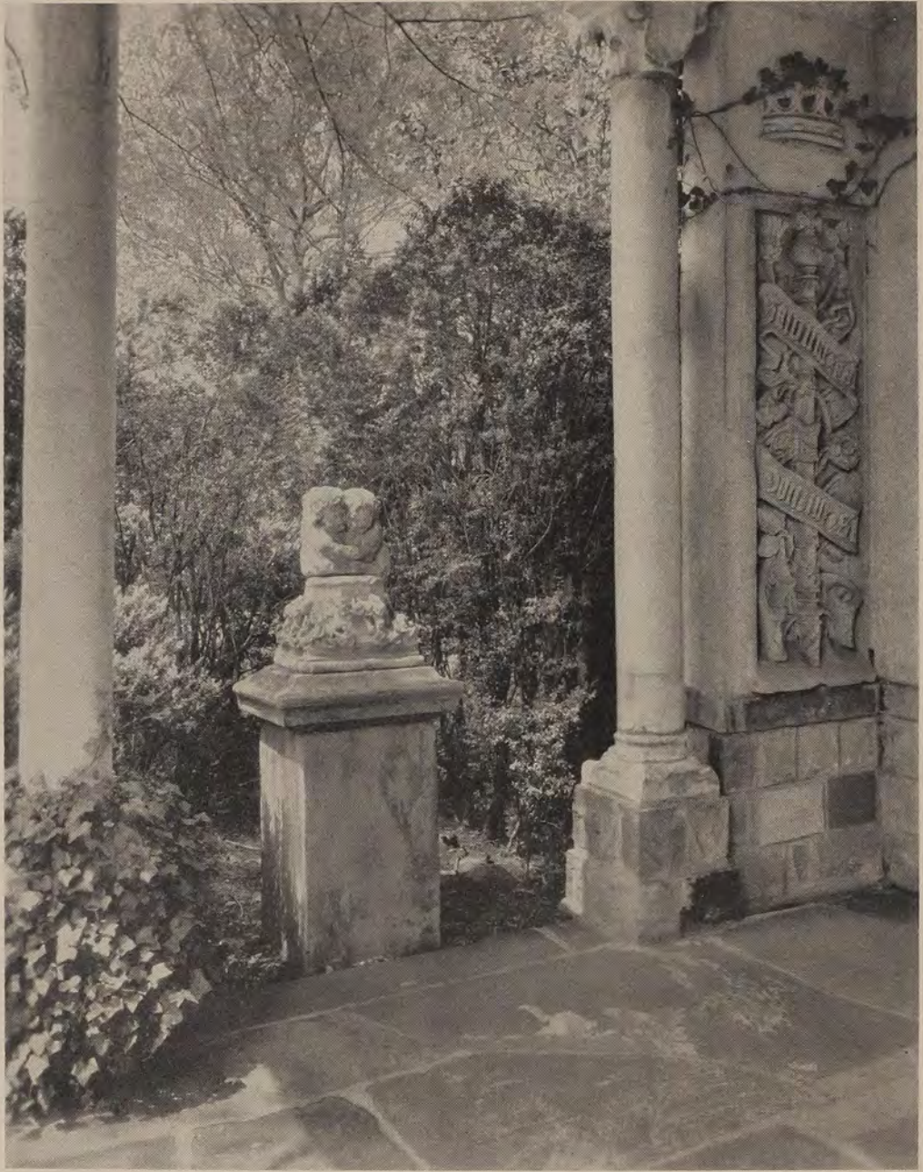
Looking west from the Loggia. The large stone tablet and the crown above it were at one time parts of the Houses of Parliament, and removed in the course of repairs. On the tablet are carved various symbols of sovereignty and a prayer for the King's safety: Salvum fac, Domine.