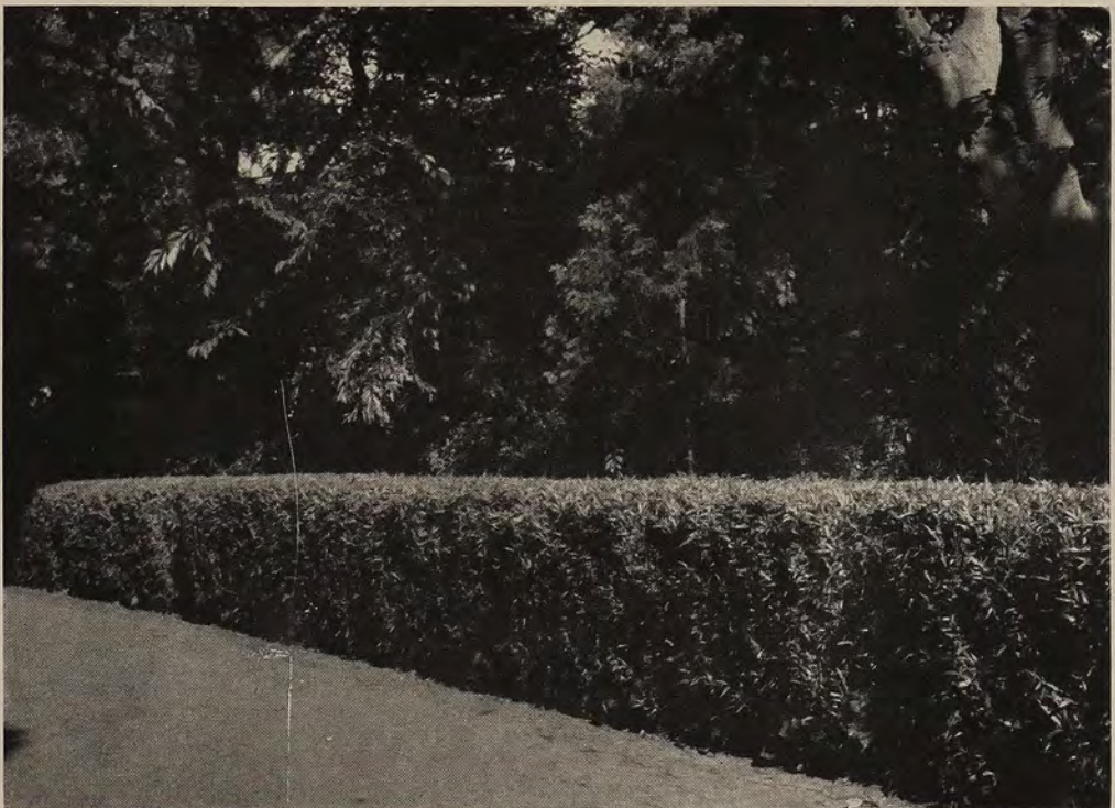
Clipped bamboo hedge.