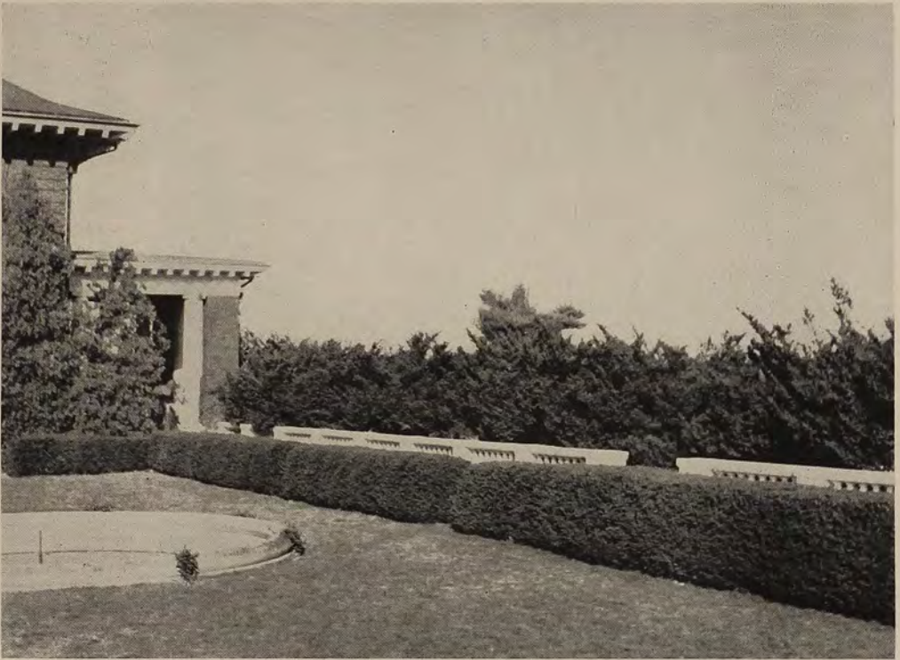
Taxus cuspidata hedge, Lancaster Institute of Horticulture, Lancaster, Massachusetts.