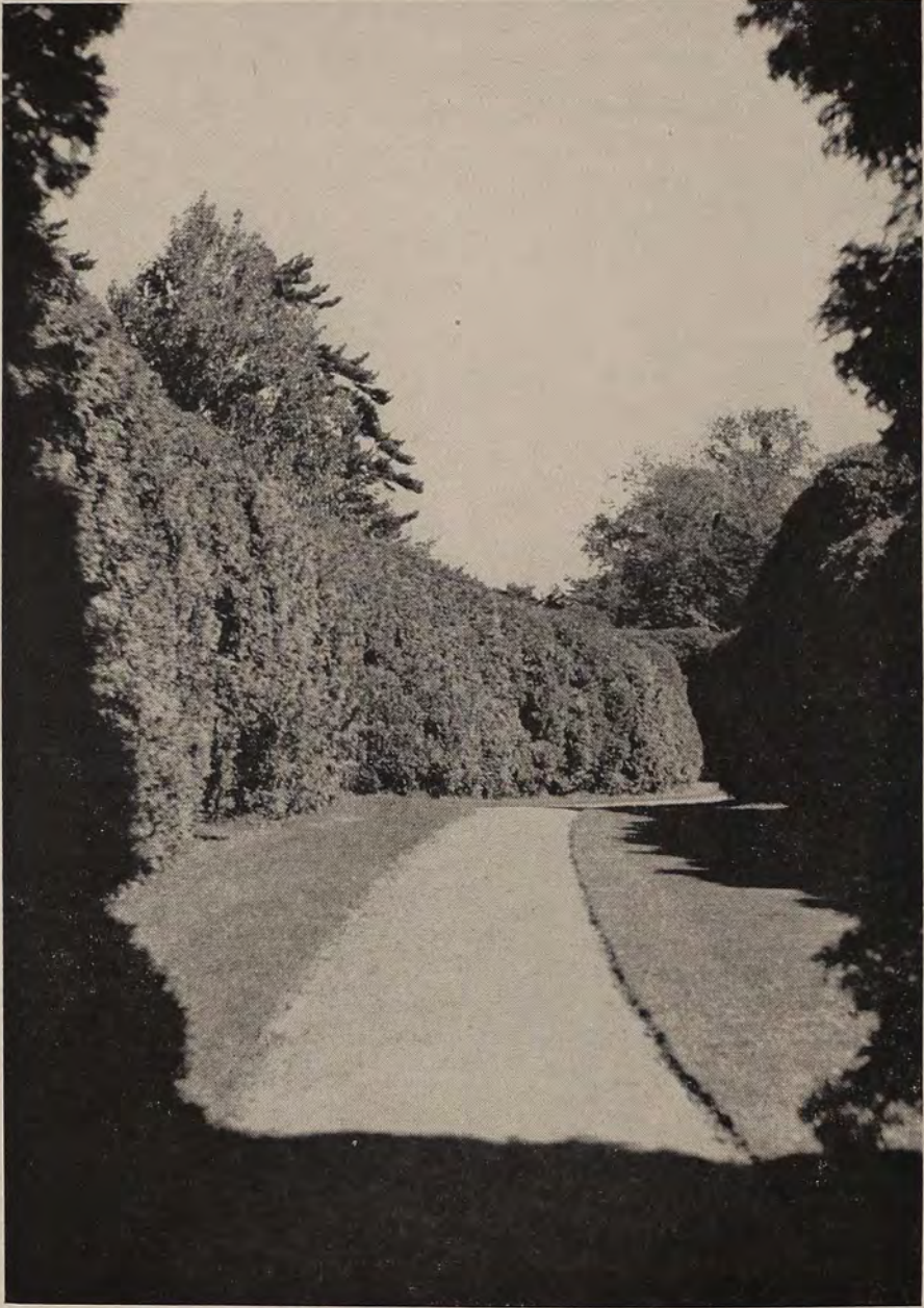
A well-defined hedge of Thuja occidentalis at Wellesley, Massachusetts.

(All illustrations prepared from photographs of the Arnold Arboretum)