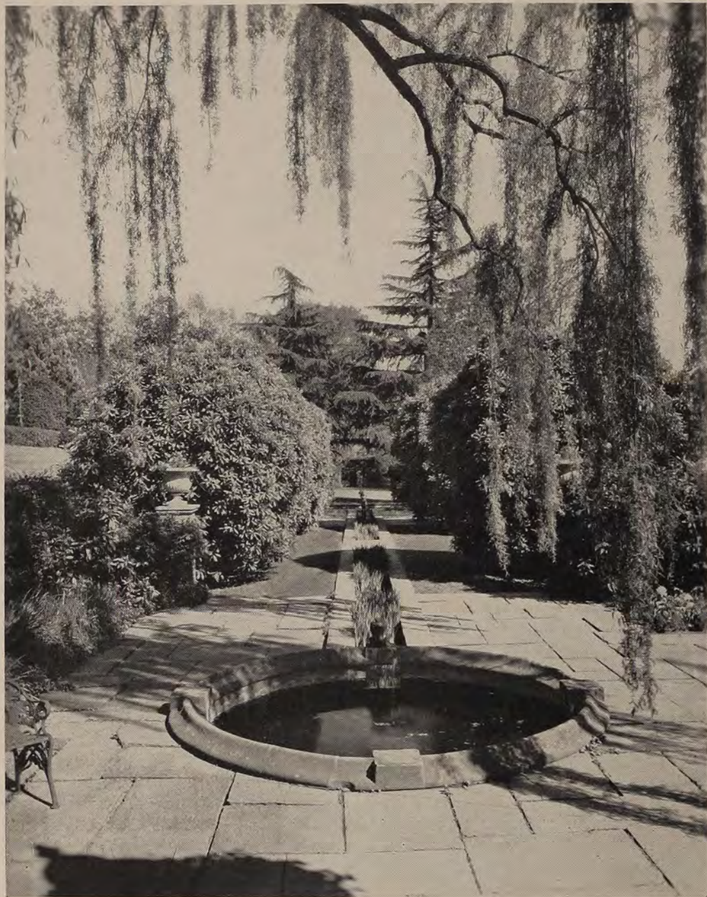
The Sunken Garden. Looking east from underneath the willow tree across the water garden (above). Looking west from the eastern end of the water garden showing the large plants of Photinias (opposite page, top). A view of the east end of the sunken garden (bottom).