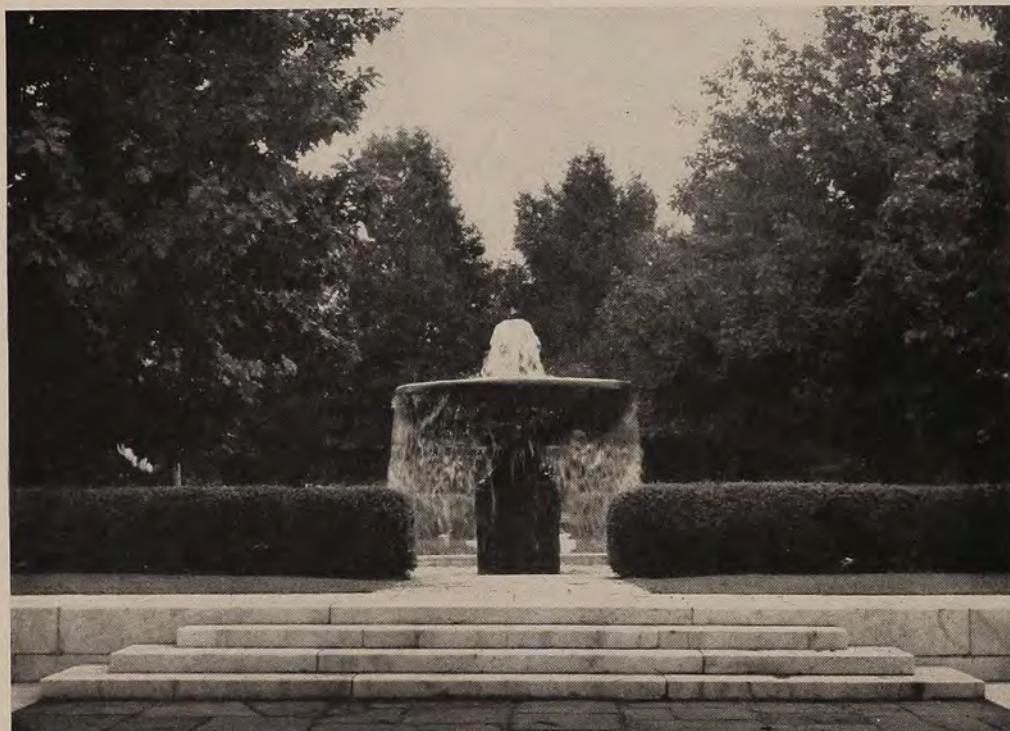
Ilex crenata hedge, Federal Reserve Building, Washington D. C.