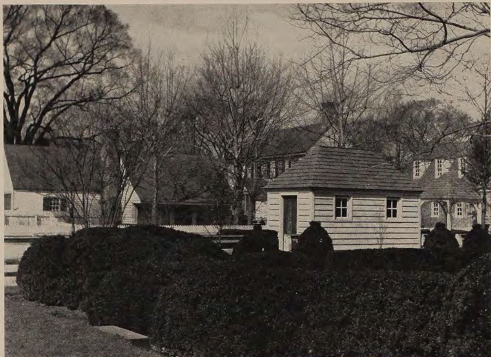
Buxus sempervirens suffruticosa , Williamsburg, Virginia.