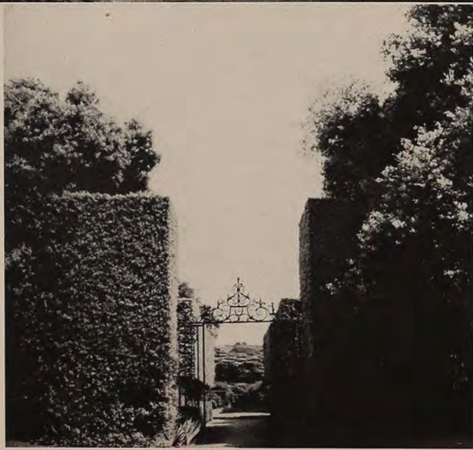
Passing the clipped Ilex aquifolium sentinels guarding the entrance to this charming garden in Hedcote, England (bottom), one will find a low-clipped hedge of Buxus serving as a border plant and then elegant specimens of Carpinus betula on their naked supports (center), Buxus sempervirens displaying the art of topiary and also clipped as boundary plants (top).