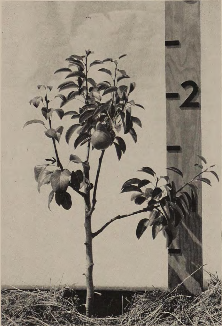
Figure 3. Dwarf pear tree, variety 'Bartlett' has been top worked on the many-branched interstock of 'Old Home.' Arrow, at left, points to the last remaining 'Old Home' branch which has been budded to 'Bartlett.' Branches on the right, budded the preceding year, are now bearing.