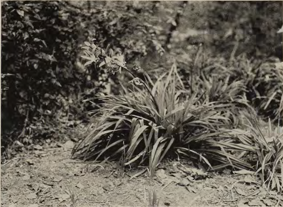
Juarez variety of daylily blooming during February. After becoming established some varieties bloomed almost every month during the year.

bloomed soon after they were planted, Aladdin in September and Theron in October 1946. Subsequently this plant of Aladdin died. The plant of Theron survived but has not bloomed again. Most of the varieties retained their foliage during the 1946-47 dry season, probably because they had passed through an enforced dormancy when dried for shipment, although in some varieties foliage was weak. None of the plants flowered during 1947 nor during 1948 up until June when the survivors were dug for transplanting to the mountain area. Several varieties went completely dormant during the winter dry season of 1947-48, and Aladdin, Brunette, Fulva Rosea, Minnie, and Zouave died. All surviving plants were considerably weaker than when received.