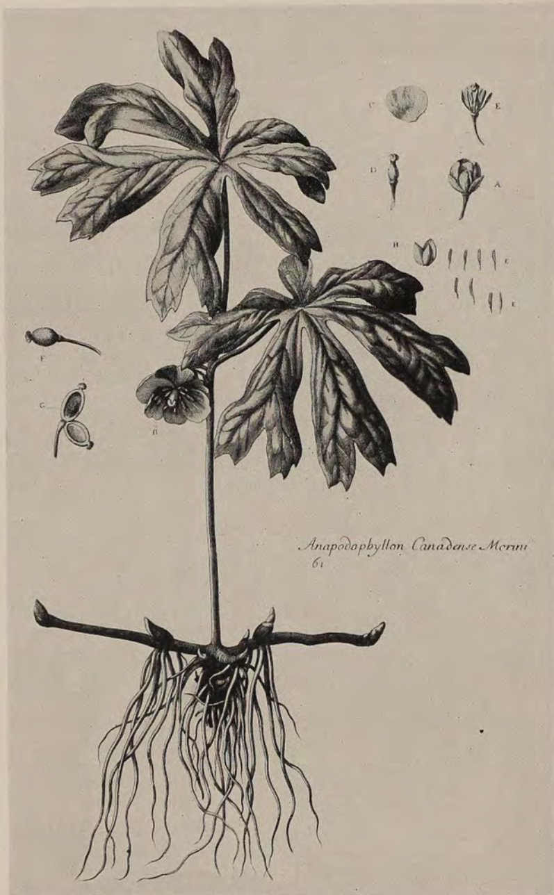
Plate by Nicolas Robert in the "Recueil des plantes gravées par ordre du roi Louis XIV," in the Bibliothèque Nationale, Paris. This collection of plates is not dated, but Robert's drawing was made from a plant in the Jardin de Blois, or Hortus Blesensis, probably between 1650 and 1660.