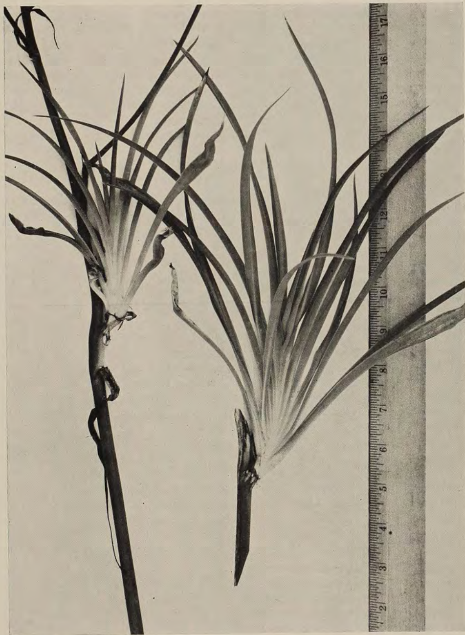
Some daylily varieties produce aerial plantlets from axillary buds on the flower scape. Note the roots on the plantlet at the right which has been prepared for planting directly in the ground.